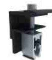
UNIVERSAL END CLAMP 2 clamps for modules from 30-45mm or 38-50mm thick