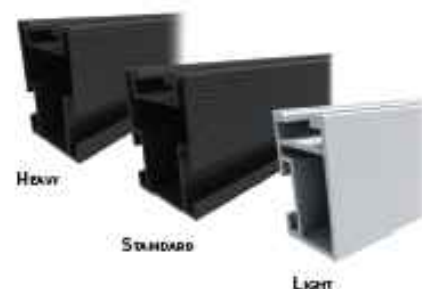
QRails come in two lengths — 168 inches (14 ft) and 208 inches (17.3 ft) Mill and Black Finish

QRail is engineered for optimal structural performance. The system is certified to UL 2703, fully code compliant and backed by a 25-year warranty. QRail is available in Light, Standard and Heavy versions to match all geographic locations. QRail is compatible with virtually all modules and works on a wide range of pitched roof surfaces. Modules can be mounted in portrait or landscape orientation in standard or shared-rail configurations.