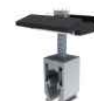
UNIVERSAL BONDED MID CLAMP 2 clamps for modules from 30-45mm or 38-50mm thick