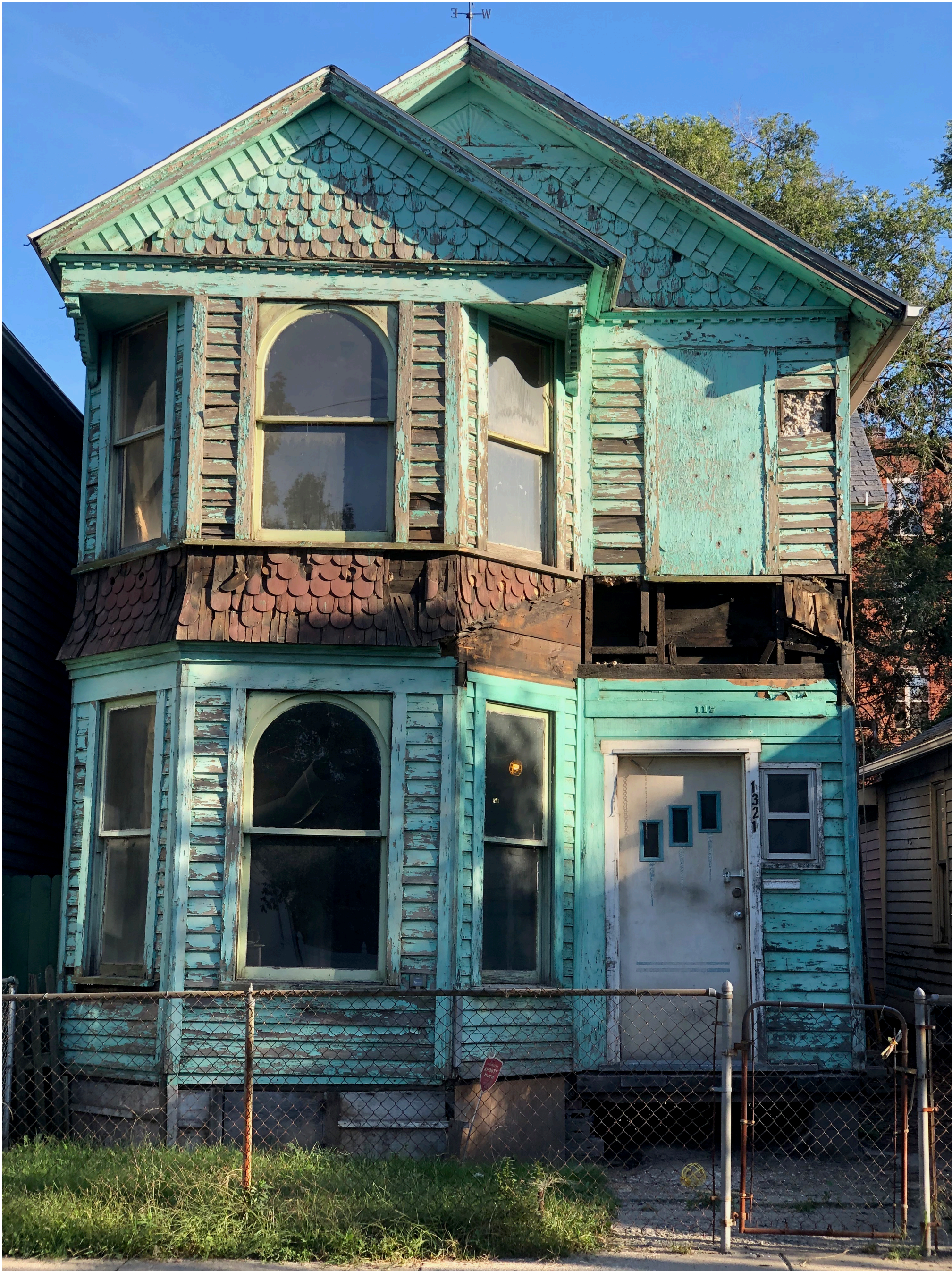
B EXISTING LABROSSE ELEVATION SCALE: 1/2" = 1'-0"