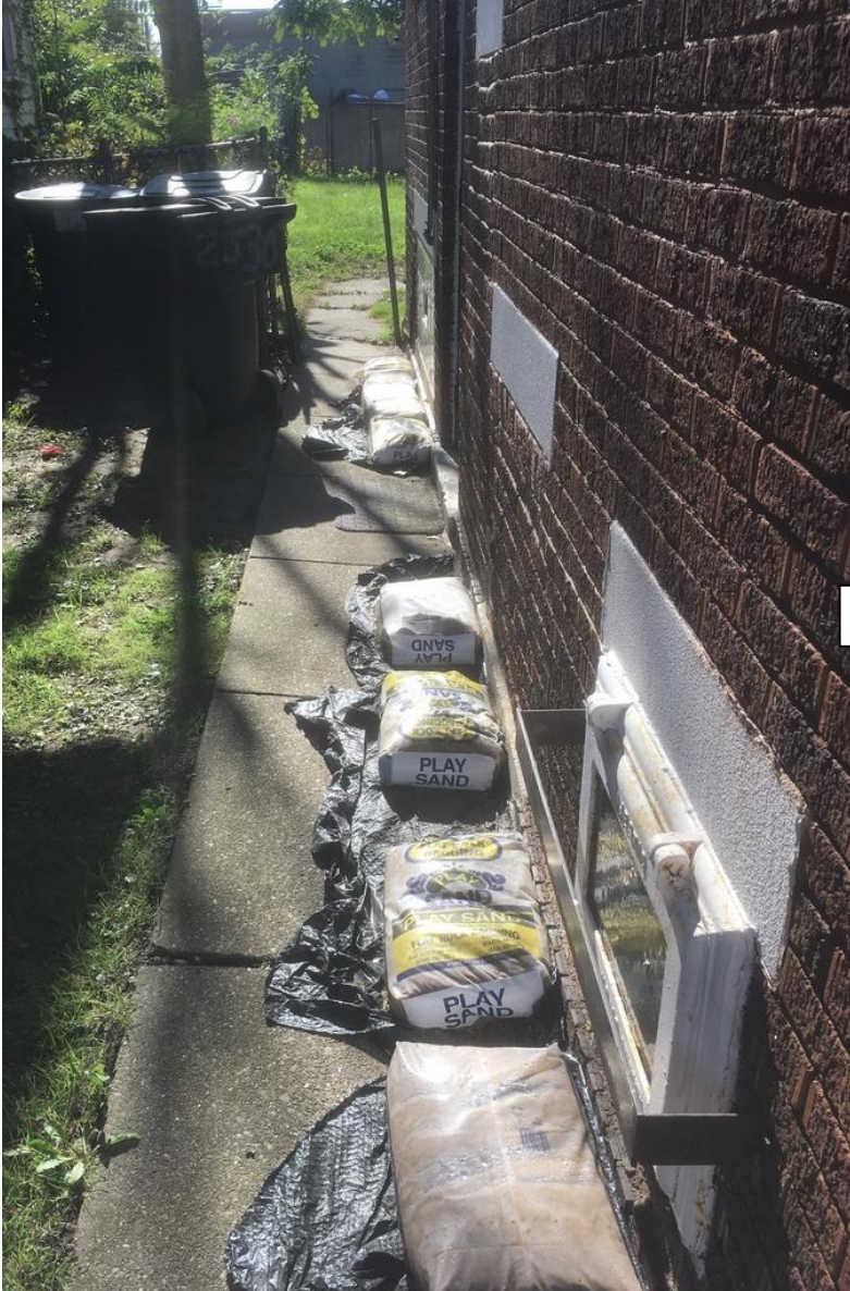
Service Walk – Damp Proofing (left)