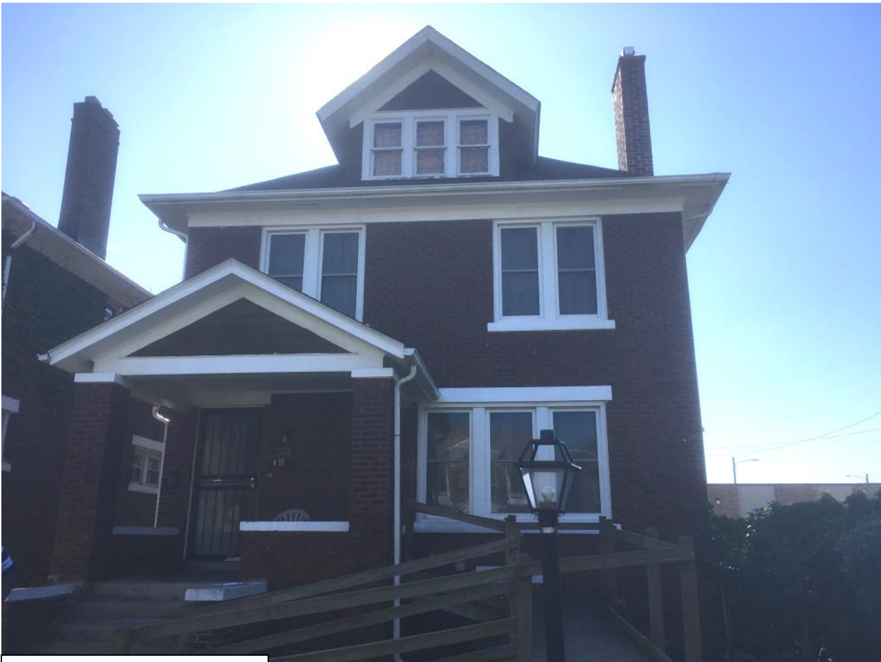
Front Elevation and Porch