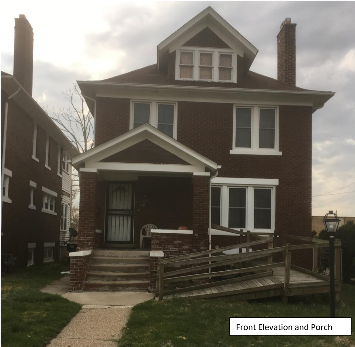
Front Elevation and Porch