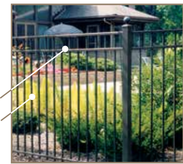
1.0" X 1.125" REINFORCED RAIL 0.625" PICKETS •

COMMERCIAL SERIES has larger-scale components for heavier-duty performance.