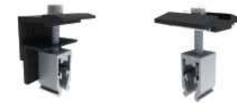
UNIVERSAL END CLAMP 2 clamps for modules from 30-45mm or 38-50mm thick