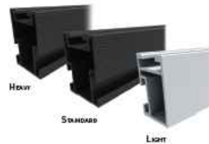
QRails come in two lengths — 168 inches (14 ft) and 208 inches (17.3 ft) Mill and Black Finish

QRail is engineered for optimal structural performance. The system is certified to UL 2703, fully code compliant and backed by a 25-year warranty. QRail is available in Light, Standard and Heavy versions to match all geographic locations. QRail is compatible with virtually all modules and works on a wide range of pitched roof surfaces. Modules can be mounted in portrait or landscape orientation in standard or shared-rail configurations.