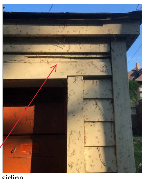
damaged, cracked siding