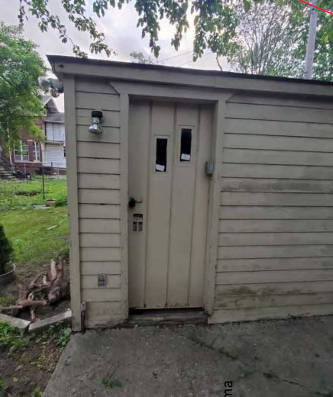
damaged, deteriorated siding and trim