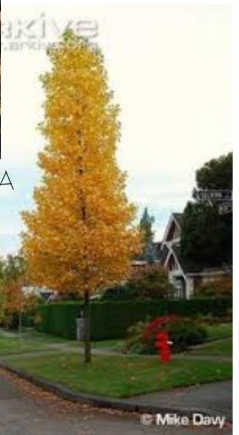
COLUMNAR TULIP TREE