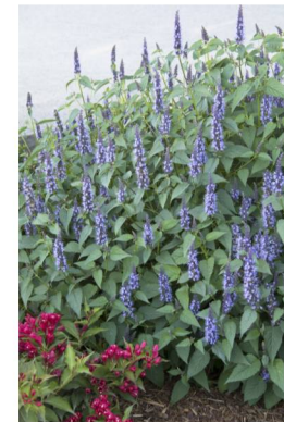
AGASTACHE 'LITTEL ADDER'