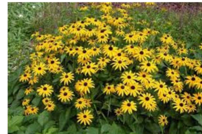
BLACK EYED SUSAN