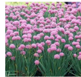
ALLIUM 'MINI MILL'

2 ARNOLD TULIP TREE 10 'LITTLE LIME' PANICLE HYDRANGEA 25 GREEN VELVET BOXWOOD GREEN RIVER STONE OUTCROP