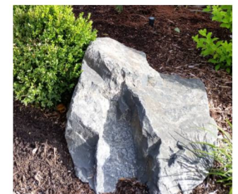
GREEN RIVER BOULDER