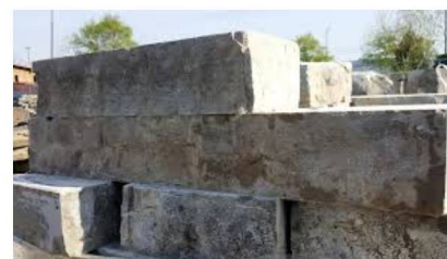
CANADIAN FINISH STONE