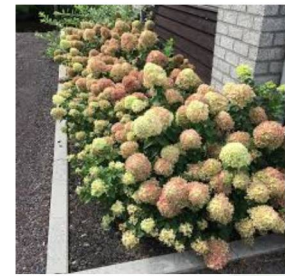
'LITTLE LIME' HYDRANGEA