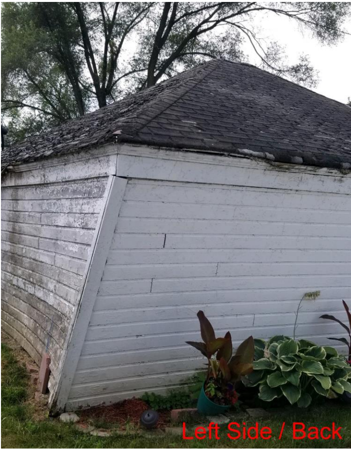
Left Side / Back