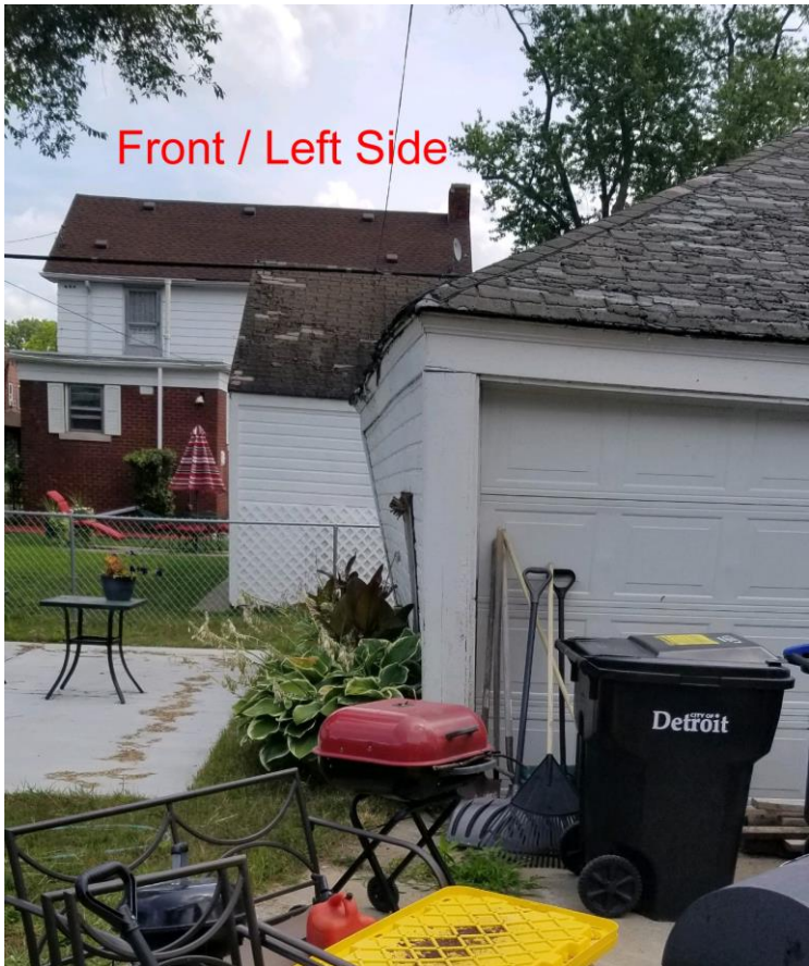
Front / Left Side