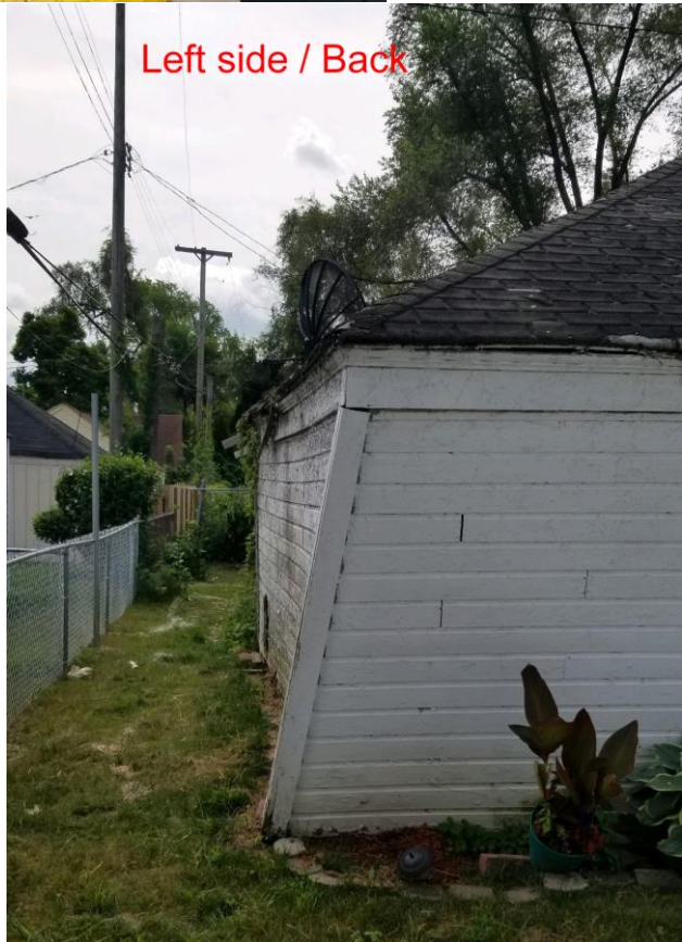
Left side / Back