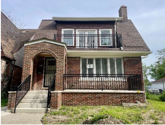
north elevation,