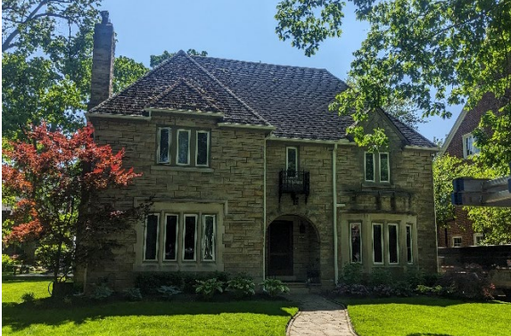
Staff photo, Front View, 05/28/26