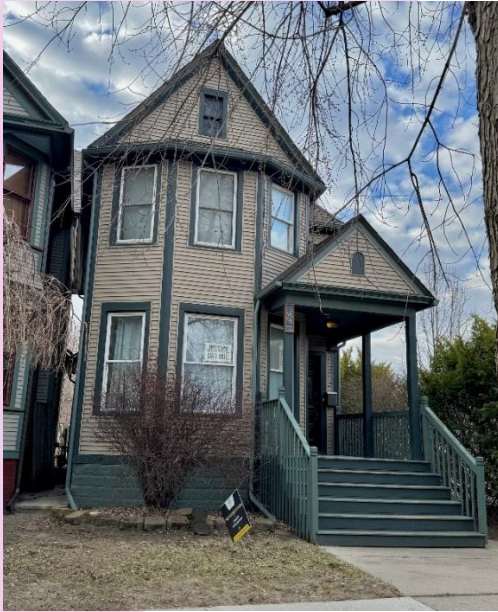
Staff photo, looking south, 03/19/2026