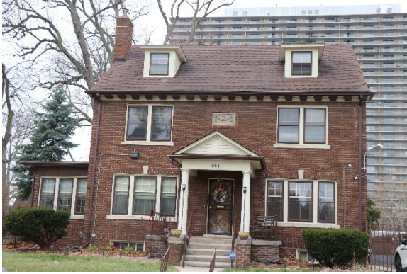
Staff photo, front view, 03/23/2026