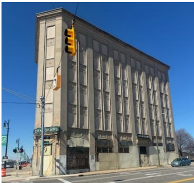
● 2411 14 th Street, facing northwest. HDC staff, 03/26/2026