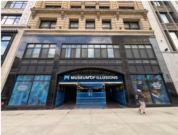
Staff photo, Woodward Avenue recessed building entrance, 03/19/2026

revolving door opening which is enclosed with a three-sided storefront system; an operational single door mullied with one sidelight is located on either side of the central opening. The entrance doors, sidelights and storefront system have clear glass within the frames.