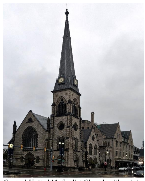
Central United Methodist Church with original 1866–1867 church building in foreground. View northeast from the intersection of Woodward and Adams. November 2024 photo by staff.