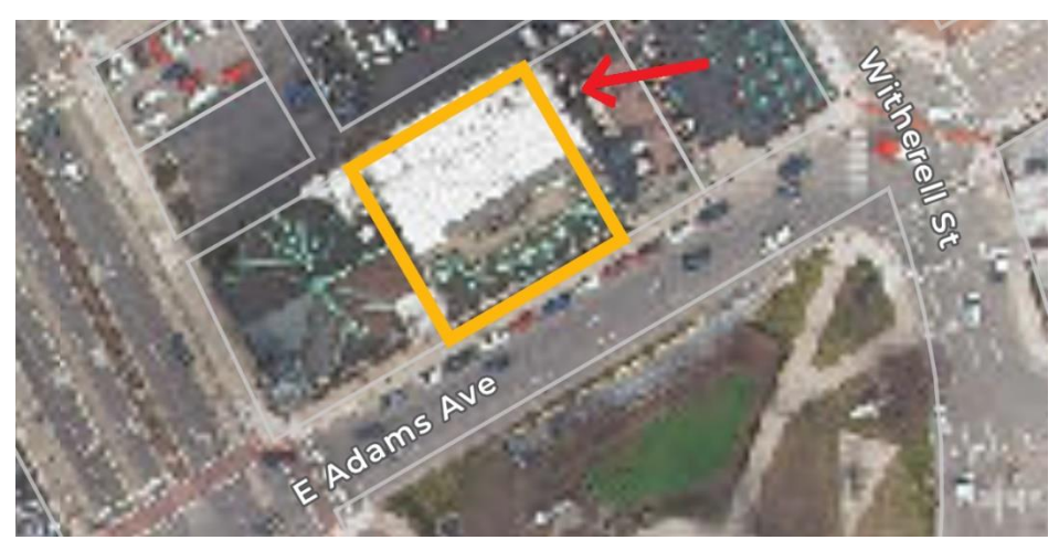
Detroit Parcel Viewer image of Central United Methodist Church with yellow box highlighting the portion of the building known as 31 E. Adams. Red arrow added to indicate approximate location of proposed work.