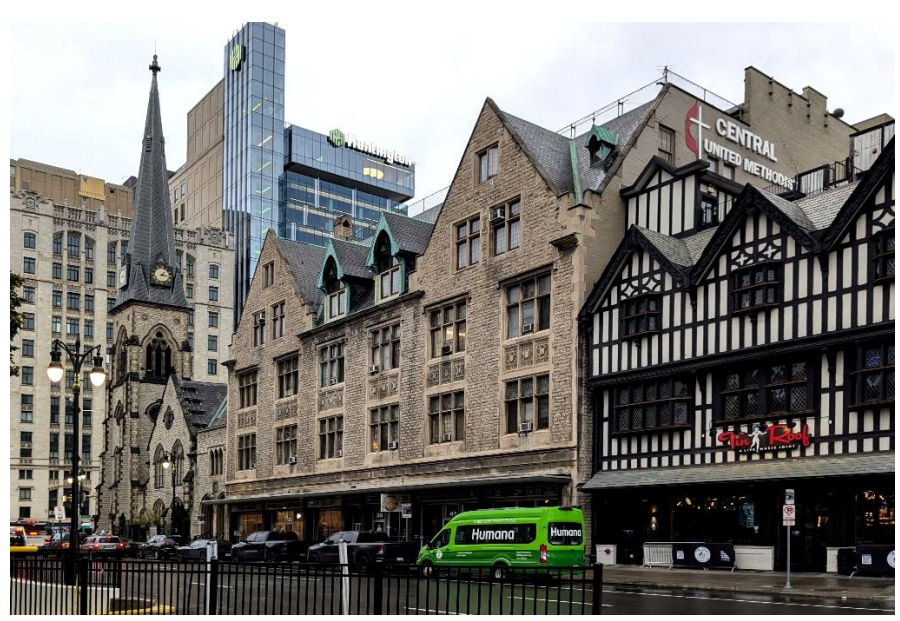
Central United Methodist Church with 1914–1916 addition (31 E. Adams) in foreground, center of image. November 2024