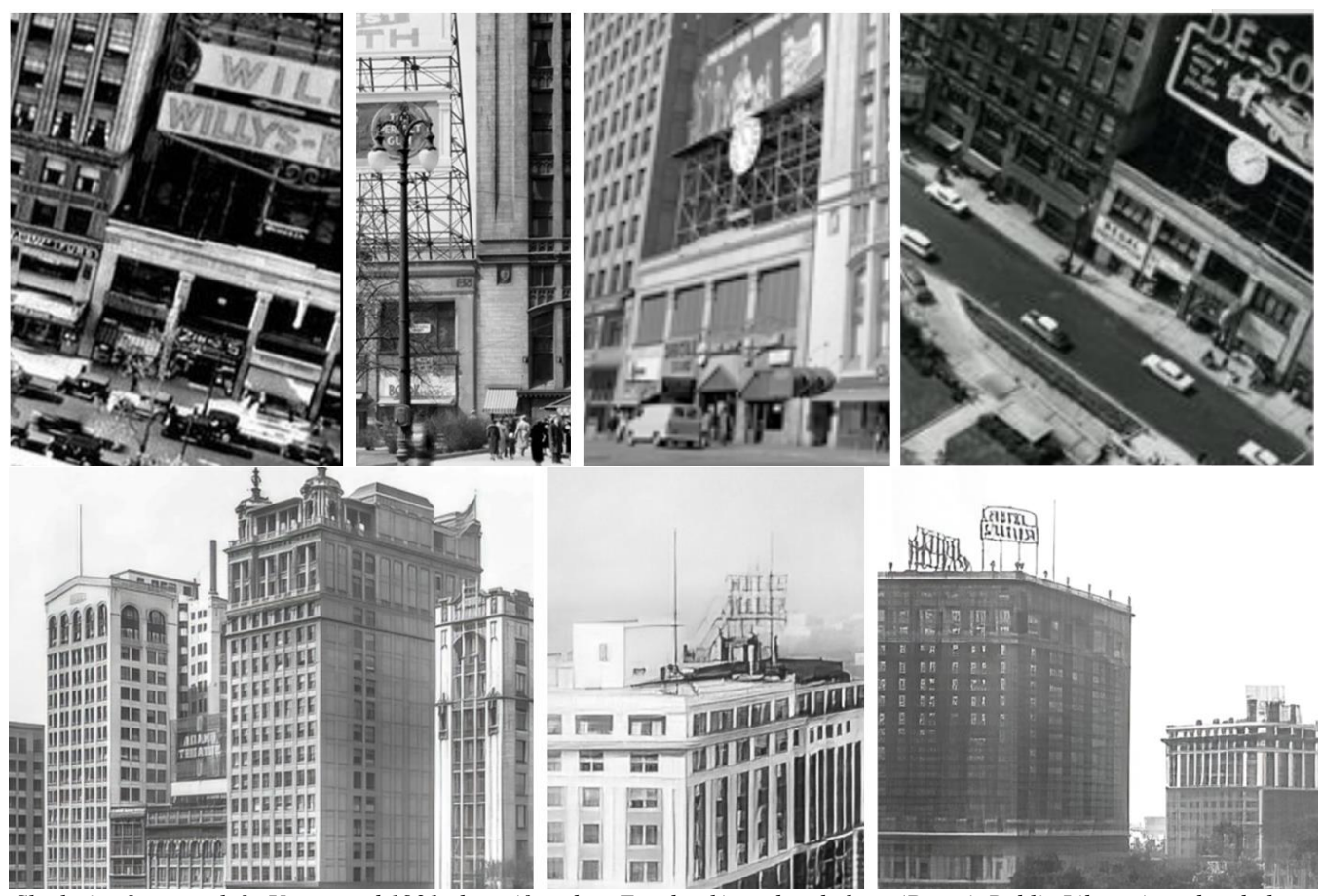
Clockwise from top left: Unsourced 1931 photo (found on Facebook), undated photo (Detroit Public Library), undated photo (Detroit Public Library), 1957 photo (Detroit Historical Society), circa 1920 photo (source not known, from historical Facebook), undated photo (Detroit Public Library), 1920s photo (Detroit Public Library).