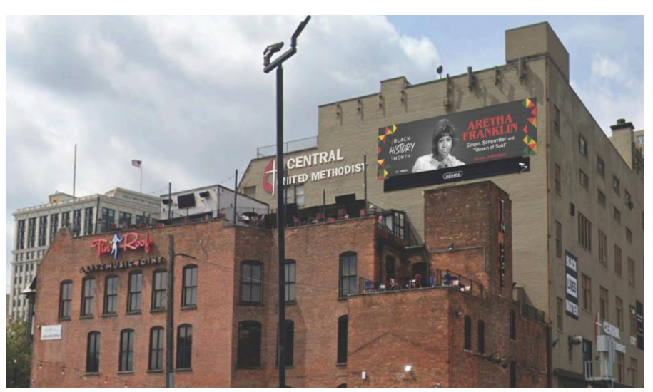
Rendering of proposed sign. Note that the rendering depicts the sign mounted flush with the building; the narrative scope states that the sign would be "placed at an angle to maximize visibility from nearby streets."