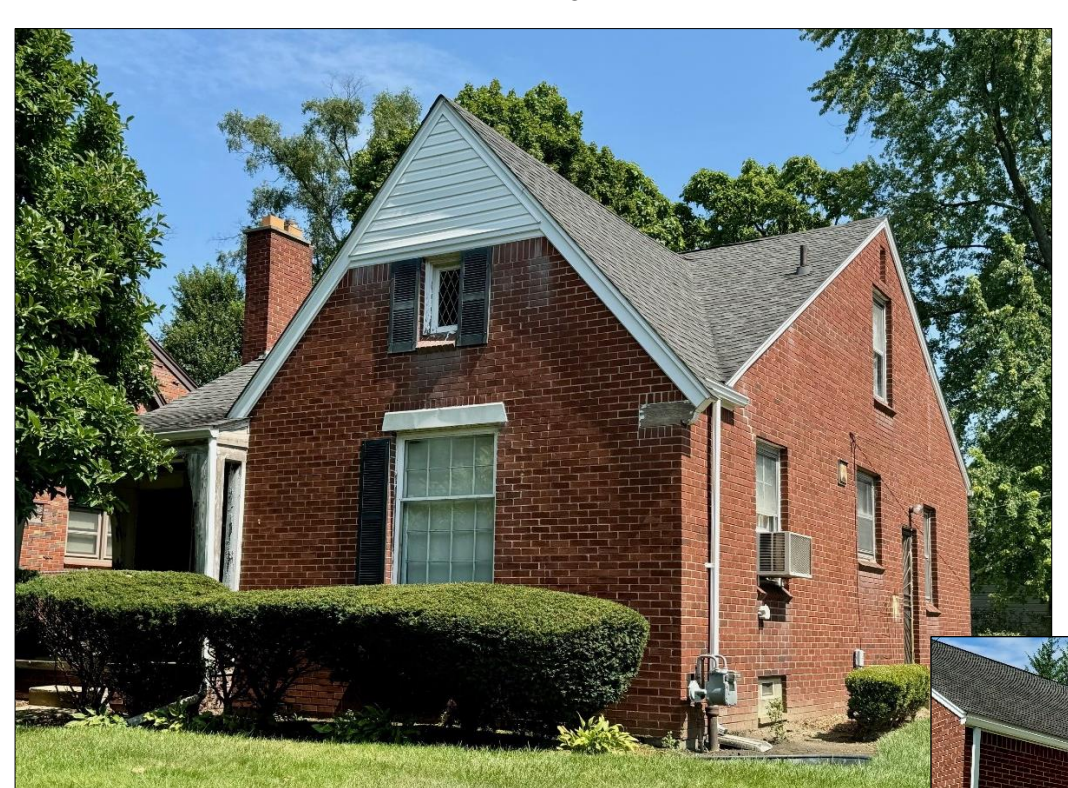
Above: Front and south side walls. A window ac unit is in the lower half of the 6-over-6 double-hung opening. Staff photo, August 27, 2024.

All of the window openings within the four sides of the masonry walls have a rowlock course of bricks that serve as the window sill. One window on the south side wall has a 6-over-6 pattern, and the remaining windows on the sides and rear are one-over-one double-hung units.