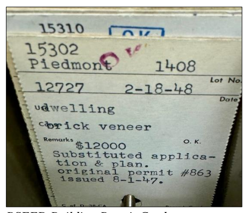
BSEED Building Permit Card

• The house was erected in 1948 and, according to the 1950 Sanborn map, did not include a rear porch or extension. Staff did not find a record of when the rear addition was erected. However, according to an October 2007 Google street view image, it was in place at time of district designation.