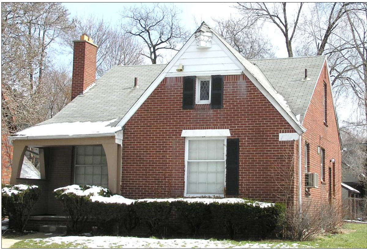
2007 designation photo

• The Rosedale Park Historic District was enacted on February 19, 2007.