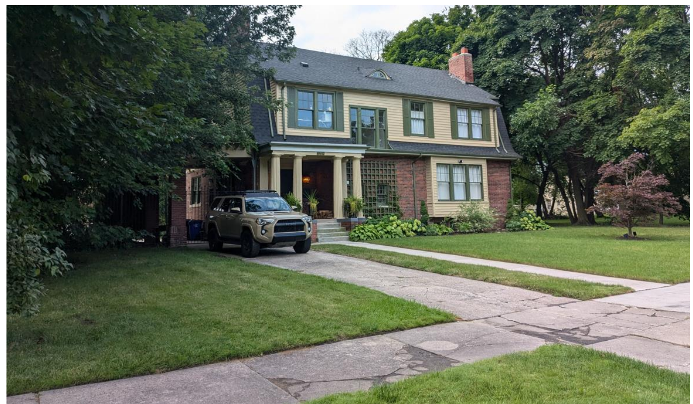
July 2024 photo by staff.

SCOPE: INSTALL CONCRETE PAVEMENT IN FRONT YARD