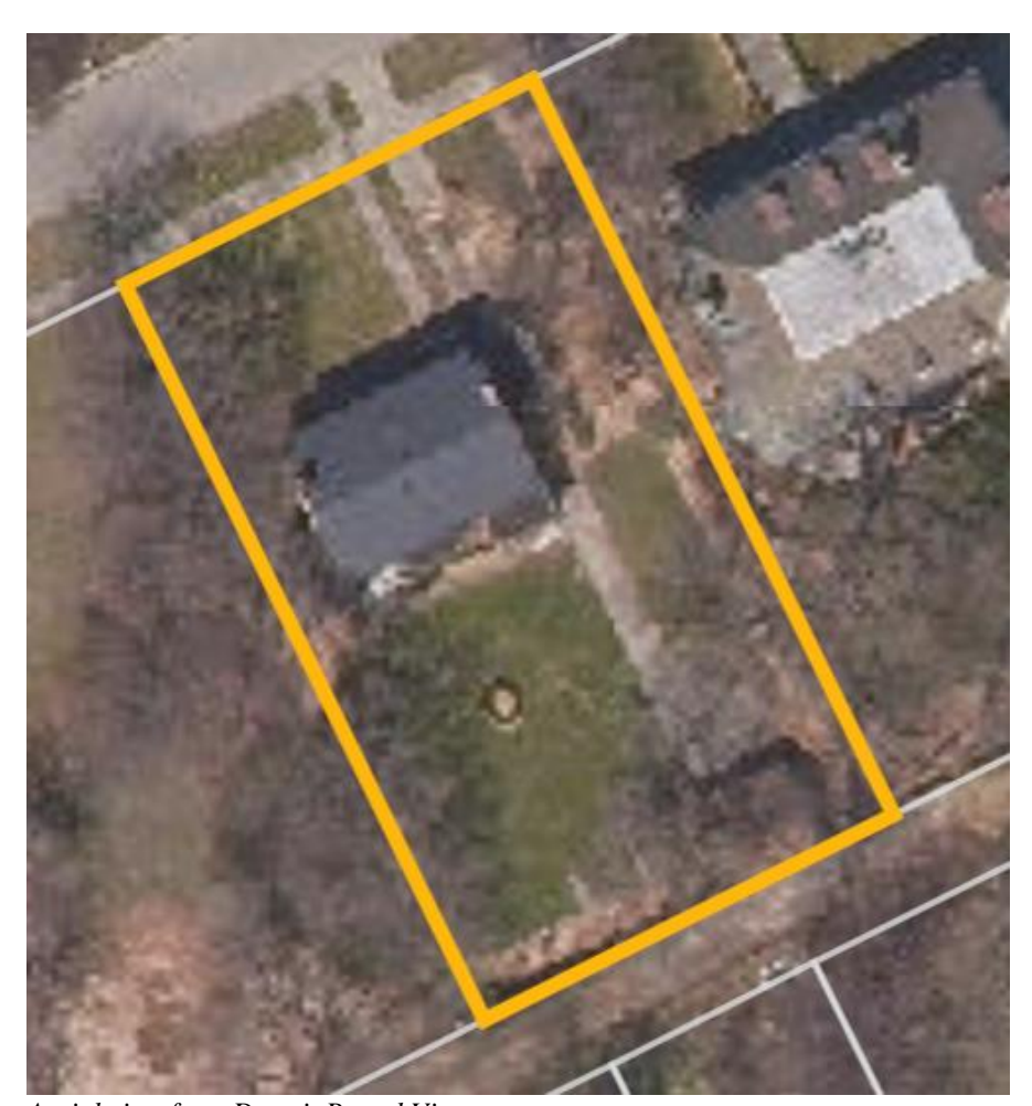
Aerial view from Detroit Parcel Viewer.