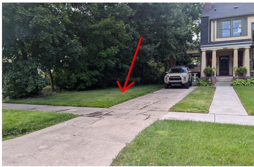
August 2024 staff photo with arrow added to indicate approximate location of proposed pavement.