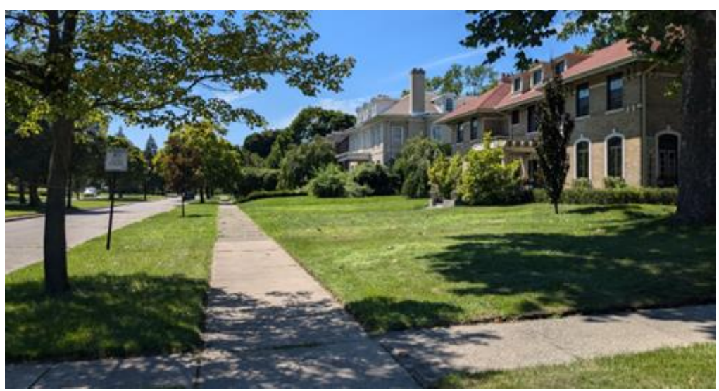
The 100 block of Arden Park Boulevard, looking west. August 2024 staff photo.