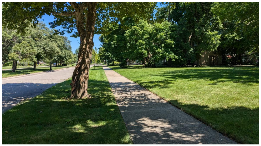
The 100 block of Arden Park Boulevard, looking east toward the subject property. August 2024 staff photo.