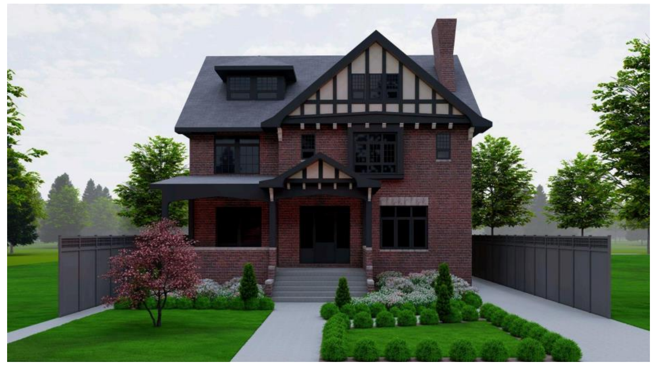
Rendering of proposed work. Image from application documents. (Note that the fence shown in the rendering has been reduced in scale and is subject of a separate administrative approval.)

The proposal is to enlarge the driveway (work already completed). Changes to landscaping are also proposed.