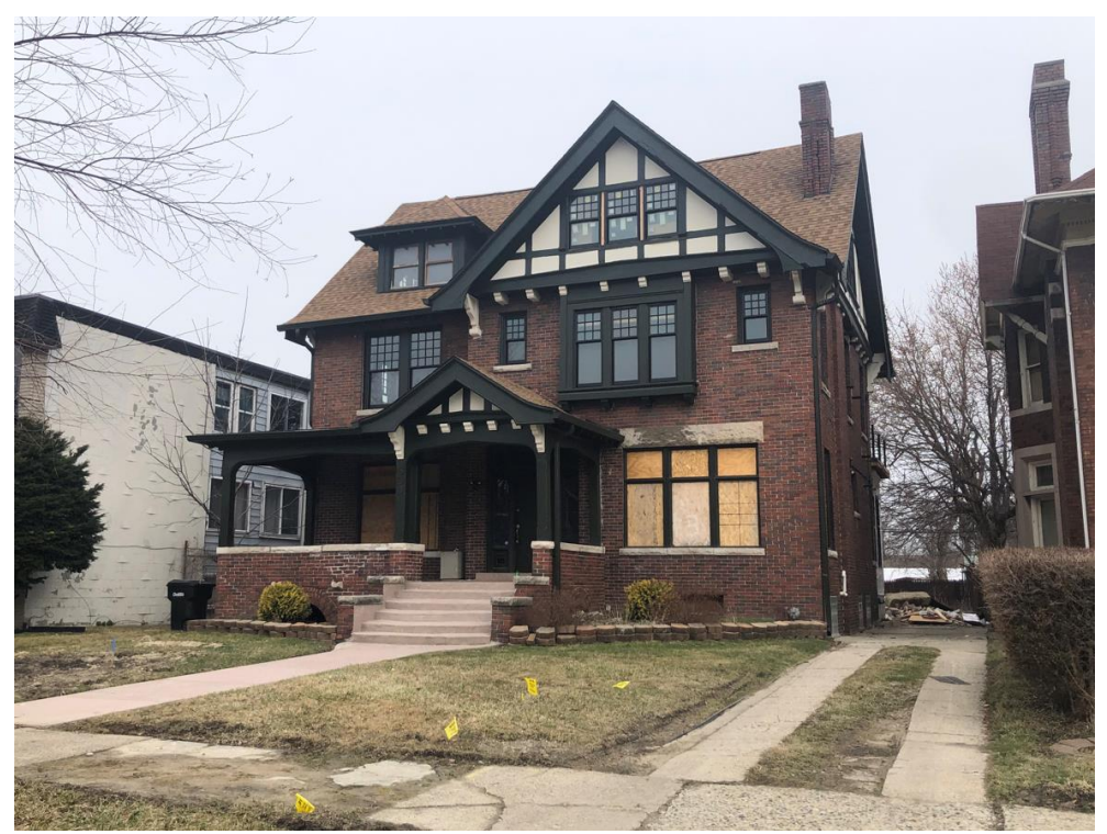
Undated 2022 or 2023 photo by staff showing prior driveway configuration.