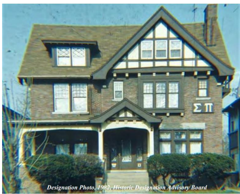
1982 Historic Designation Advisory Board photo showing historically appropriate foundation plantings.