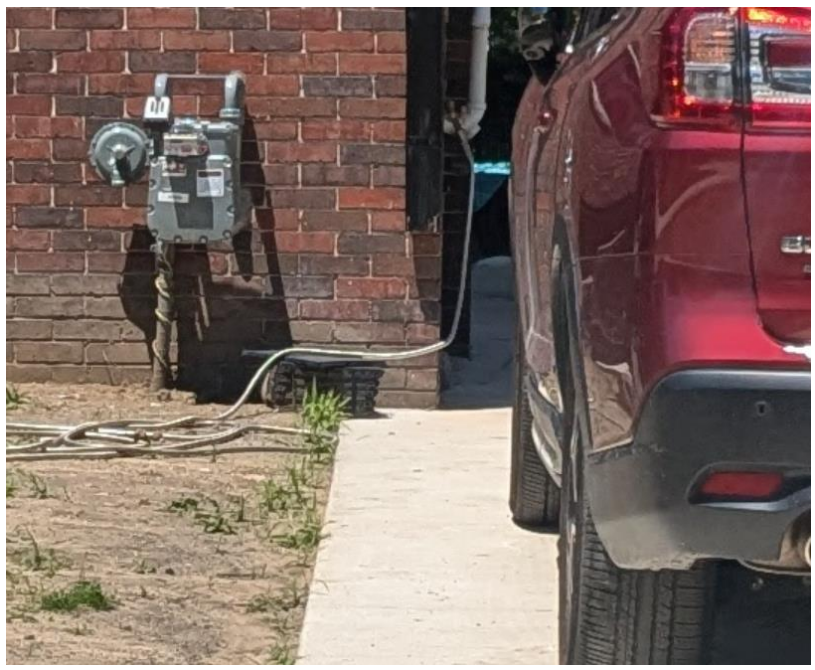
July 2024 staff photo showing inappropriate overlap of driveway with front façade of the house.

• The proposed (already installed) driveway extends in front of the front façade of the house by about twelve inches. As a driveway is, by definition, a pathway from the street to a rear garage, this additional width effectively creates a paved surface in the front yard of the property. This interferes with the character-defining front lawn and is inappropriate, in staff opinion (thereby precluding administrative approval of the completed work). The work is contrary to the Secretary of the Interior's Standards for Rehabilitation, namely Standard #2: "The historic character of a property shall be retained and preserved. The removal of historic materials or alteration of features and spaces that characterize a property shall be avoided."