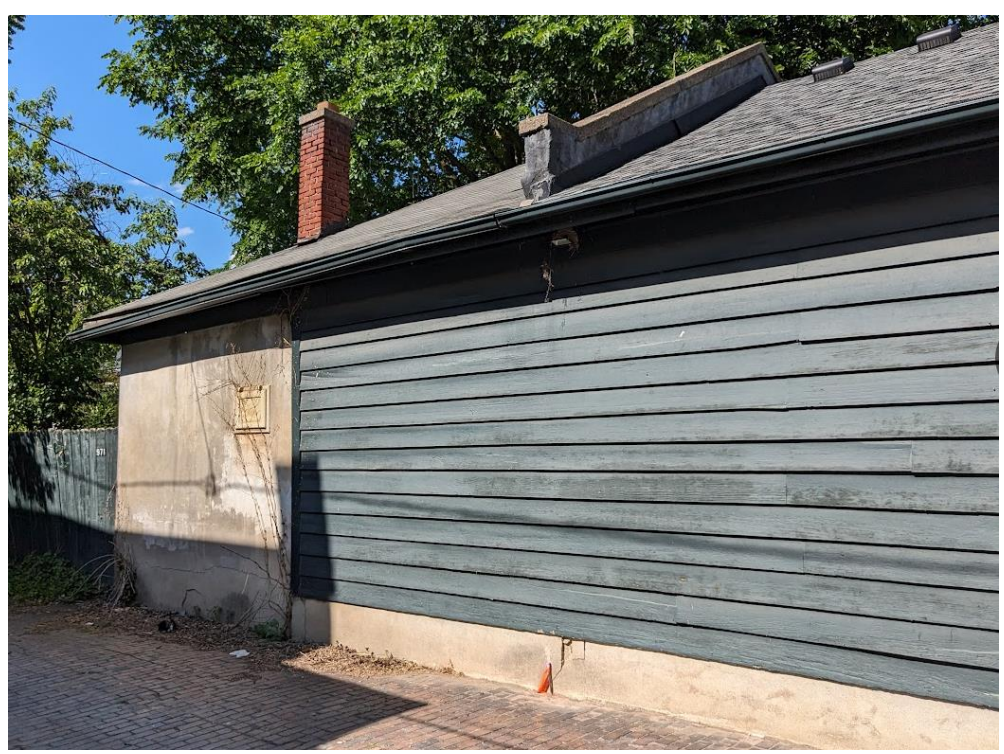
The garage. May 2024 photo by staff.

The garage, also subject of this application, is from the 1910s or 1920s and clad with wood siding and stucco. The alley-facing (west-facing) wall is leaning outward slightly. A brick slope chimney is also leaning, potentially due to the erosion of its mortar over time.