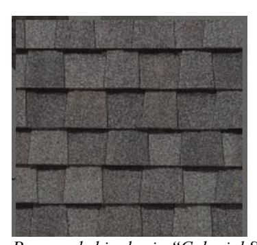
Proposed shingles in "Colonial Slate."

The applicant proposes to replace the wood shingles with Certainteed Landmark Pro asphalt architectural shingles in "Colonial Slate" color.