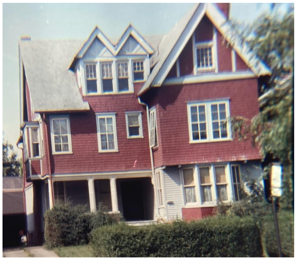
Historic Designation Advisory Board photo, 1970

The roof was originally wood shingle, as depicted in a Sanborn map.