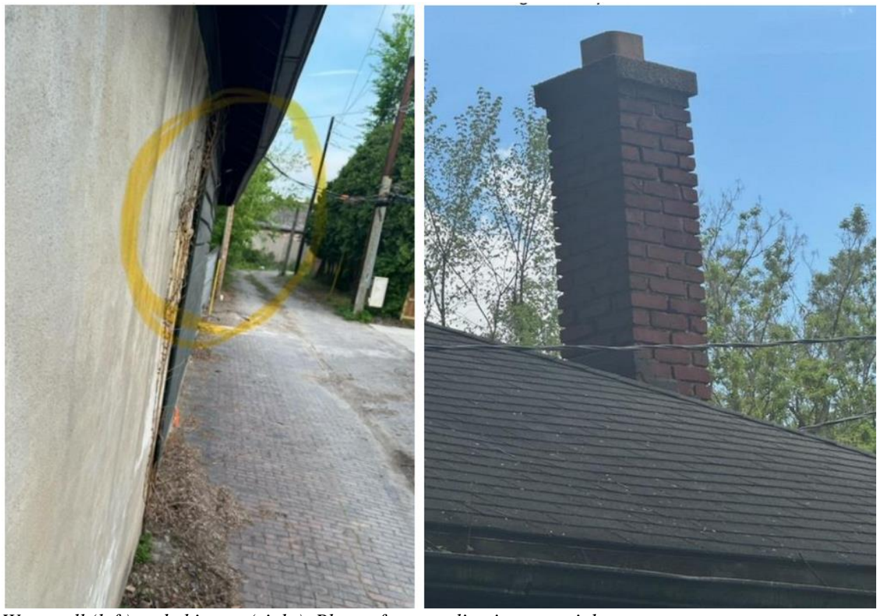
West wall (left) and chimney (right).

The proposal would also rebuild the chimney with new brick.