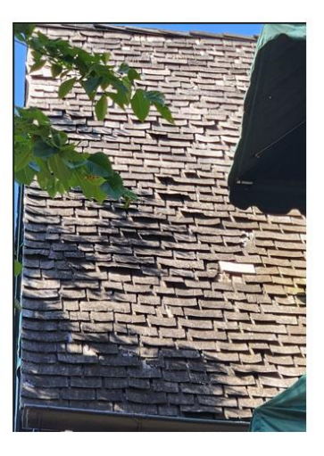
2024 photos provided by the applicant.

• Preservation Briefs 19 guides: "Wooden shingle roofs need periodic replacement. They can last from