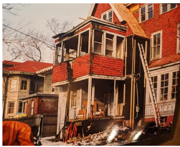
Roof replacement from asphalt shingles to wood shingles per 1997 COA. Photo from unrelated 1998 application documents.

evidence." Further, the associated Historic District Commission staff report notes "physical evidence of the original wood shingles existing under [an upper layer of] asphalt shingles."