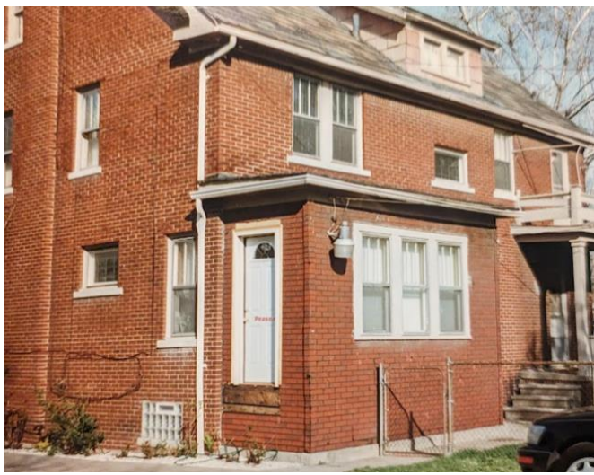
Rear addition. Photo from 1997 application materials.