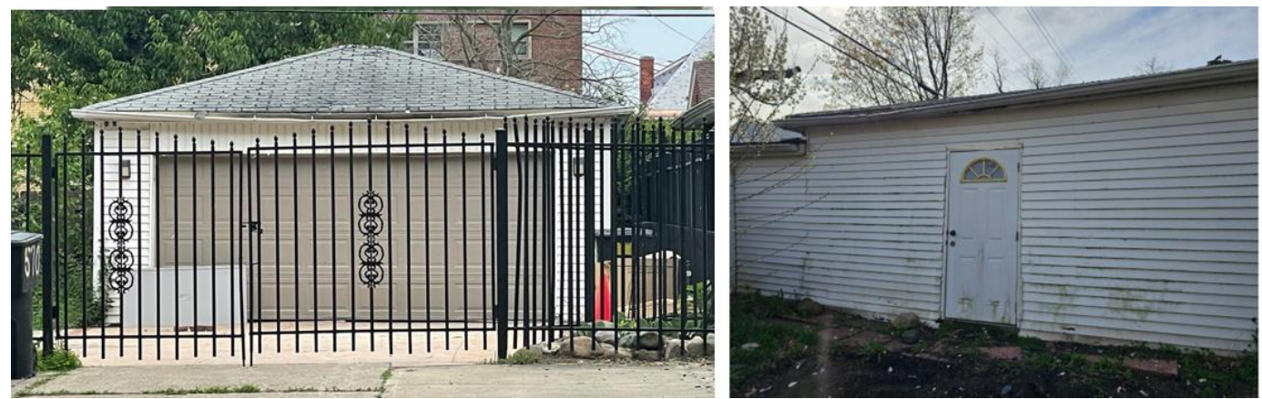
Left: June 2024 staff photo of the garage, east (front) elevation. Right: 2024 image from property owner showing north (side) elevation.

• The application materials show that the rear addition, removed without approval, had been damaged by fire.