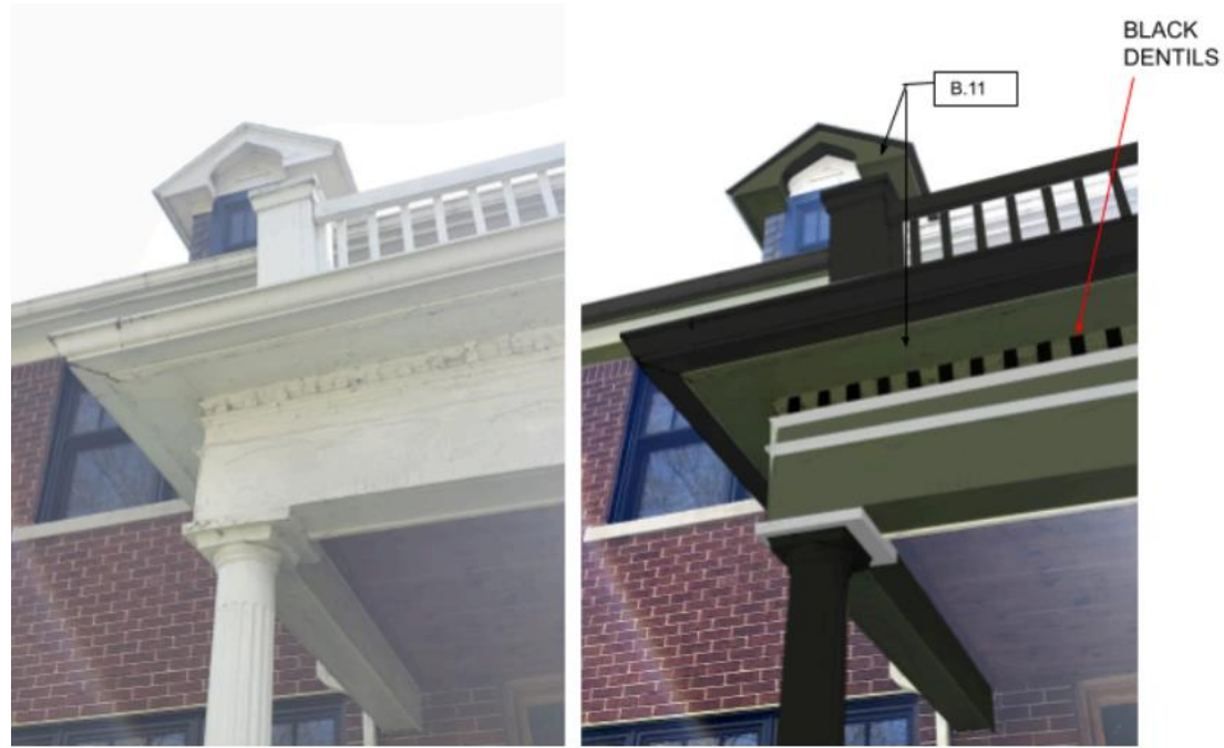
Existing colors (left) and rendering of proposed colors (right). Images from application materials.

The house and proposed garage are proposed to be painted in C1: Light Bluish Grey, B19: Black, and B11: Greyish Olive Green.