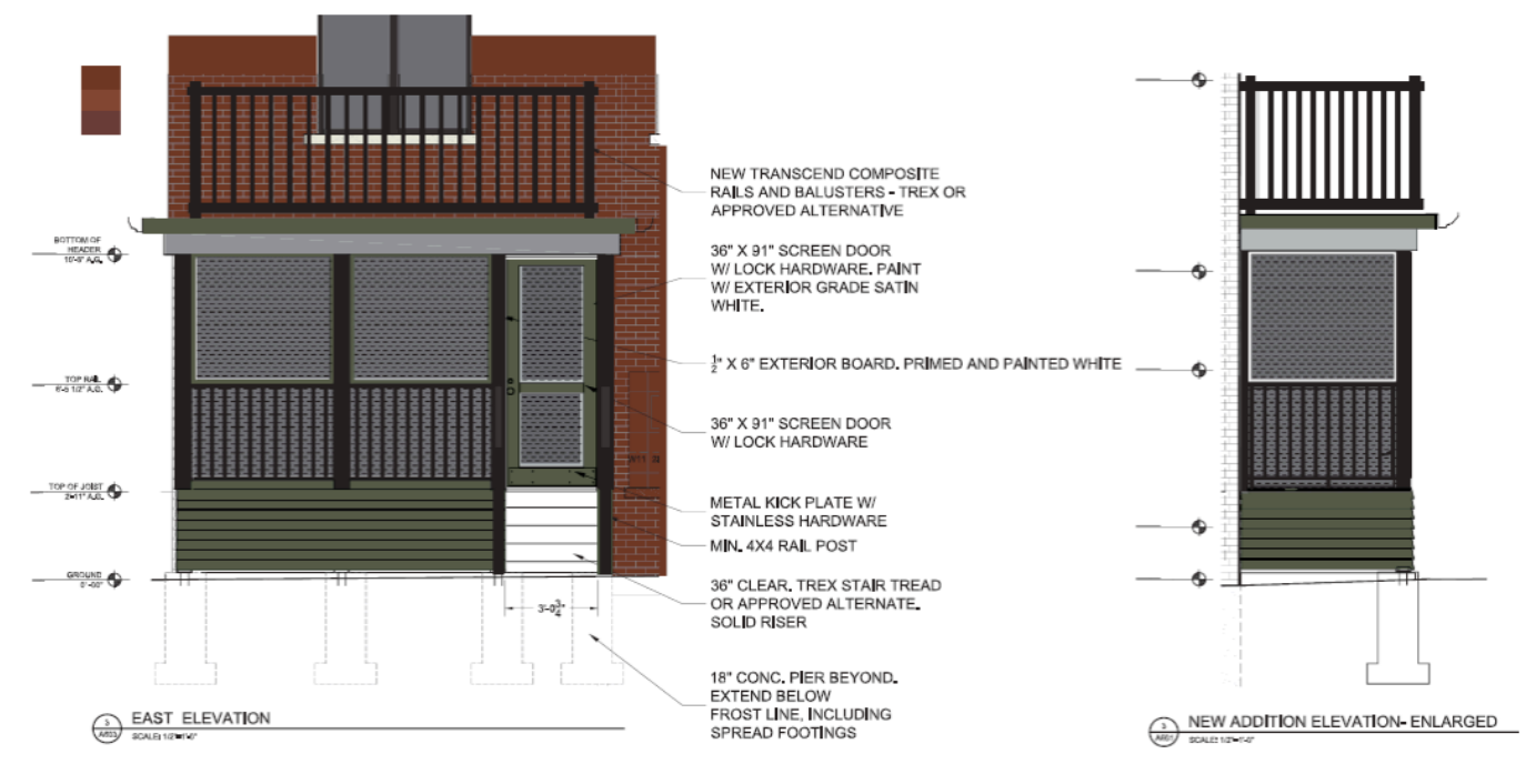
Proposed porch. Elevations from application documents.