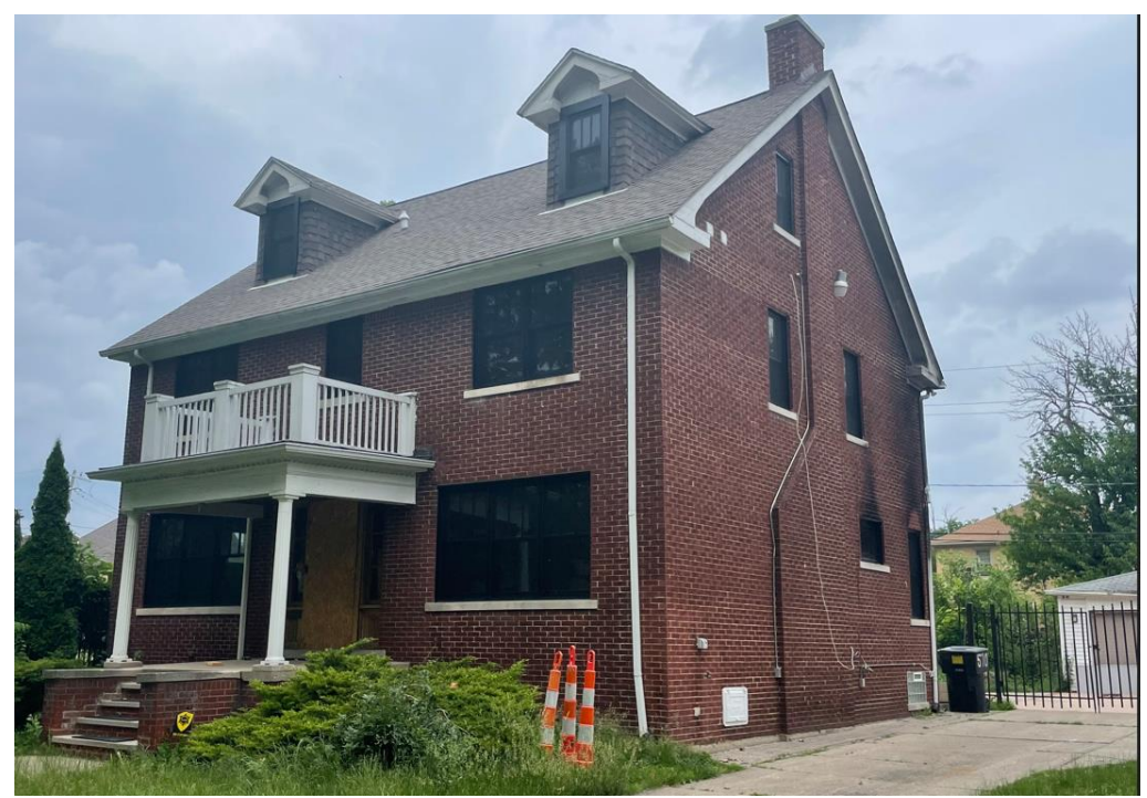
June 2024 photo by staff facing east from Lodge Drive; garage visible in background.

SCOPE: DEMOLISH GARAGE, ERECT GARAGE, ERECT REAR PORCH, PAINT DWELLING (WORK STARTED WITHOUT APPROVAL)