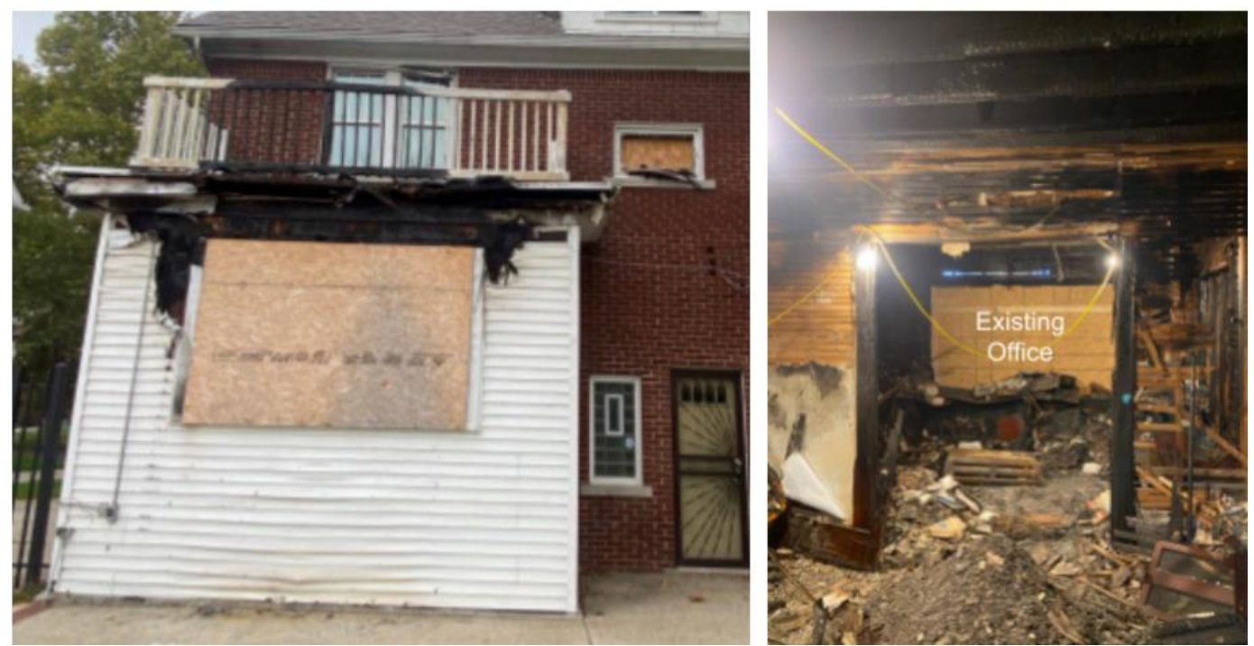
Exterior (left) and interior (right) views of the addition. Undated, likely 2022 or 2023, photos from application materials.

• The application materials show that the rear addition, removed without approval, had been damaged by fire.