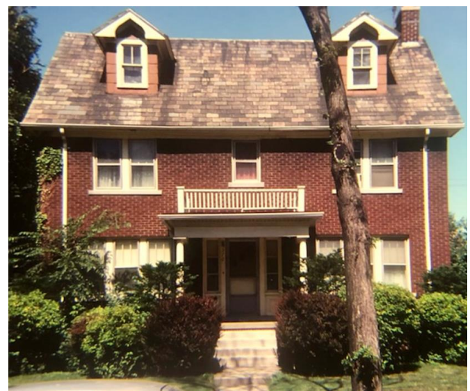
1978 photo by the Historic Designation Advisory Board. Note balustrade and slate roof that no longer remain.

The garage, also subject of this application, was built at an unknown date (see Staff Observations and Research, below). It is a hip-roof garage with vinyl siding and a sectional garage door. It is accessed by a driveway to Lodge Drive.