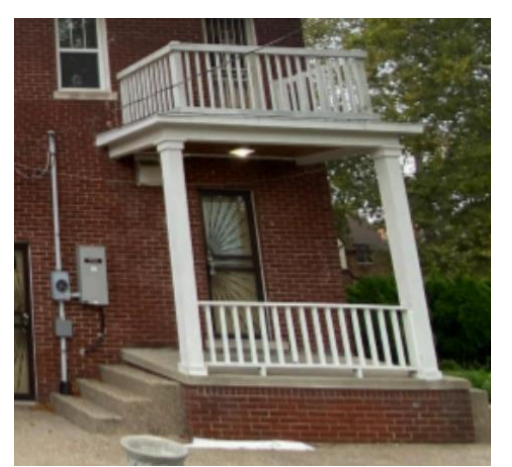
Historic rear (east) porch.

• The proposed porch is compatible in materials and massing, and yet its design differentiates it from the historic rear porch. This satisfies Standard #9: "New additions, exterior alterations, or related new construction shall not destroy historic materials that characterize the property. The new work shall be differentiated from the old and shall be compatible with the massing, size, scale, and architectural features to protect the historic integrity of the property and its environment."