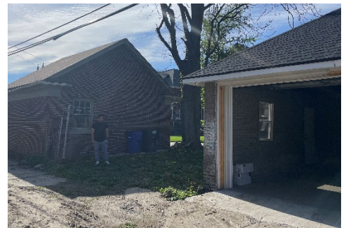
Site Photo 8, by staff, April 19, 2024: (looking northwest from the alley) showing proposed location of parking pad and tree removal.