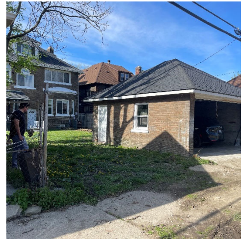
Site Photo 3, by Staff April 19, 2024: looking north from the alley, showing garage roof and proposed pad site.