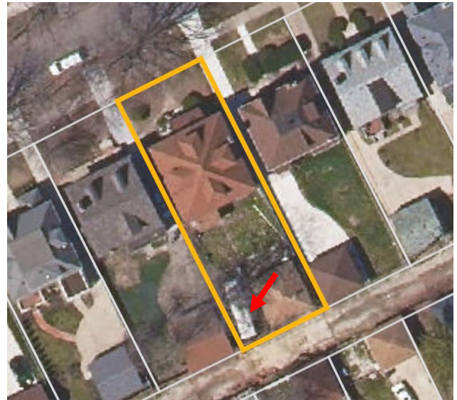
Aerial 1 of Parcel # 10002637, by Detroit Parcel Viewer, showing the proposed pad location (arrow).