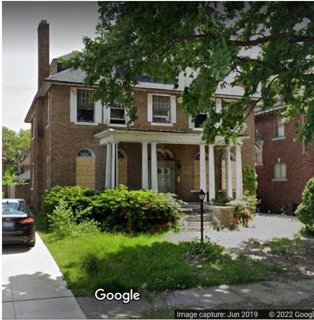
Fig 2, by Google Street View, June 2019: (North) front elevation showing conditions prior to previous owner.