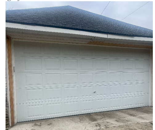
Site Photo 7 April 2024: (south) showing replaced garage door.