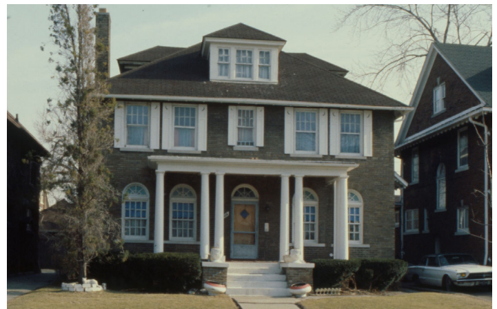
Image, 1980: (North) front elevation showing original windows and porch condition.