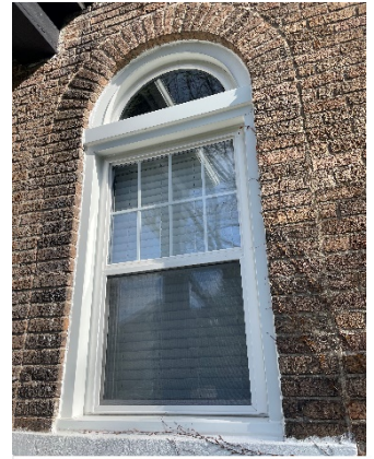
Site Photo 4 April 19, 2024: (North) front elevation showing detail of thick, vinyl coil stock around brick mold and seam, and color tinted transom, proposed