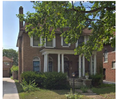
Figure 3: (north) front elevation showing conditions prior to previous owner.