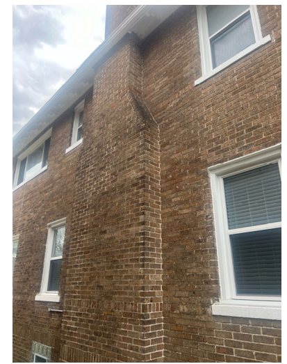
Site Photos 4&5, by applicant April 2024: east elevation, showing replaced vinyl windows.