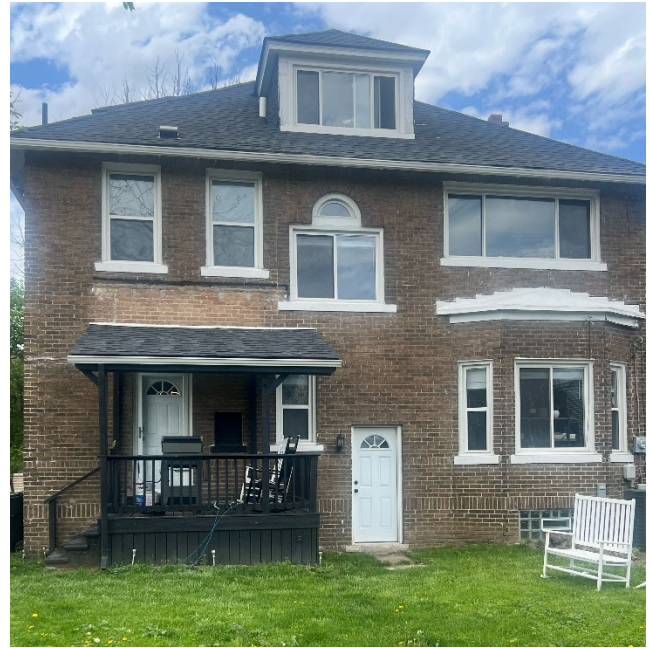
Site Photo 2, by Applicant: (South) rear side elevation showing replaced vinyl windows, altered rear porch and replaced rear door.