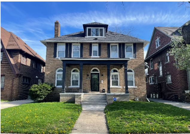
Site Photo 1, by Staff April 19, 2024: (North) front elevation showing replaced vinyl windows, altered porch and landscape.

Built in 1922, the property at 2491 Longfellow has a hipped asphalt-shingled roof which features a centrally placed dormer facing the front and at each side of the house. The eaves are bracketed, and the house is clad in light brown brick. The symmetrically placed windows, which were once wood and featured true divided-light mullions, and arched transoms, have been replaced by vinyl windows with between-glass grids. All original windows, except for those on the garage have been replaced on this property. The original shutters are still present. The front porch roof was originally supported by a series of paired round columns, which have since been replaced with 4 four square columns, painted black. The original front porch deck was rebuilt and resurfaced within the same footprint without approval. Property files indicate that there are no former Historic District Commission (HDC) approvals on this property.