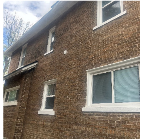
Site Photo 3, by Applicant: (west) side elevation showing replaced vinyl windows.