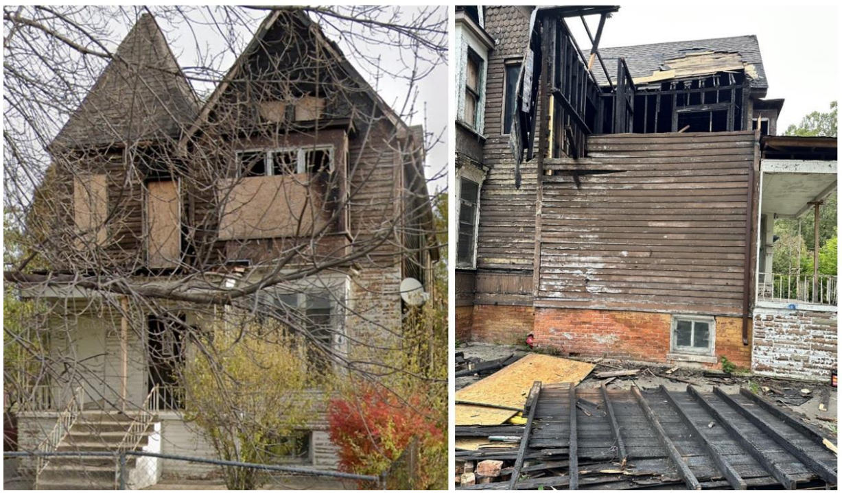
Left: November 2020 photo from Google Street View. Right: Image from 2023 application documents, view from the north. Note that the pyramidal roof tower is missing; red arrow is added by staff to indicate former tower location.

In 2018, the Historic District Commission issued a Certificate of Appropriateness for a proposal to substantially rehabilitate the exterior of the house. However, the work was never performed. (Both prior COAs are posted to the Historic District Commission property page for reference.)