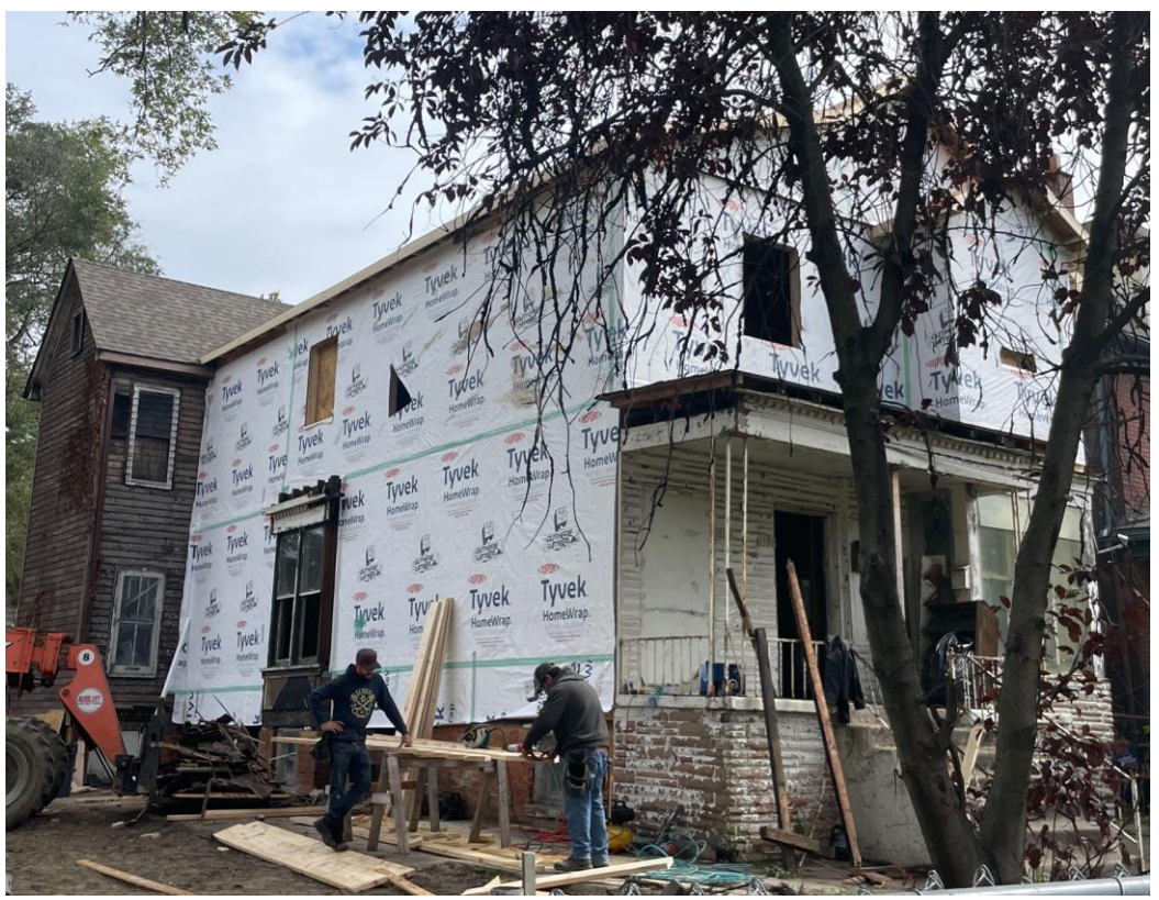
October 11, 2023, photo by staff.

In 2023, staff observed extensive work completed at the property without Historic District Commission approval. Perhaps most noticeably, the attic half-story had been shortened, eliminating its pyramidal tower, front-facing gable, north-facing cross gable, and south-facing dormer. The fenestration pattern had been altered, with many window openings reduced in size or eliminated altogether. The footprint of the north wall was expanded slightly, eliminating a recessed central section and creating a solid plane. The north-facing box-bay window had been reduced from two stories to one, and the front-facing box-bay window had been altered by either removing or covering over a Classical entablature with dentils and adding a gable to the top of its second story. Expanses of building paper suggest that much of the historic siding had been removed as well. A few historic, wood, one-overone or two-over-two windows remained on the building, along with Classical trim on the historic porch and what remained of the north-facing box bay window.