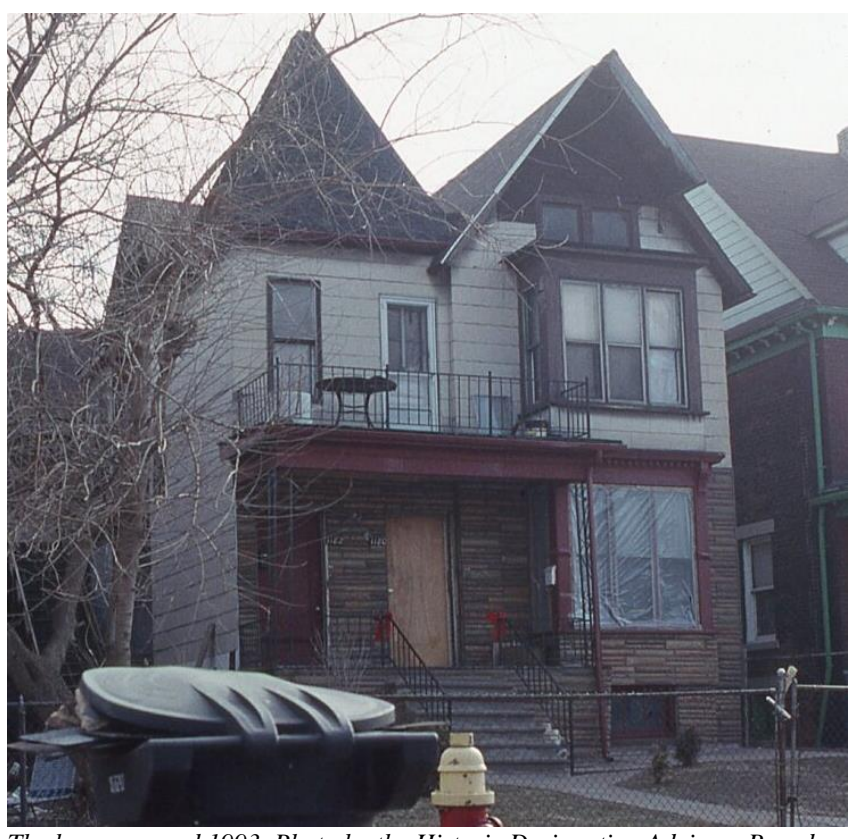
The house around 1993.