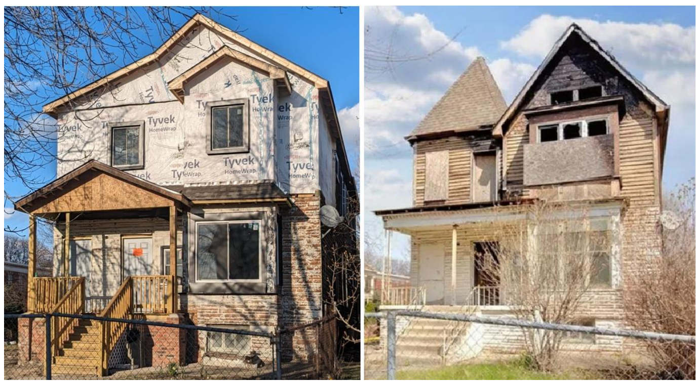
Left: March 2024 photo by staff. Right: Photo from July 2023 listing on realtor.com.

1180 Vinewood was built in 1900 and faces west onto the street. In recent months it has been heavily altered without review or approval by the Historic District Commission.