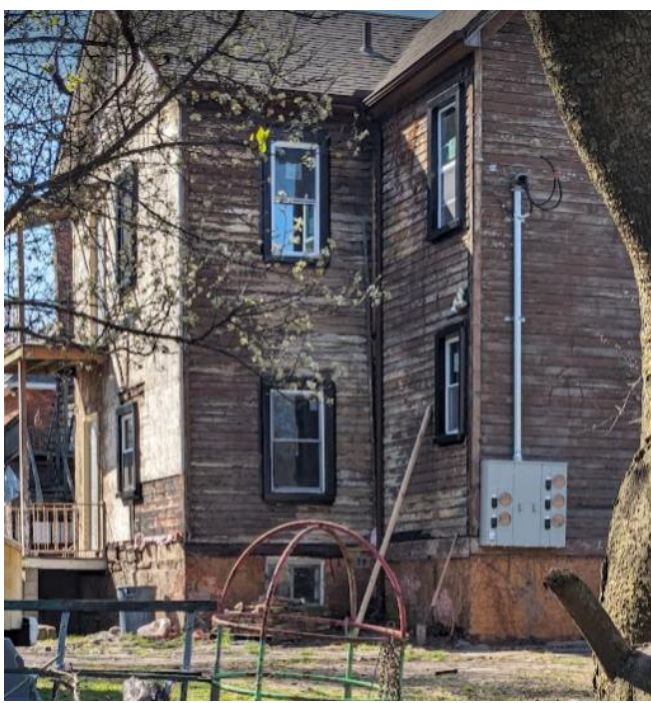
April 2024 staff photo; new electrical service connections visible at bottom right.

After the Stop Work order, staff observed additional work on the house: New electrical service connections were added on the exterior, north elevation. This work was visible on April 5, 2024, but not present on March 28, 2024.