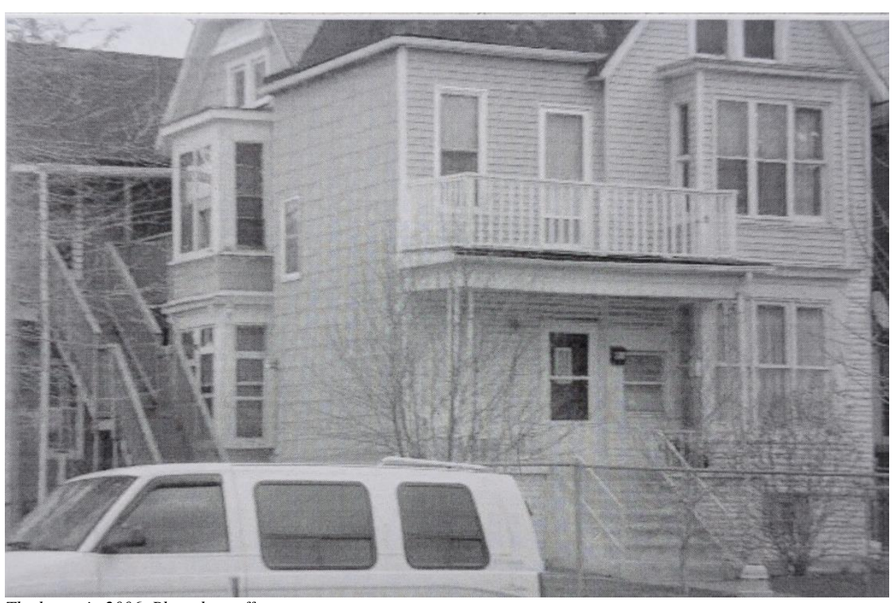
The house in 2006.