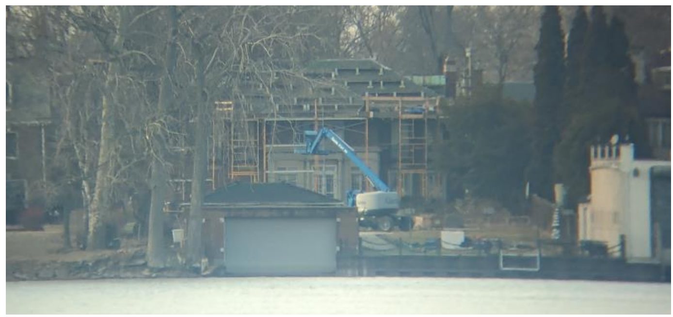
Subject property viewed from Belle Isle; February 2024 photo by staff.