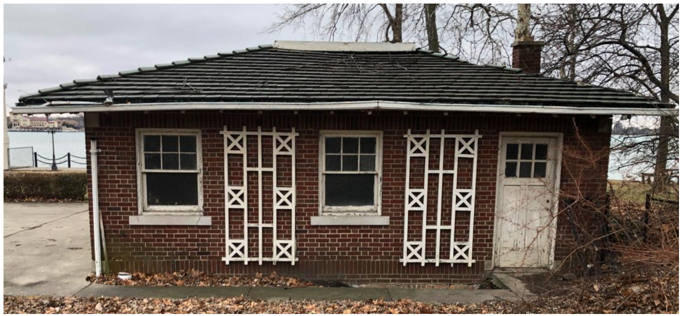
The garage/boathouse at 9230 Dwight, north elevation; Photo by applicant. Note the intentional design consistency with the main house, including the roof tile.