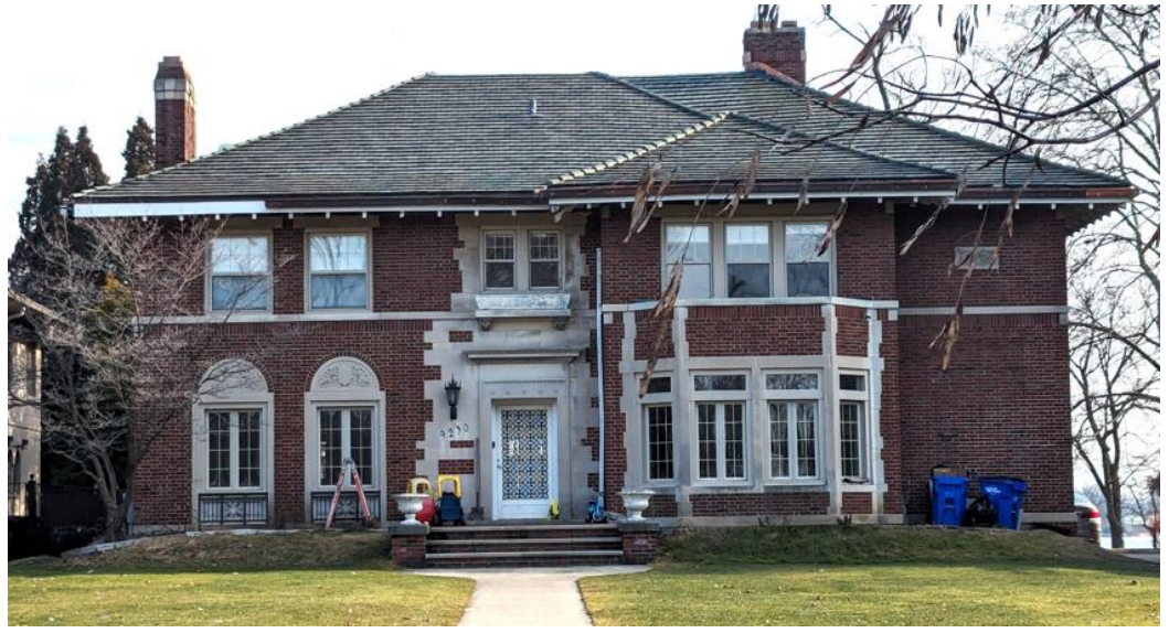
The house at 9230 Dwight; February 2024.