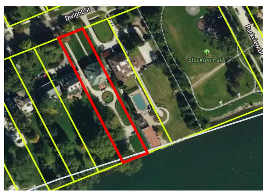
Aerial image with subject property outlined in red