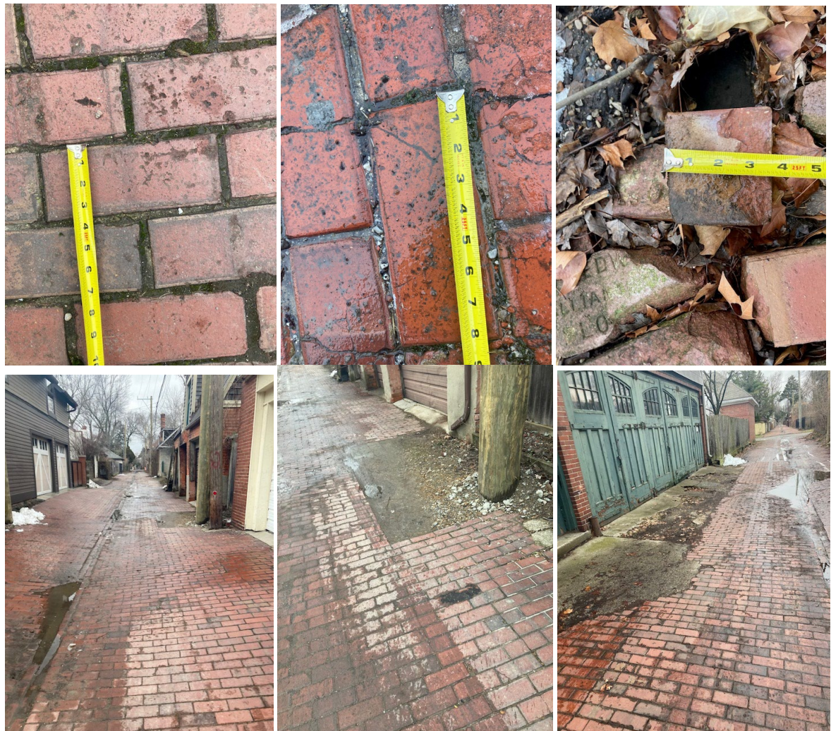
Figure 6: Images showing the dimensions and conditions of the paving in the alleys north of Lafayette.

The alleys north of Lafayette are paved primarily with red colored vitrified paving block measuring approximately 8 inches long, 3.75 inches wide, and 3.75 inches tall. The blocks in this area of the project are more uniform in color than the southern alleys, but still display a slight variation in edge treatment and color.