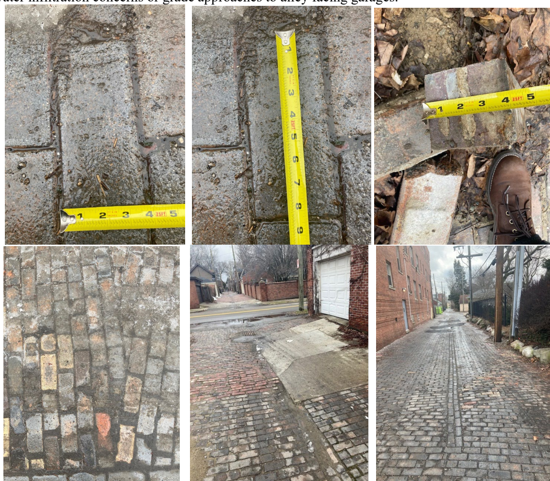
Figure 5: Images showing the dimensions and conditions of the paving in the alleys south of Lafayette.

The alleys running south of Lafayette are paved primarily with gray colored vitrified paving block measuring approximately 8 inches long, 3.75 inches wide, and 3.75 inches tall. However, numerous bricks of different sizes and colors have been used as replacement for the repairs over time, giving the paving a patchwork appearance in some locations. In addition to municipal and utility repairs, adjacent property owners have also replaced or covered the paving materials in order to address water infiltration concerns or grade approaches to alley facing garages.