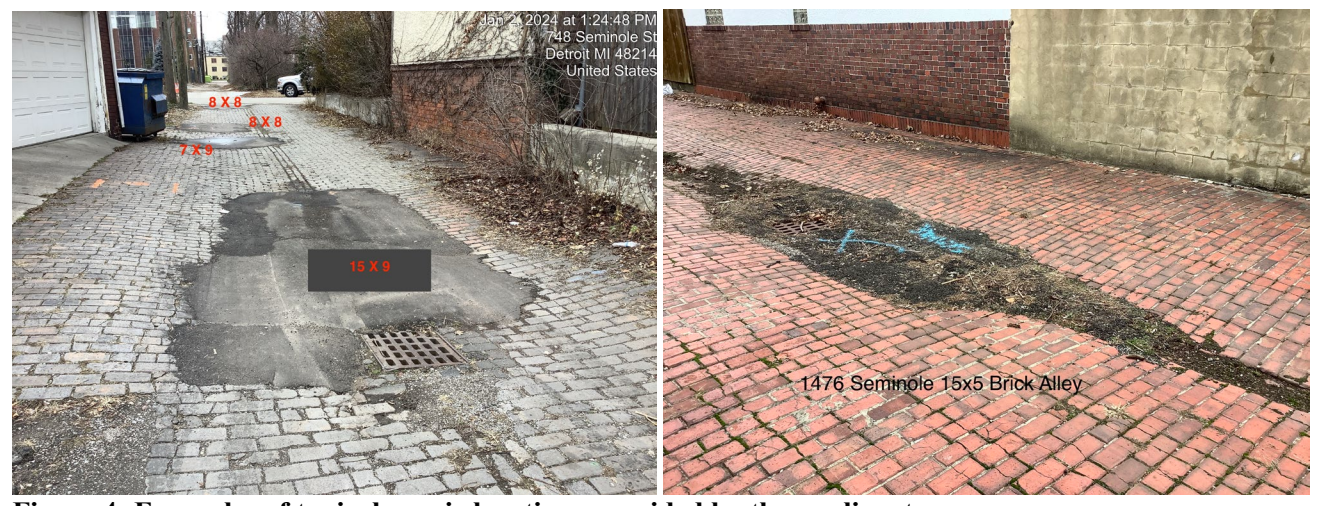
Figure 4: Examples of typical repair locations provided by the applicant.