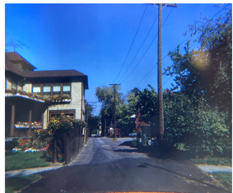
Figure 1: Current view looking east down the alley between Seminole and Iroquois (left), and the same view from ca. 1970. (right)