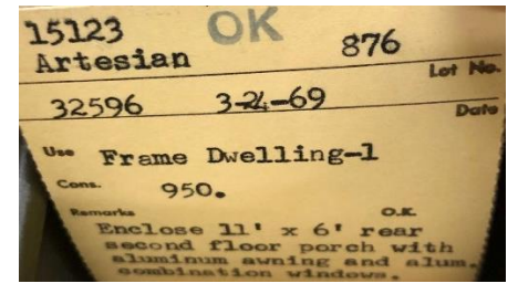
BSEED permit cards

Vinyl siding was installed between the time of local designation in April 2007 and the Google street view image dated October 2009. According to HDC records, this installation wasn't reviewed/approved by the Commission, nor do records show it ever being reported to HDC staff as non-approved work.