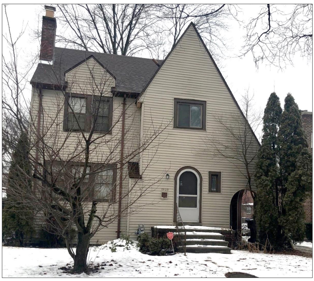
Staff photo, January 25, 2024.

The two-story dwelling at 15123 Artesian was erected in 1927. The front elevation is dominated by a front-facing, two-story gable, whose extended wall and roof created an open, at-grade corner porch. The arched porch openings repeat the arch of the front door. Grouped double-hung windows are at the first and second floors of the recessed wall of the front façade, directly below a small gable that extends past the eave of the reverse gable roof. A small decorative leaded glass window emulates the small leaded glass opening in the front door.