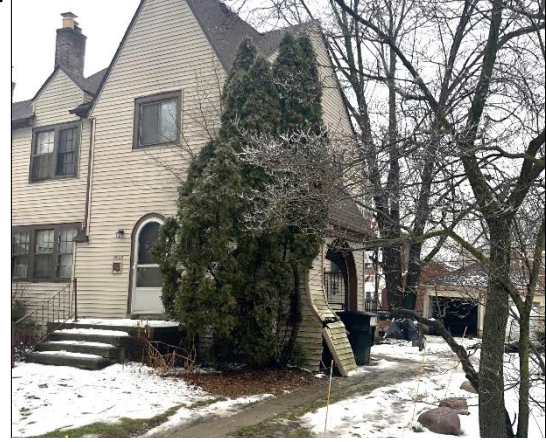
Staff photo taken at sidewalk adjacent property's driveway.