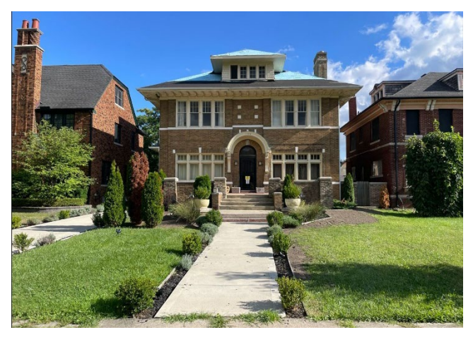
Site Photo 1, by Staff August 25, 2022: (Northwest) front elevation, showing removed clay tile roof and partial asphalt roof installation.