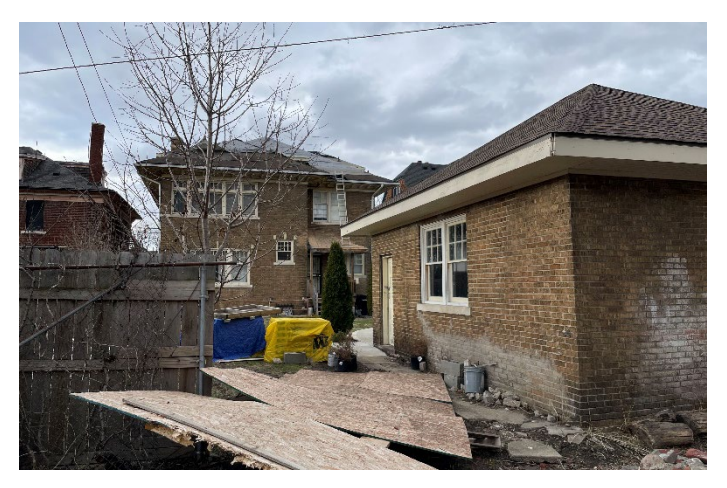
Site Photo 3, by Staff March 25, 2022: (Southeast) rear elevation and garage, showing partial installation of new asphalt roof.