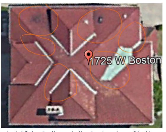
Aerial 2, by Applicant, indicating locations of leaking areas of the house's roof (red).