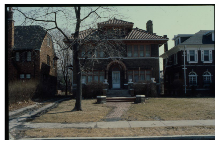
Designation Image, 1980: (Northwest) front elevation, showing original clay tile roof..