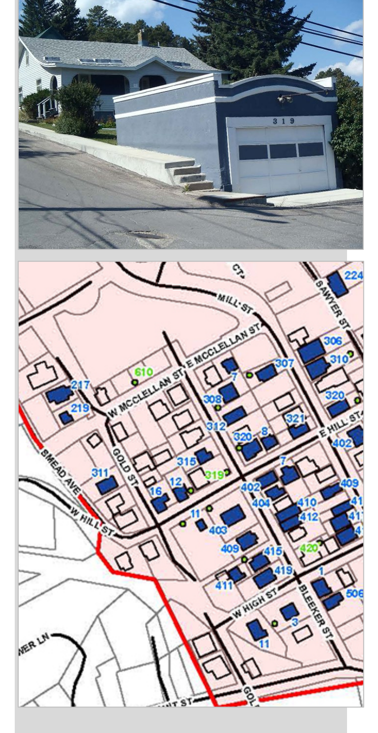
Lead Historic District: top, non-contributing house and contributing garage at 319 Bleeker Street; bottom, portion of sketch map, distinguishing primary and secondary contributing resources and non-contributing resources.

The Lead Historic District is significant at the state level as an outstanding example of a "company town" associated with the Homestake gold mine, once one of the largest gold mines in the world and one of South Dakota's largest industries for decades; and for its outstanding collection of