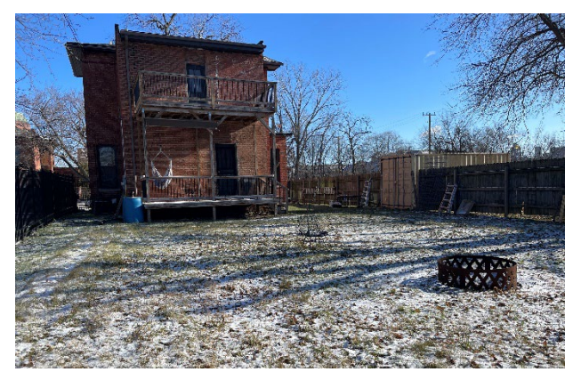
Site Photo 3 November 28, 2023: rear yard, looking east.