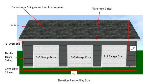
Figure 1, by Applicant: showing alley (west) side elevation of the proposed garage.