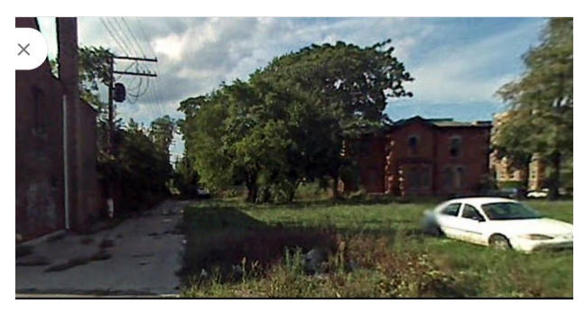
Site Photo 4, by Google Street view October 2007 showing rear lot and former garage sites.