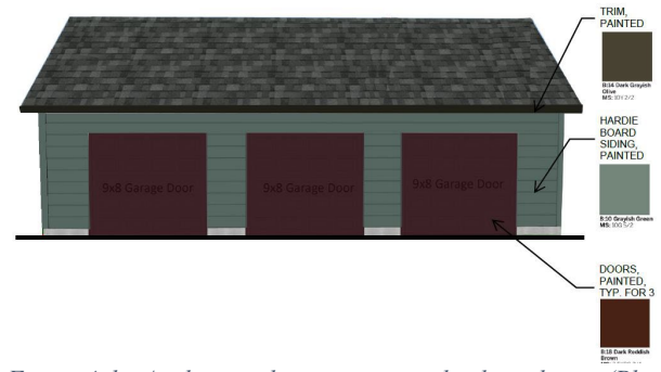
Figure 4, by Applicant: showing proposed color scheme. (Please note colors in figures 1-3 above are not accurate.)