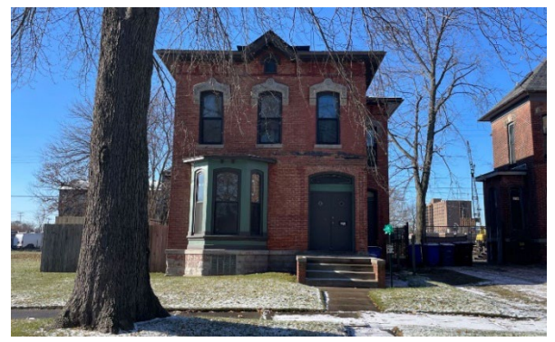
Site Photo 1, by Staff November 28, 2023: (East) front

This property has no standing violations, however a shipping container in the adjacent lot sits on the south property line without approval.