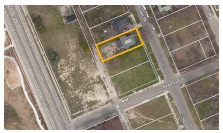
Aerial#1 of Parcel # 06005788., showing rear lot and alley.