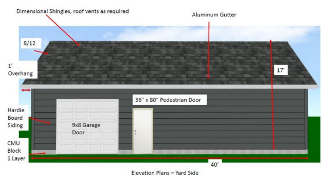
Figure 2, by Applicant: showing yard (east) side elevation of the proposed garage.