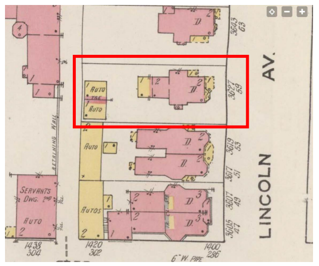
1921 Sanborn, vol 2, 115, showing former garage line-up along the rear alley of Lincoln Ave. Red box indicates current property.