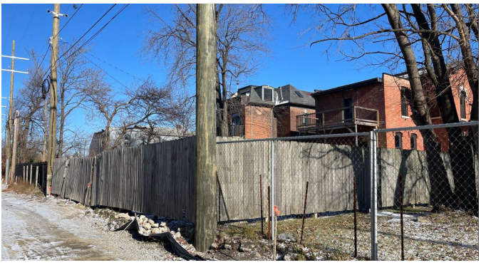
by Staff November 28, 2023: (west) rear elevation, showing existing fence to be removed and garage site along the allev.