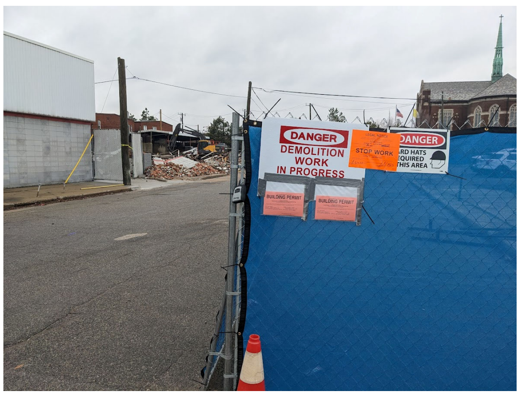
View of site conditions during demolition activity, including City of Grosse Pointe Park building permits (in pink) and City of Detroit Stop Work order (in orange). The extant Jefferson-fronting DPW building, partially demolished later that spring, is visible at left. Staff photo, March 31, 2023.

In late March 2023, HDC staff received multiple urgent complaints from residents of both Detroit and Grosse Pointe Park concerning demolition activity at the site, including unpermitted activity ("work") at the Detroit parcels. A stop work order was issued by the City of Detroit's BSEED, but not before a substantial majority of the "interior" DPW building (extending into 14927 East Jefferson, and addressed as 1005 Wayburn) was demolished. This work is in violation of the historic ordinance and the state's Local Historic Districts Act.