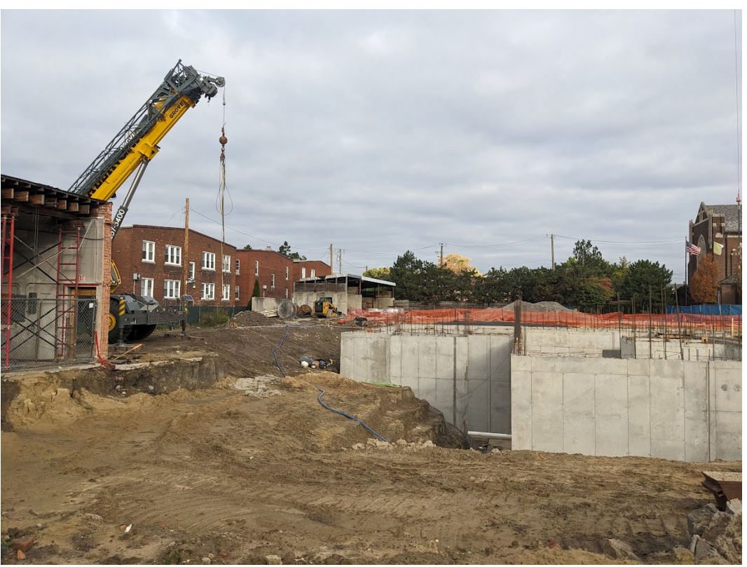
Construction activities on the Grosse Pointe Park portion of the site. Visible are the Detroit apartment buildings, and the salt shed proposed for demolition (center). Staff Photo, October 17, 2023.