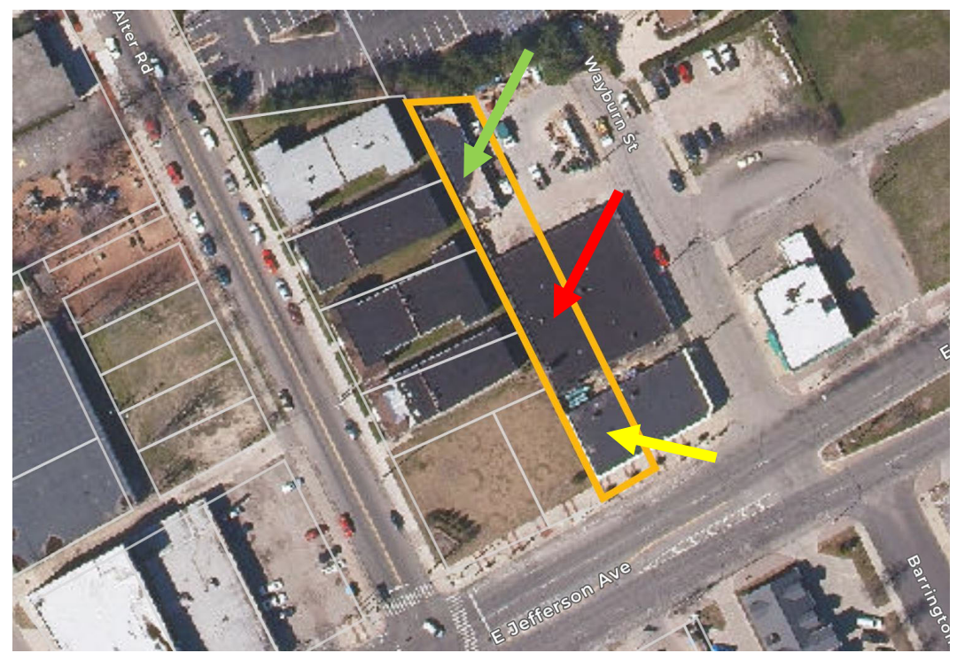
Parcel view of vicinity, 14927 East Jefferson outlined in orange. This is the easternmost parcel in Detroit and in the historic district. Note how the western (left) portions of two buildings substantially in Grosse Pointe Park occupy this parcel. The "interior" building (red arrow), addressed as 1005 Wayburn from Grosse Pointe Park, was completely demolished in late March, including the Detroit portion. The Jefferson-fronting City of Grosse Pointe Park Department of Public Works (DPW) building (15005 East Jefferson, yellow arrow) was partially demolished, leaving a compromised remnant in Detroit. The structure at the north end (green arrow) is an open air salt storage shed, which exists entirely within Detroit.

The legal parcel known as 14927 East Jefferson, one of three parcels under review, is the easternmost parcel along Jefferson and merits some deeper discussion. Per the legal description of this parcel, it includes all of lot 201 and the westernmost 2' of lot 202, and has a frontage of 42', to wit: