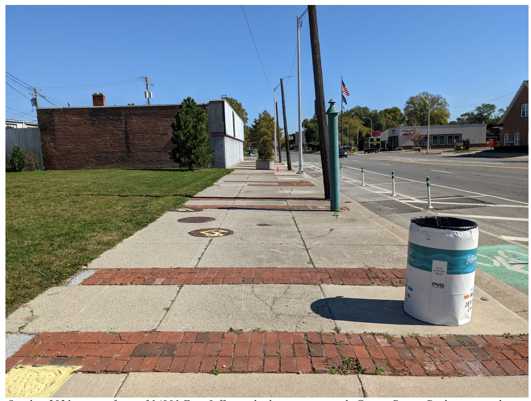
October 2021 view in front of 14901 East Jefferson looking east towards Grosse Pointe Park, prior to the start of construction activities in late winter 2023. The brick sidewalk ornamentation was meant to enrich the pedestrian experience here and elsewhere in the district, but has lost the commercial street wall that previously framed it. Staff photo, October 1, 2021.