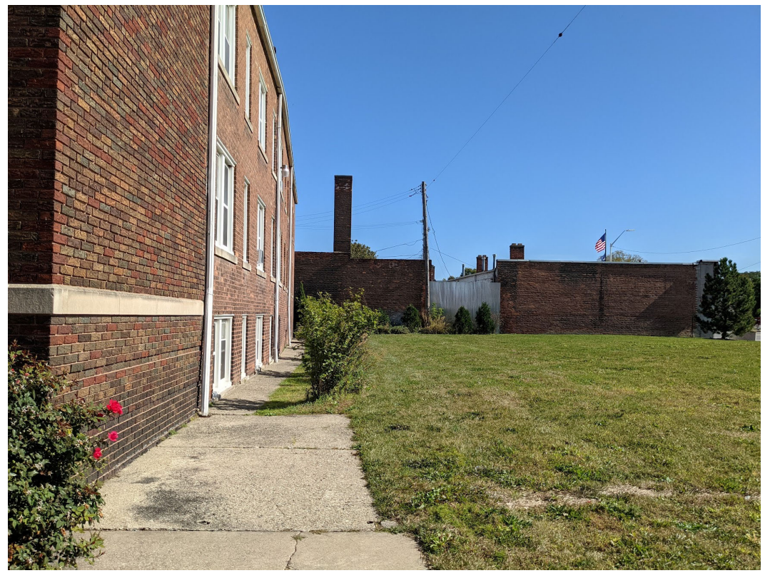
View to the east along south elevation of 1020 Alter, where loading drive is proposed. By staff's count, there are thirty-two (32) operable windows at this elevation, including several at grade. October 1, 2021.