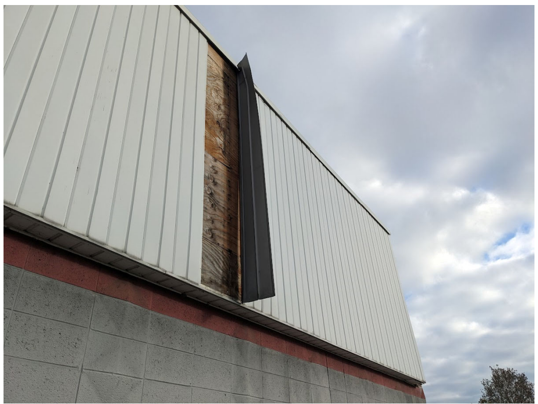
Detail view of current conditions at 14927 East Jefferson, showing easily repairable loose siding materials hovering over Detroit's public sidewalk. Staff photo, October 17, 2023.

No structural engineering report or opinion was submitted for the much larger "interior" building, 1005 Wayburn, which was completely demolished prior to the structural engineer's inspection of 15005 Jefferson, nor for the non-contributing "salt shed." Such reports are only required by the Commission if applicants are claiming structural deficiency or economic infeasibility as a reason for the demolition.