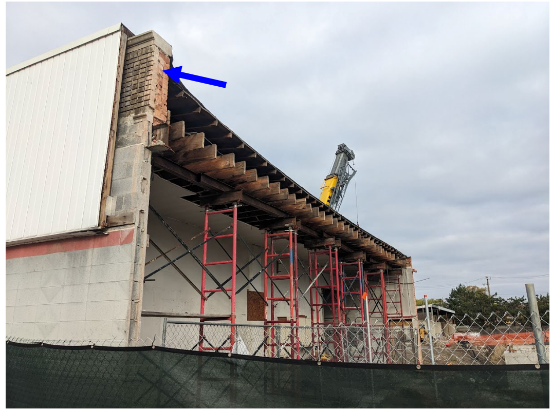
View of existing conditions at 14927 East Jefferson, the "cleaved remnant" of Grosse Pointe Park's former DPW building. Note historic brickwork and limestone coping revealed by this activity (blue arrow). Staff photo, October 17, 2023.

Subsequent to the filing of the lawsuit, the former DPW building (fronting East Jefferson) which was in apparent use by the City of Grosse Pointe Park as recently as 2021, was partially demolished, leaving only the western portion in Detroit standing. The surgical precision and time necessary to create this cleaved remnant, reminiscent of some of artist Gordon Matta-Clark's most ambitious creations, is notable to staff. This action has substantially compromised the safety and serviceability of the remaining piece of the structure, leaving it open to weather infiltration for several months. It is unknown whether the remaining building systems (including the structural systems) are adequate to keep the architecture intact, or to feasibly salvage the remaining piece. It is unclear why the City of Grosse Pointe Park would have permitted and approved the creation of such an obvious hazard to the public under Michigan building codes, if that is what happened. Ironically, the developer's own attorneys now characterize this fatally compromised structure as "abandoned,", "deteriorated," and in "poor condition," when such conditions have by all appearances been created by the developer/owner in recent months.