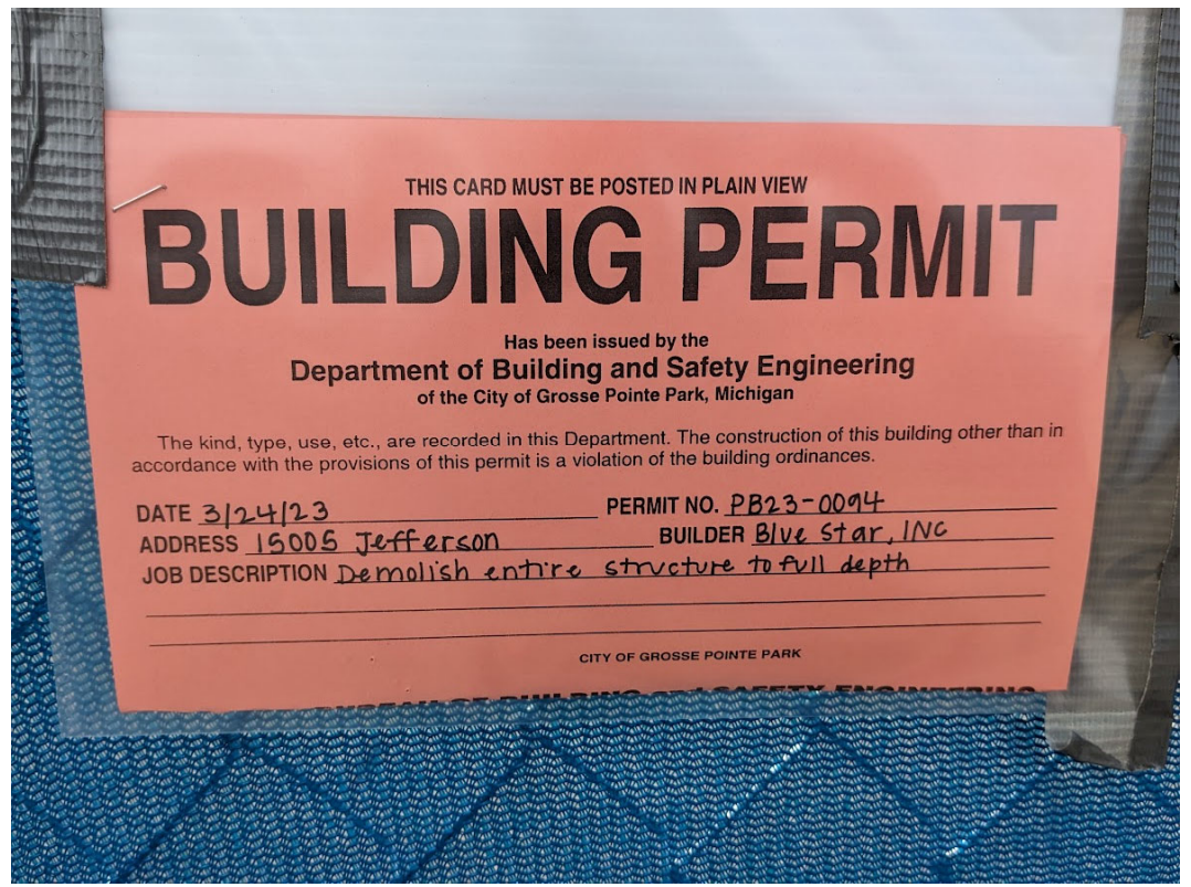
Detail view of one of the two City of Grosse Pointe Park building permits posted at the site, which states in unusual specificity, "Demolish entire structure to full depth", despite both structures extending partially into the City of Detroit and out of the jurisdiction of this building department. This card refers to the DPW building, addressed as 15005 Jefferson. The other permit, with identical language, refers to 1005 Wayburn, that being the "interior" building demolished in its entirety. Staff photo, March 28, 2023.

Subsequently, the City of Detroit filed a lawsuit seeking to compel the submission of a building permit application. This present application to the Historic District Commission, in HDC staff's opinion, represents a positive and welcome step towards regulatory compliance. However, it should be noted that multiple other city departments may have open comments regarding the initial 2021 permit application, a summary of these comments is appended to this staff report. HDC staff has no knowledge concerning the applicant's intentions or progress in responding to other department's reviews/comments, nor is the status of other reviews within the jurisdiction of the Commission. Any approval by the Historic District Commission would not affect the permit approvals or reviews still outstanding to any other department, except perhaps as the successful completion of those other reviews might delay the issuance of a Notice to Proceed under condition 2 of Section 21-2-75, which requires all other reviews to be complete and successful.