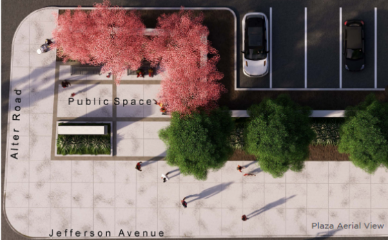
The Schaap Center | Historic District Commission | October 16, 2023