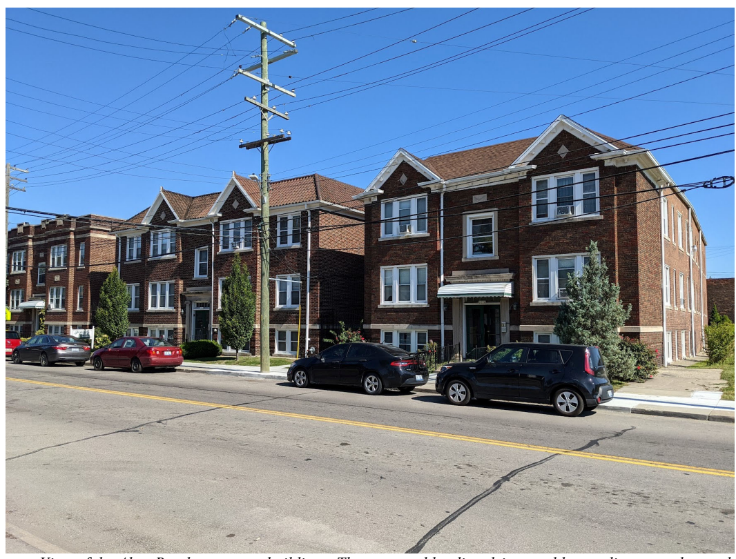
View of the Alter Road apartment buildings. The proposed loading drive would run adjacent to the south elevation of the building at right. There is no existing curb cut in this location. Staff photo, October 1, 2021.