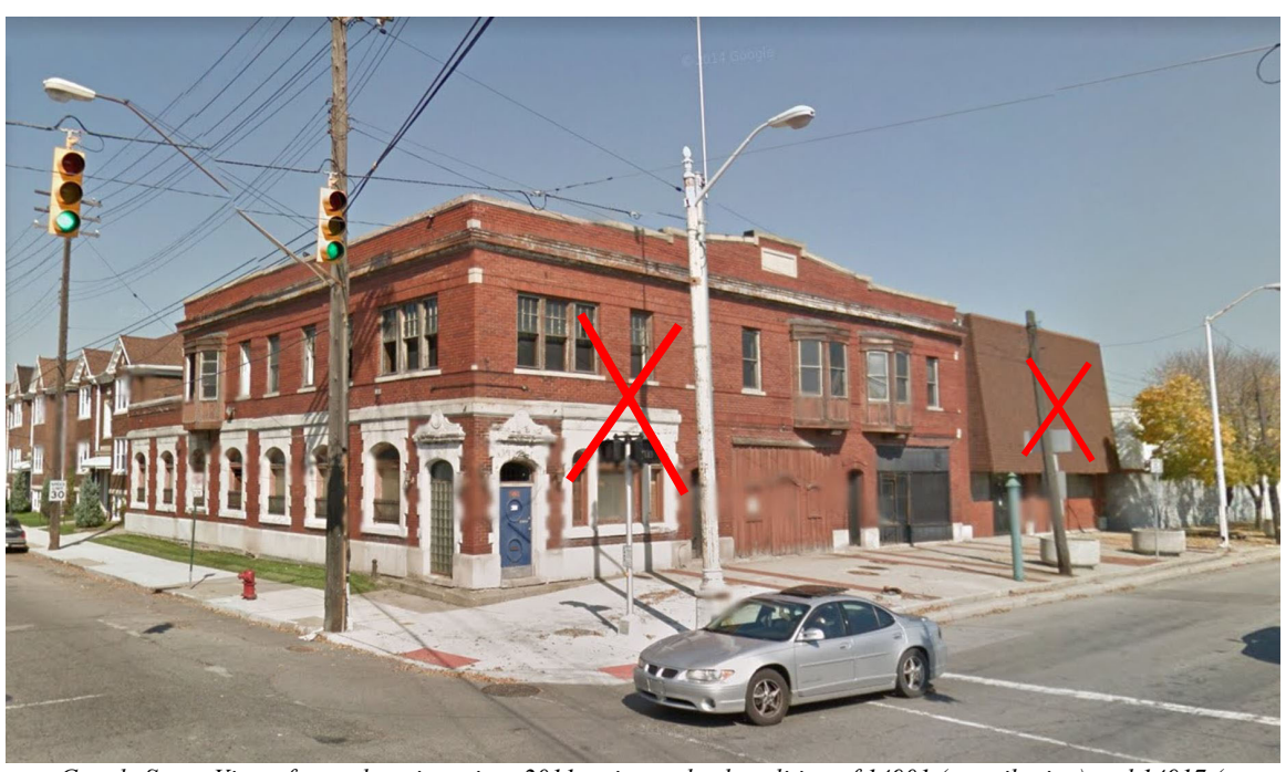
Google Street View of same location, circa 2011, prior to the demolition of 14901 (contributing) and 14917 (non-contributing), showing fully intact commercial block. 14927, the white building at far right, is partially extant, closed off from the street, and once served as the City of Grosse Pointe Park's DPW facility, since relocated to a new building erected on the Mack commercial corridor, also at the border with Detroit.

Since that time the parcel has been vacant, creating another gap in the street wall along East Jefferson. Landscape plantings, and a short section of fence closed with a metallic panel have since been added; none of this work has been approved by the Commission or its staff. The lot appeared in 2021 to be well-maintained, but is now suburban in character and out of place in this district. Since the start of adjacent construction activities in Grosse Pointe Park, these parcels have been used as a construction staging area. A construction fence was erected around the properties in late February 2023, without Commission approval. A gate in the construction fence opens towards Alter, crossing the public sidewalk.