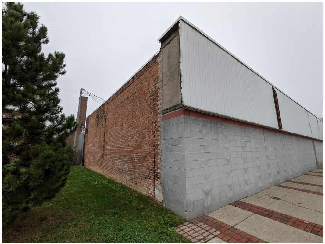
The westernmost section of historic brick buildings at 14927 East Jefferson prior to partial demolition in 2023, showing the approximately 40' of frontage subject to the Commission's jurisdiction. Note historic limestone still intact behind the incompatible white siding. The tall chimney at rear belongs to the "interior" building. Staff photo, October 2021.