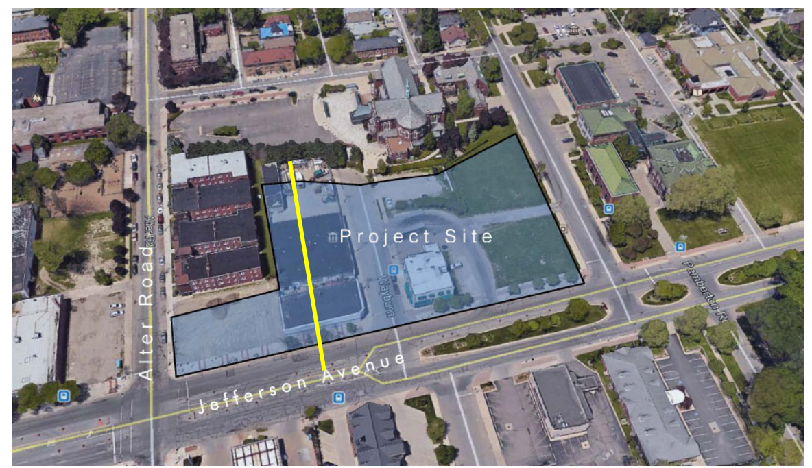
Aerial view of entire project site, from applicant's submission materials. The yellow line, added by staff, shows approximate location of city boundary/jurisdictional limits of the HDC.

Exhibit D - Schaap Center HDC Presentation - Page 16 of 23