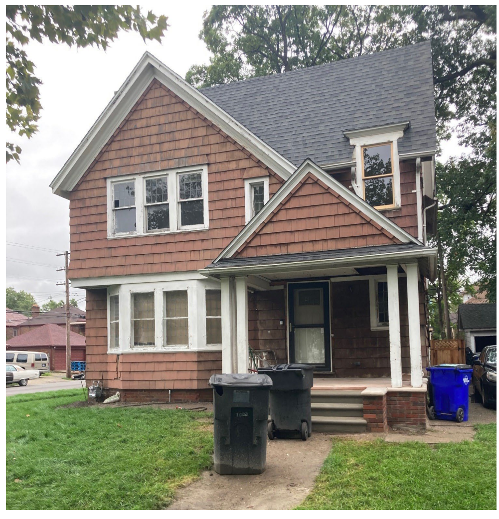
Figure 1: 4201 Glendale, looking southeast.

4201 Glendale is a two and a half story Tudor revival dwelling constructed ca. 1925. The frame dwelling is clad in wood shingles and features leaded glass windows. A detached garage is located to the south of the dwelling. The property sat vacant for approximately the last 10 years and suffered from deterioration but is now undergoing rehabilitation.