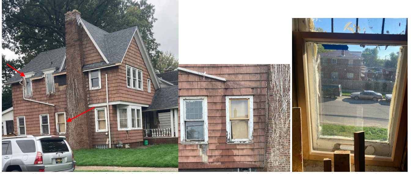
East Wall: One upper sash of a window on the lower story, and one lower sash at the second story have been replaced with new custom wood sash. The prior condition of the window is not visible due to extensive vegetation.