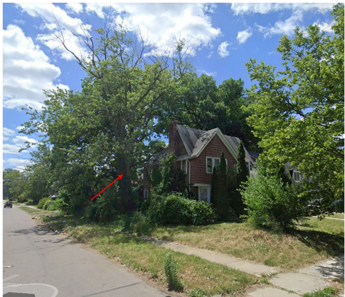
• Figure 3: View of 4201 Glendale from Google Street View, 2022. The red arrow indicates the tree that was removed from the property by the applicant.

Likewise, the foundation plantings and shrubs were overgrown and had the potential to damage the siding, chimney, and foundation.