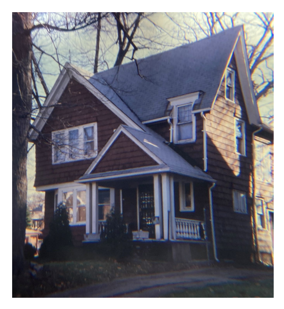
Figure 2: 4201 Glendale ca. 1999, looking southwest. HDAB