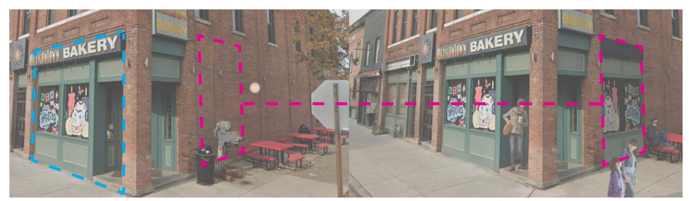
Left: Existing conditions. Right: Rendering of proposed work. Illustration from application documents.

The applicant proposes to expand the storefront by creating additional window openings on the east elevation. The new window area would have a similar appearance, including profile and color, to the existing storefront on the front (south) façade. The unfenestrated areas of the storefront are proposed to be clad in a proprietary exterior insulation and finish (EIFS) system. Above the window area, a sign is proposed.