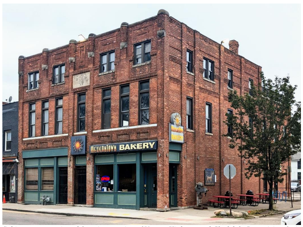
Subject property viewed from intersection of Vernor Highway and Clarkdale Street (view facing northwest). September 2023 photo by staff.

Although the first story has been altered, the original arched entrance in the center of the front façade and basic arrangements of the storefronts are still intact. Elongated three-part windows occupy the second story; pairs of short double-hung sash windows occupy the third story between the raised pilasters. Round buttresses project above the roof line. Ornamentation is in the form of raised brick blind panels; the inscription "ODD FELLOWS HALL, RIVERSIDE LODGE, 303, I.O.O.F., 1894" is inscribed in the masonry tablet above the middle, second story window.