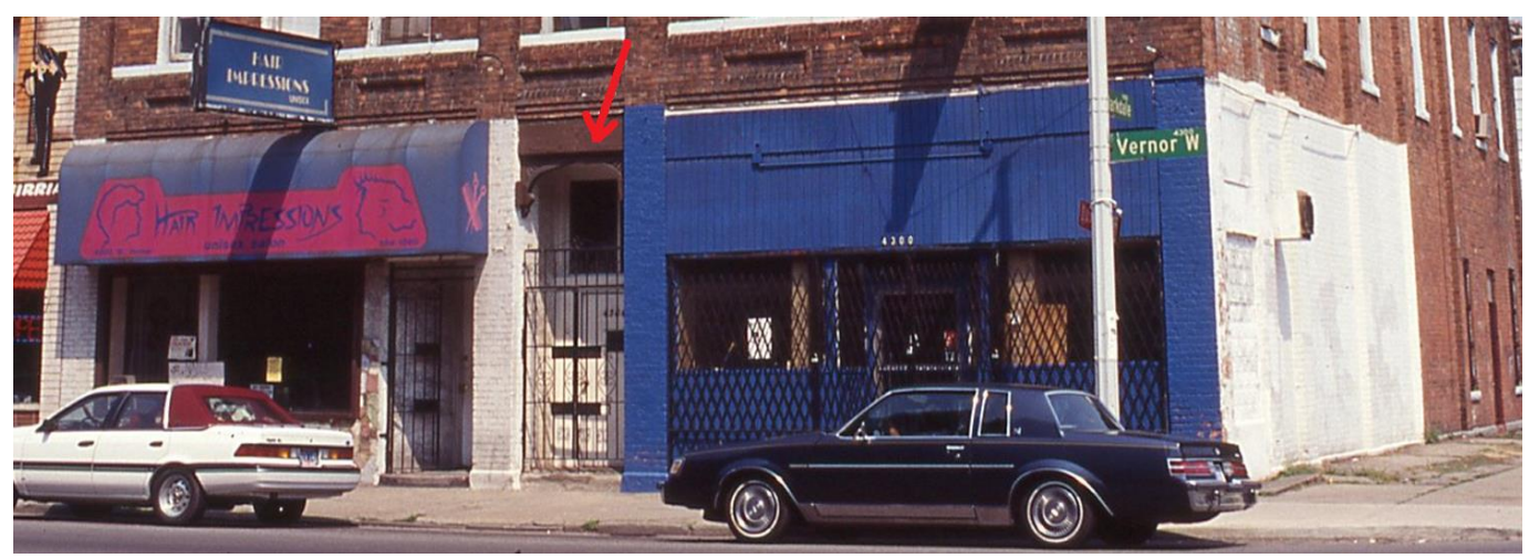
1993 Historic Designation Advisory Board photo, arrow added to indicate missing arch.

The ground-level storefronts have been altered since the 1993 description. Most prominently, a recessed, diagonal entrance bay has been created at the southwest corner, allowing access from Clarkdale Street in addition to West Vernor Highway. A vinyl awning and an expanse of T-111 siding have been removed. In their place, the present wood-panel and glass storefront has been added. Two business signs have been removed. Finally, a decorative arch, set within the central, south-facing doorway (noted in the HDAB description above) has been removed. Staff has no record of this work being approved by the Historic District Commission. The work meets the Secretary of the Interior's Standards for Rehabilitation, in the opinion of staff, except for the removal of the arch, which is not appropriate.