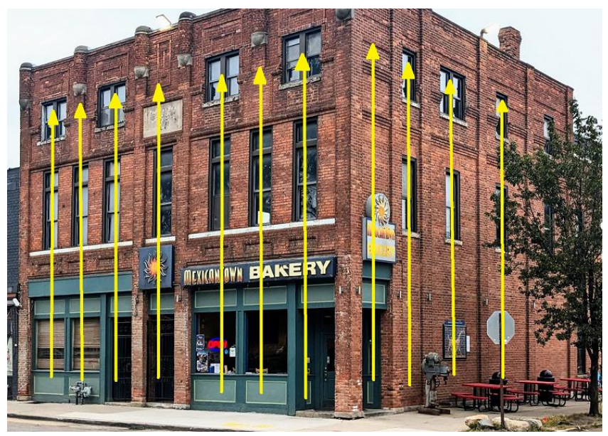
Vertical emphasis of the façade. Illustration by staff.