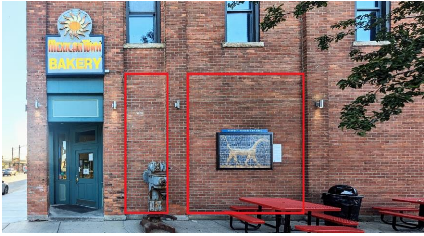
Examples of appropriate locations for new openings. Illustration by staff.