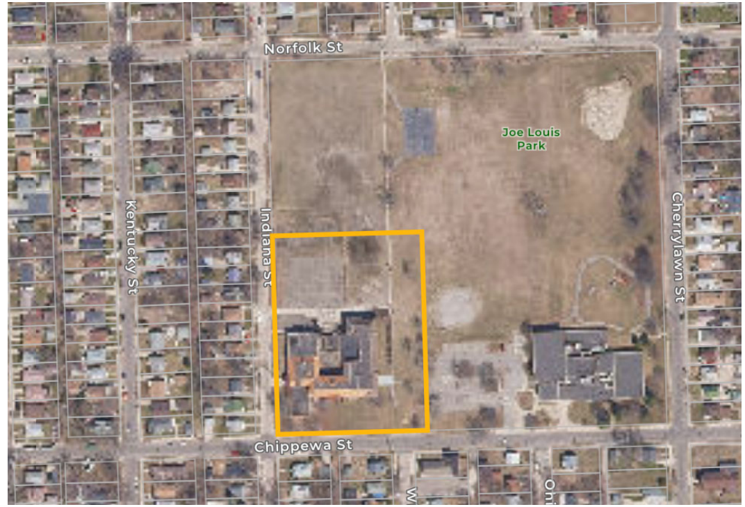
Detroit parcel viewer, tax parcel for 20119 Wisconsin outlined in yellow.