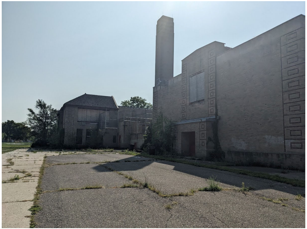
Existing conditions at the rear, showing areas of flat roof and utility parking lots. Staff photo, September 1, 2023.