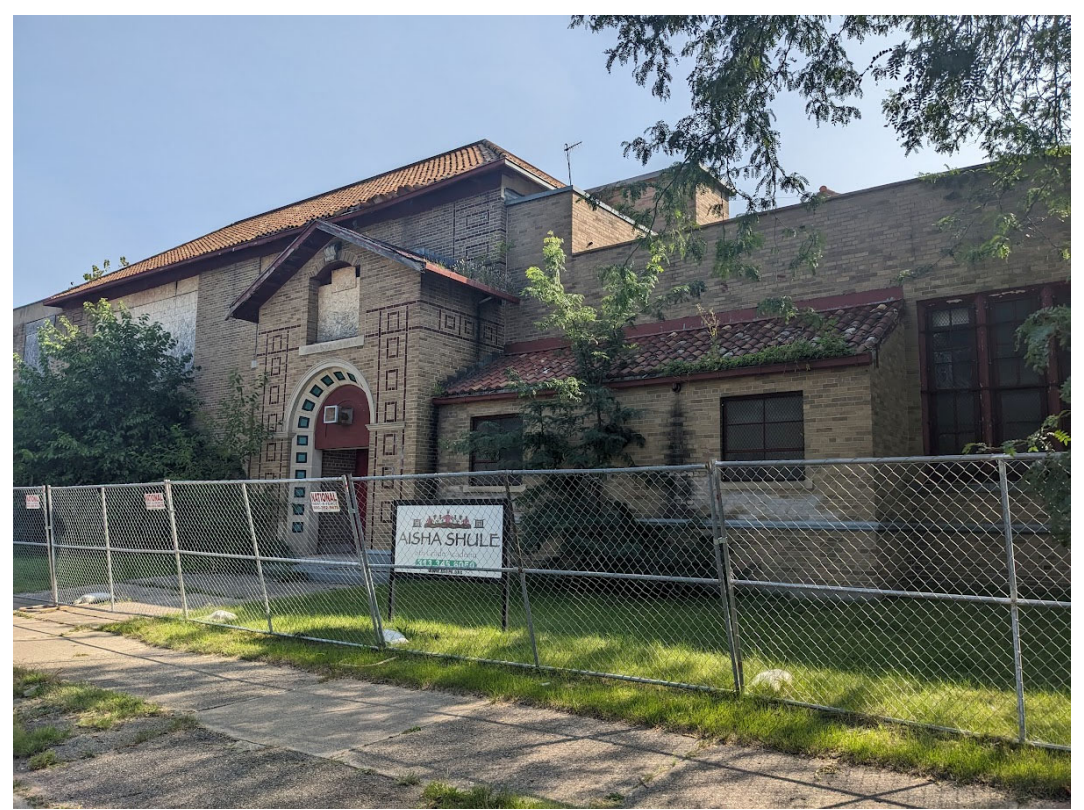
View of west-facing "front" entrance from Indiana Avenue. Staff photo, September 1, 2023.