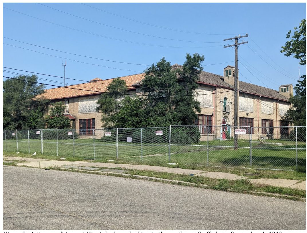
View of existing conditions at Higginbotham, looking to the northwest September 1, 2023.

The project site is a single corner parcel upon which stands the vacant Higginbotham School. The building is just under 50,000 SF and, along with parking lots, occupies a 2.5-acre site that itself is the southwest corner of a much larger parcel including Joe Louis Playfield and the Johnson Recreation Center (also a local historic district).