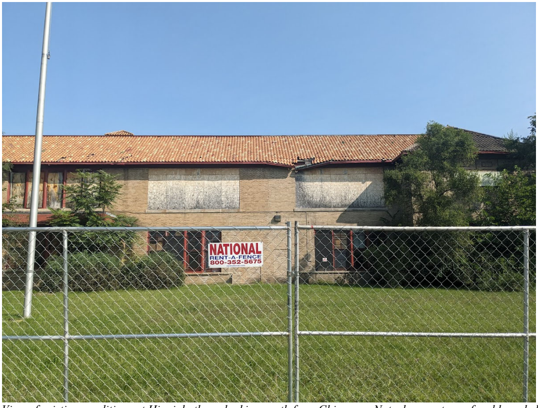
View of existing conditions at Higginbotham, looking north from Chippewa. Note damage to roof and boarded windows. Staff photo, September 1, 2023.

near and on the property. School buildings, given their great size and multiple entrance opportunities, have been a challenge for the city and its agencies to protect from scrapping or trespass, despite continuous efforts.