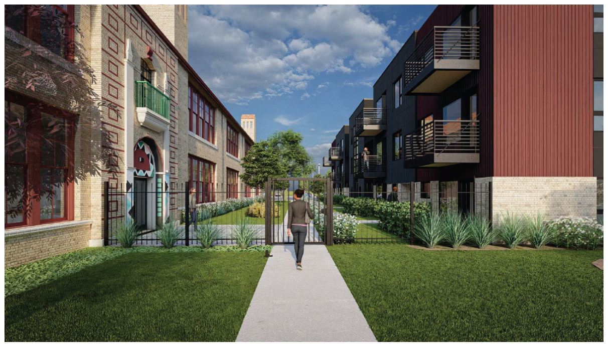
Rendering of historic building (left) with new building (right) from the applicant's materials. Note the conceptual similarity of several design elements (window rhythm, colors. textures, materials, height, entrances, balcony projections) that the modern building uses.