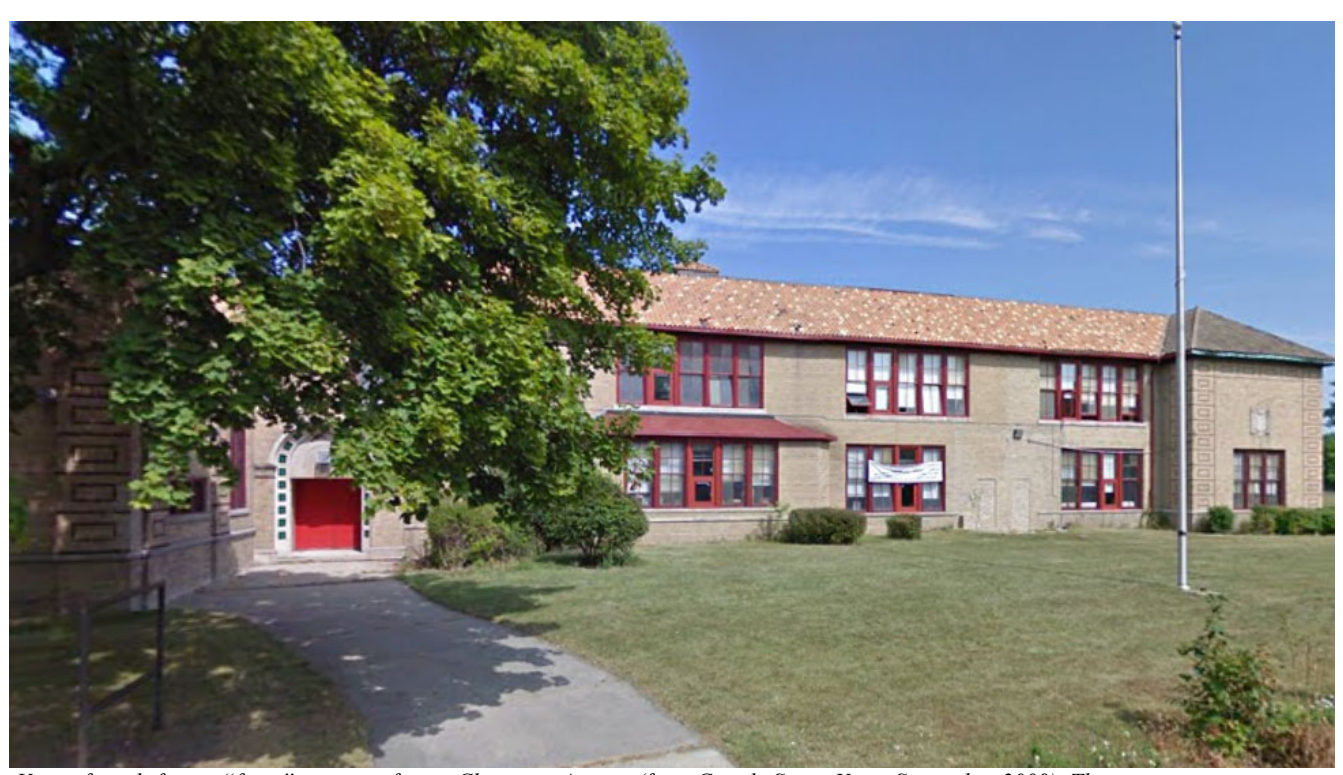
View of south-facing "front" entrance facing Chippewa Avenue (from Google Street View, September 2009). This view is now overgrown. The auditorium block, which has its own Chippewa-facing entrance, is cut off at the extreme left of this image.