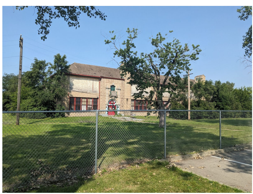
View of east elevation (on vacated Wisconsin Street), nominally described as the "front" elevation in the HDAB Report. Diseased tree is in approximate location of new building footprint. September 1, 2023.