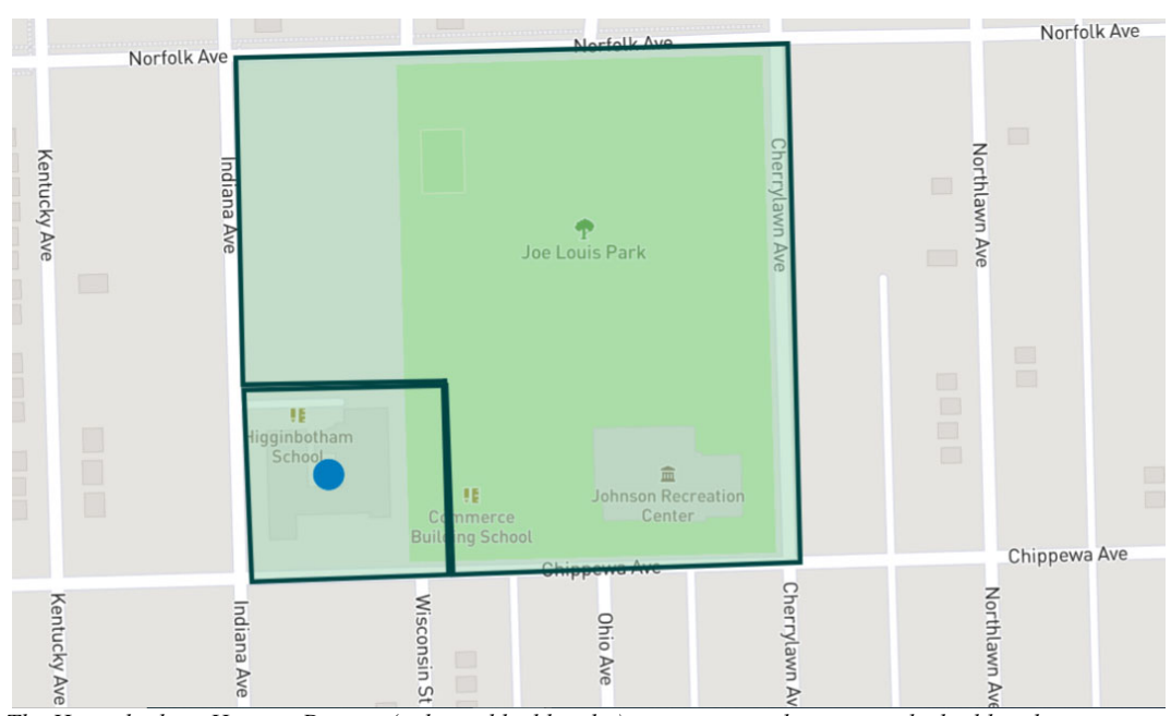
The Higginbotham Historic District (indicated by blue dot) encompasses the entirety the building but may not encompass the entirety of the building's tax parcel shown above, despite text in HDAB report claiming that it does.\(^1\) Nevertheless, this district is adjacent to and surrounded on two sides by the larger Johnson Recreation Center and Joe Louis Playfield Historic District. As such, all portions of the project are subject to Commission review.