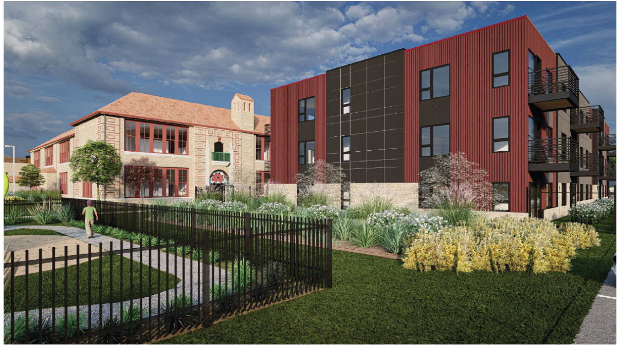
The newly proposed site buildings are of a strikingly contemporary design. However, stylistic conformity is never a requirement under NPS Standards and Guidelines, and can instead detract from truly historic buildings by creating sub-par facsimiles that fail to measure up to the hand-made quality of the historic context. The architect here has incorporated a range of textures, combinations of horizontal/vertical elements, and compatible colors (earthtones) that clearly reference the historic design elements of the original building.