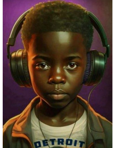
Diagram 1, by applicant: proposed concept image provided by the muralist, Sintex.