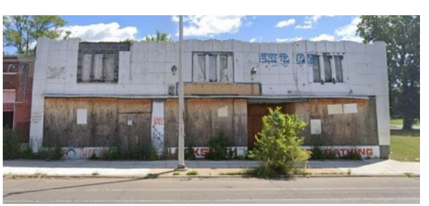
Site Photo 3, by Google Streetview June 2022: (West) front elevation, showing conditions prior to GSD painting the facade.

The designation photo and preceding photos of the front elevation of the building shows that the structure was previously painted. At the time of designation, different colors denote various businesses occupying the same structure ( see designation photo and site photo 3). A consistent characteristic over time, however, is that the windows, doors, and storefront were distinct and discernable features