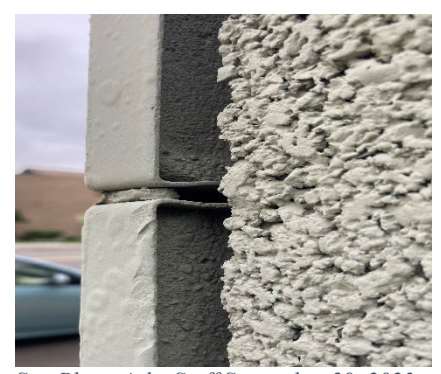
Site Photo 4, by Staff September 29, 2023 (front elevation): showing metal paneling detail.