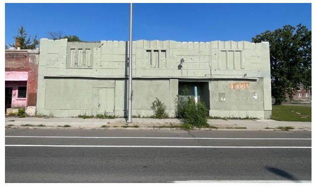
Site Photo 1, by Staff September 21, 2023: (West) front

Built in 1947, the property at 12512 Dexter is a two-story commercial building facing west and adjacent to an empty lot on the northeast corner of Sturtevant and Dexter. The corner lot was once occupied by a three-story mixed use building with commercial frontage on the first floor, which has been demolished leaving this current building's south elevation publicly visible for the first time since designation in 1999. This south facing side elevation has both concrete block and brick cladding, which is divided by the location of the former building. This is the proposed location for a mural as part of the General Services Division's (GSD) "City Walls" program. The flat roof has a front facing parapet with art-deco detailing. The front façade's detailing features rectangular metal paneling applied to a brick masonry substrate. The second floor has a series of three ribbons of vertically oriented window openings. The first floor has storefront corresponding to each window series above, with glass door openings between each set of storefront windows. All windows and doors have been boarded with plywood, and some of the metal panels have been removed or have fallen off the front elevation. The building was recently painted on both the front and side elevations by GSD without approval, with a single shade of light olive gray. A concrete public walkway runs between the front elevation of the building and Dexter Avenue.