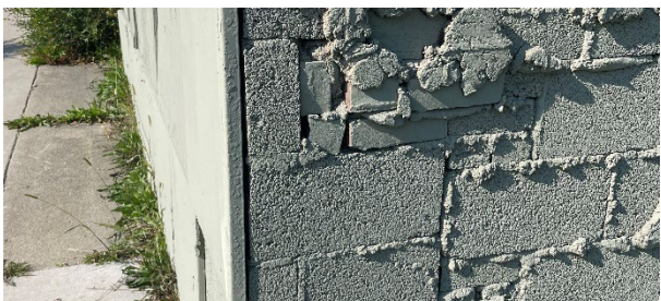
Site Photo 5, September 21, 2023 (front and side corner elevation): showing mortar and concrete block materials

• In reviews and staff analysis for art projects in historic districts, the content, expression, and message of the art is not considered, only its potential effect of its installation on architectural character.