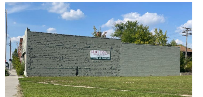
Site Photo 2, September 21, 2023: (South) side elevation, showing mural location.