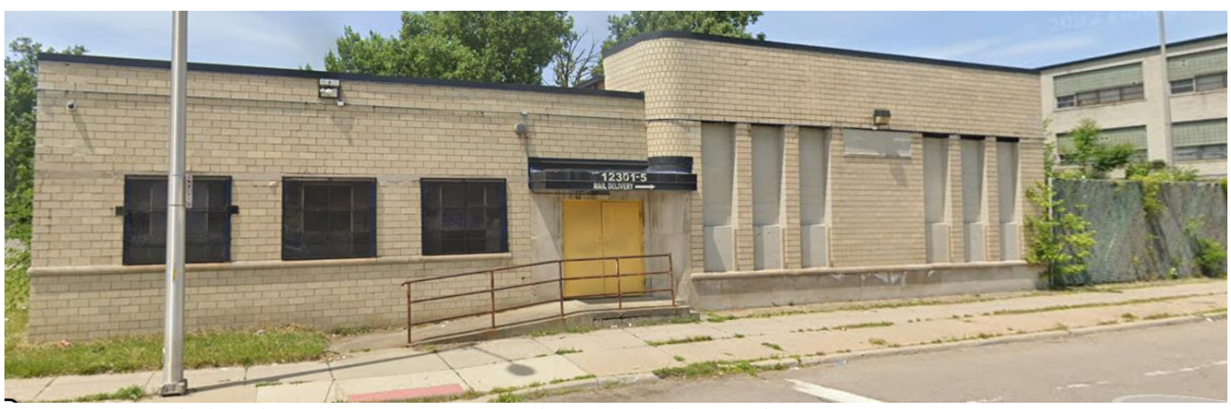
Congregation Beth Shmuel at 12837 Dexter Avenue. July 2022 Google Maps photo.

• As the subject building is a largely unaltered example of Art Moderne architecture from the period of significance, staff opinion is that it is clearly a contributing resource. Further, the Final Report highlights, among nineteen representative architecturally significant resources described in detail, the Art Moderne Congregation Beth Shmuel at 12837 Dexter Avenue. This further supports the importance of Art Moderne architecture in the district. Other Art Moderne buildings in the district (though not highlighted in the Final Report) are a church building at 12837 Dexter Avenue and a commercial building at 13107 Dexter Avenue.