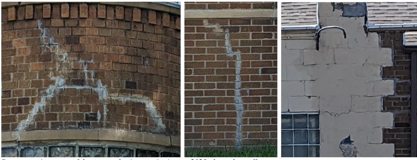
Representative areas of damage and prior repair.