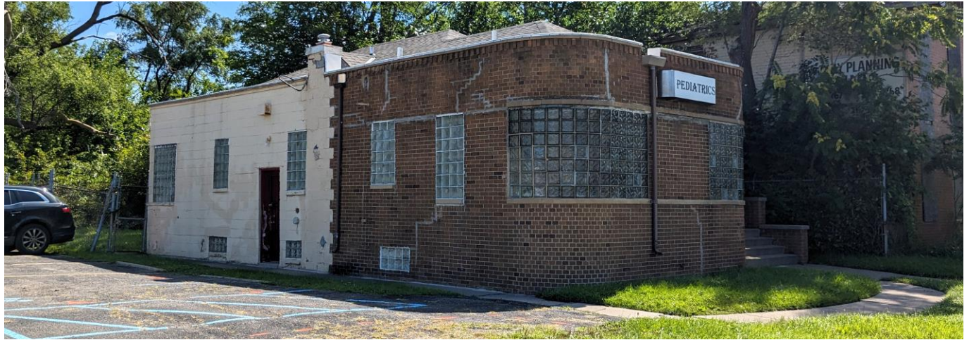
August 2023 photo by staff.