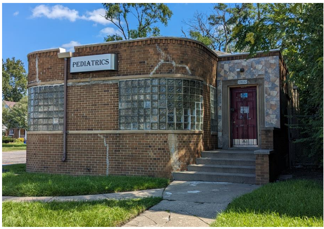
August 2023 photo by staff.

This property is a single-story, Art Moderne or Streamline Moderne professional office building, built in 1946, facing west onto Dexter Avenue. The curved, brick façade, glass block windows, stone sills and lintels, stone coping, fluted stone door surround, and dentil cornice are important, character-defining features of this minimalist architectural style. Portions of the side (north and south) elevations and the entire rear (east) elevation are constructed of concrete block, also a historic feature. Non-historic components include square tiles surrounding the front (west) entrance, red-painted steel doors on the front (west) façade and side (north-facing, towards the present-day parking lot) elevation, and a stainless-steel identification sign on the front (west) of the building. The latter is likely a newer sign in its historic location.