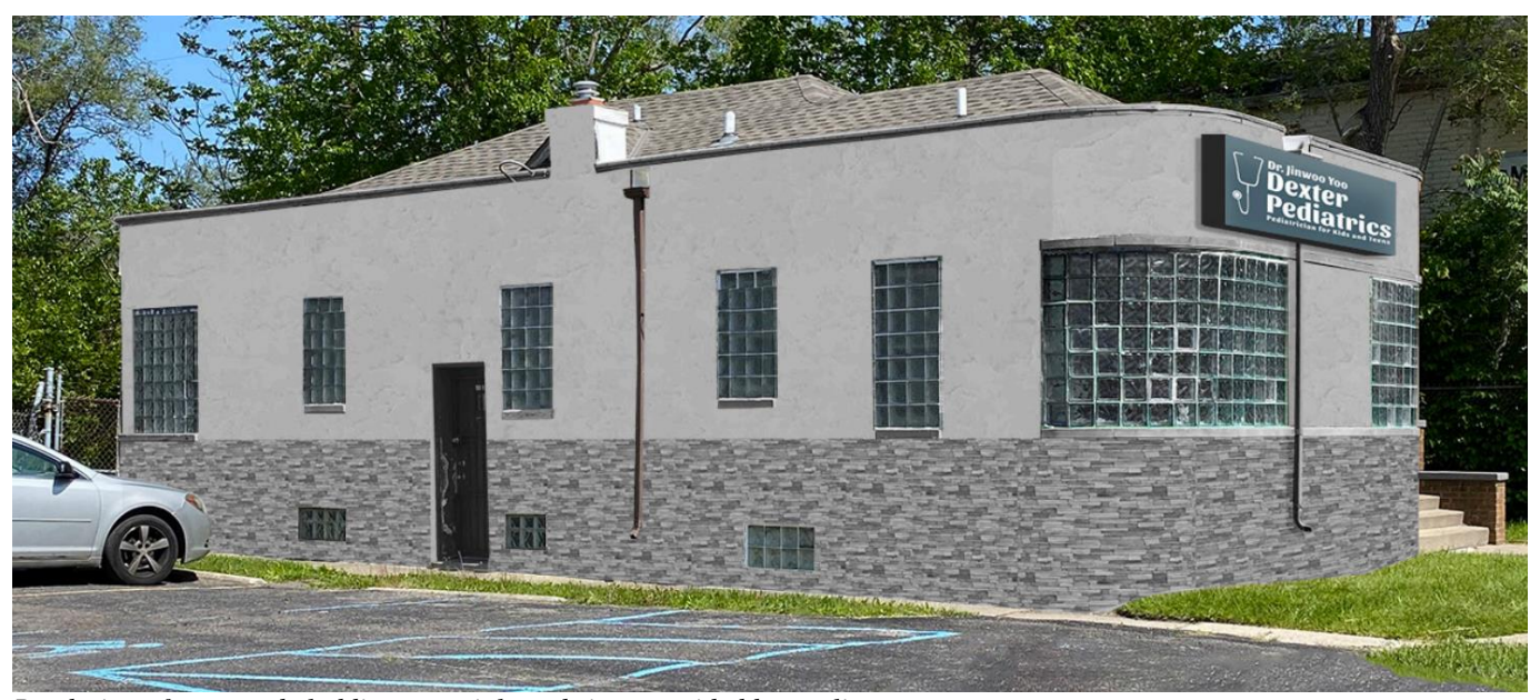
Rendering of proposed cladding materials and sign, provided by applicant.