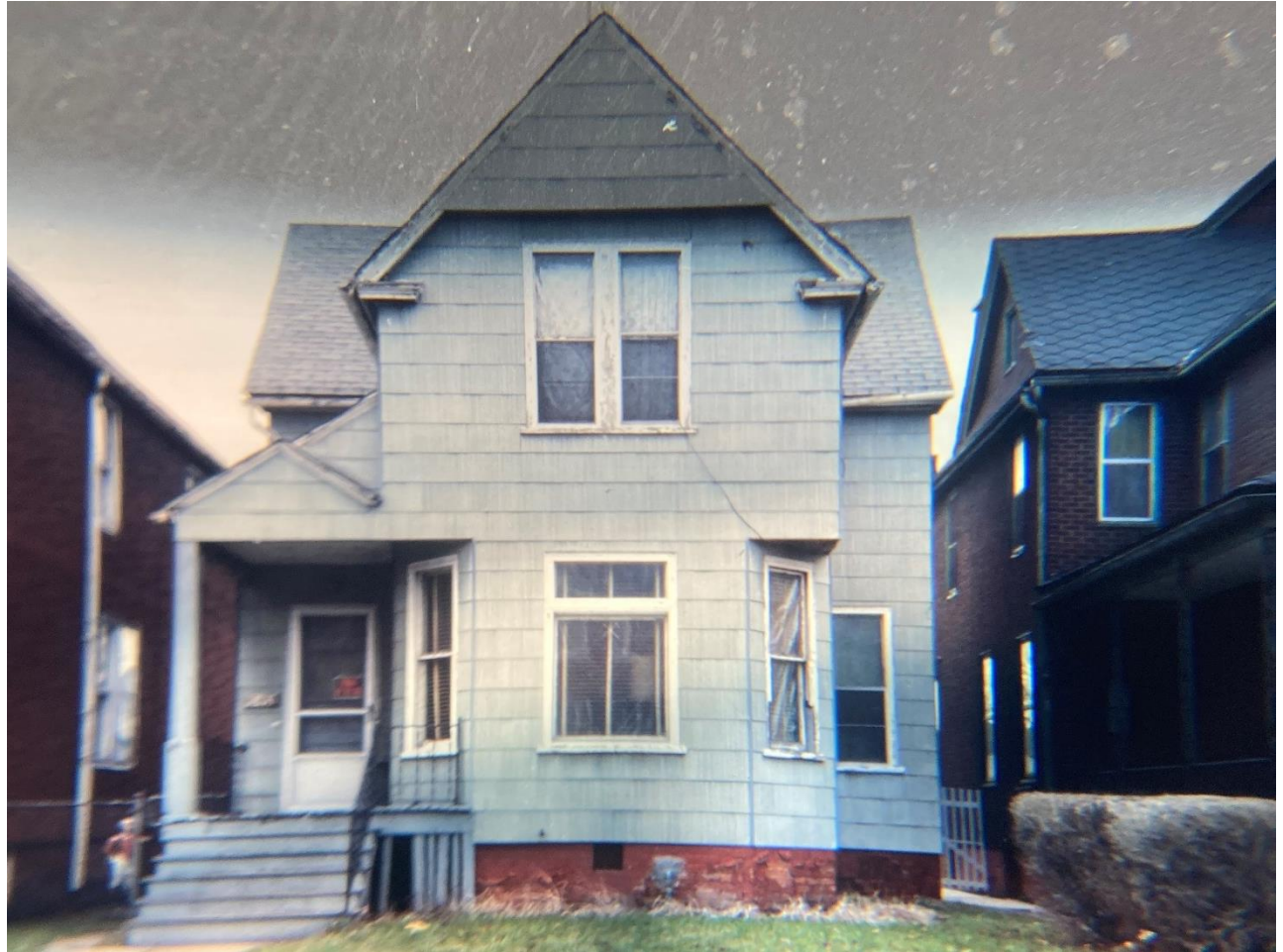
1815 Church, designation slide. Note siding and porch