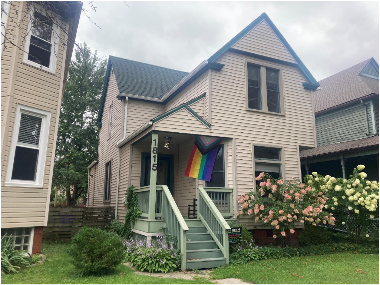
1815 Church, current appearance. Staff photo taken 8/31/2023

The building located at 1815 Church is a single-family dwelling that was erected ca. 1900. The 2story, cross-gabled home is clad with vinyl siding. Windows are 1/1, aluminum-clad wood units. The primary entrance is sheltered by a shed-roof porch which includes a square wood column and a wood floor, steps, and handrails. A deteriorated concrete slab is located in the property's rear yard.