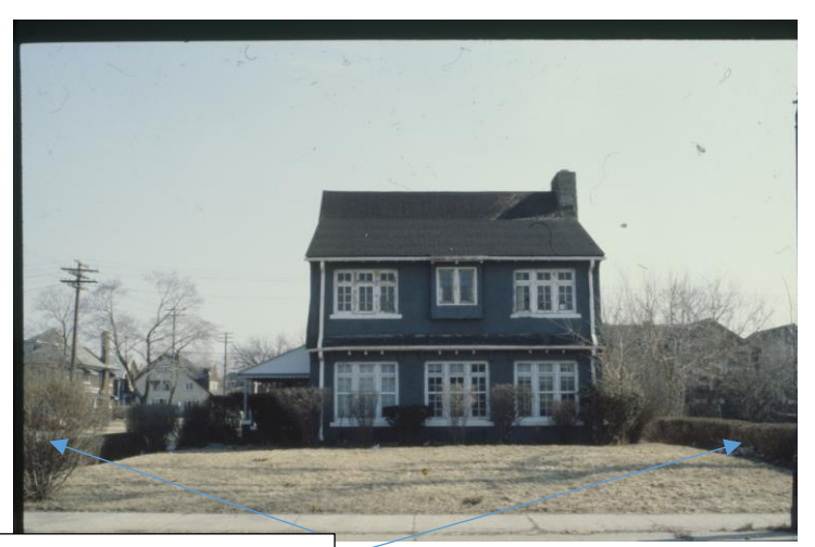
Appearance in 1980. Note presence of shrubs