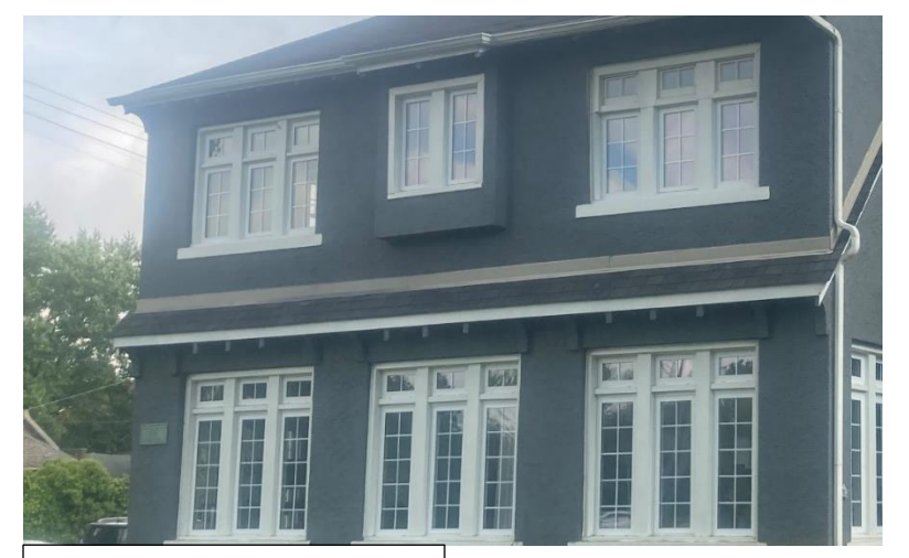
North side, current conditions

Note muntins between the glass and boxy aluminum coilstock casing and mullions at current windows. Lite configuration matches with the originals with the exception of the windows in the 2<sup>nd</sup> story bay. Operation appears to match the original windows