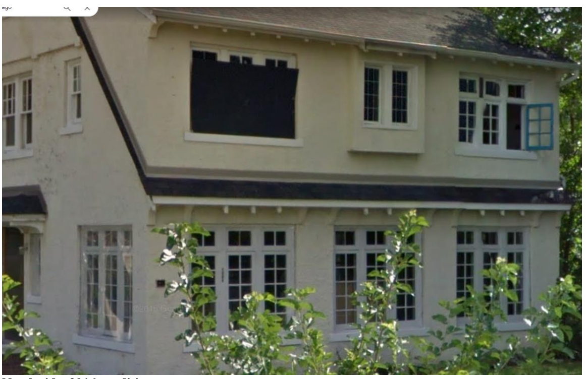
North side, 2016 conditions

• As previously noted, the current vinyl window units were installed by a previous property owner in 2017 without HDC approval. See the below photos of the original windows and the current vinyl units.