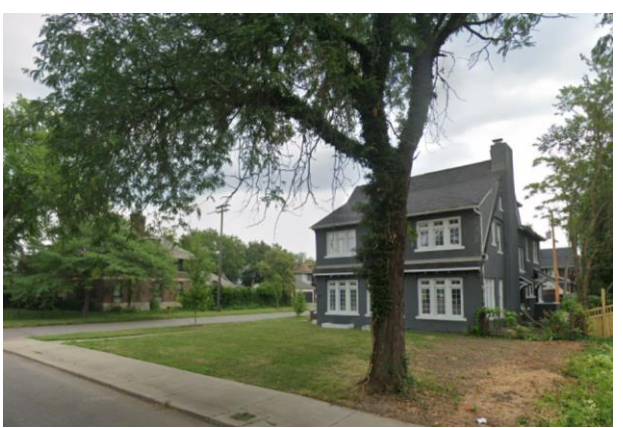
Property's appearance of side yard, along Chicago post landscape removal. Google Streetview, 2022