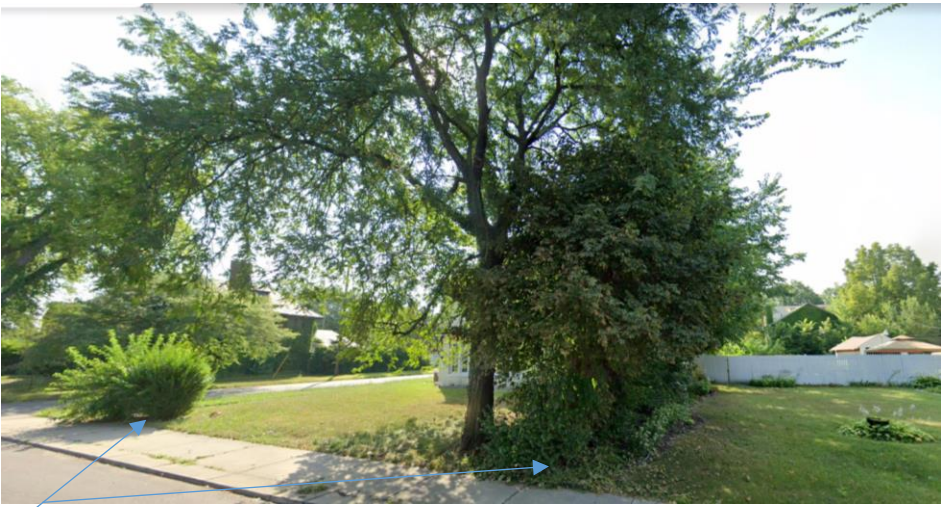
These shrubs removed in side yard along Chicago Blvd.