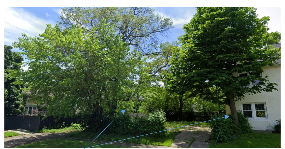
These mature shade trees removed at side yard along Byron. Also all of the shrubs were removed. Google Streetview, 2019

• See the below photos and images which indicate that most of the landscaping from the side and rear yards was removed in 2023. Also, see designation slide from 1980 which indicates that shrubs were present within the north side yard (along Chicago Blvd) and the shade trees which were in the south side yard (along Byron) were also present)