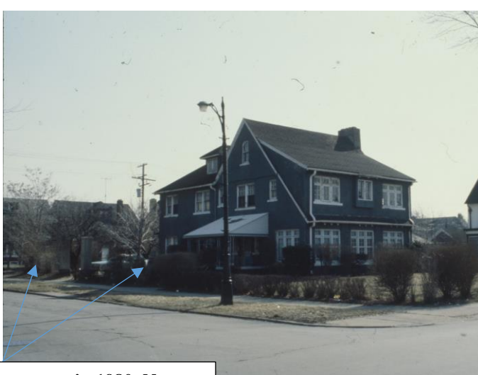
Appearance in 1980. Note presence of shade trees

• As demonstrated in the above photos, the two shade trees in the southern side yard (along Byron) and the shrubs in the northern side yard (along Chicago) that were recently removed