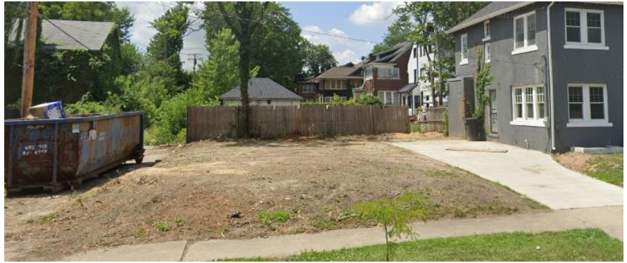
Side yard along Byron, taken immediately after landscape removal. Google Streetview, 2022.