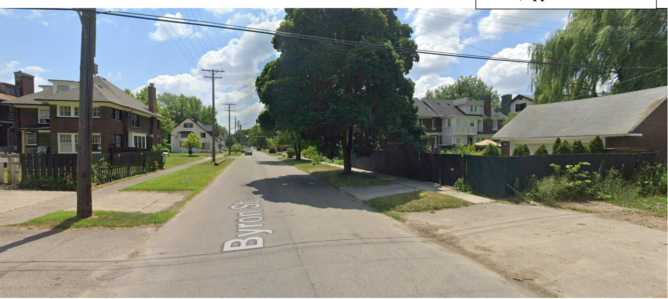
Additional fences located at the sidewalk, within the same block on Byron. Google Streetview 2022

• See the below photos and images which indicate that most of the landscaping from the side and rear yards was removed in 2023. Also, see designation slide from 1980 which indicates that shrubs were present within the north side yard (along Chicago Blvd) and the shade trees which were in the south side yard (along Byron) were also present)