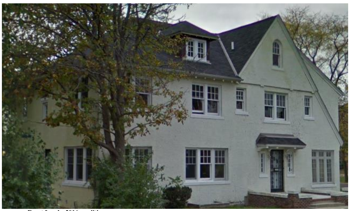
Front façade, 2016 conditions