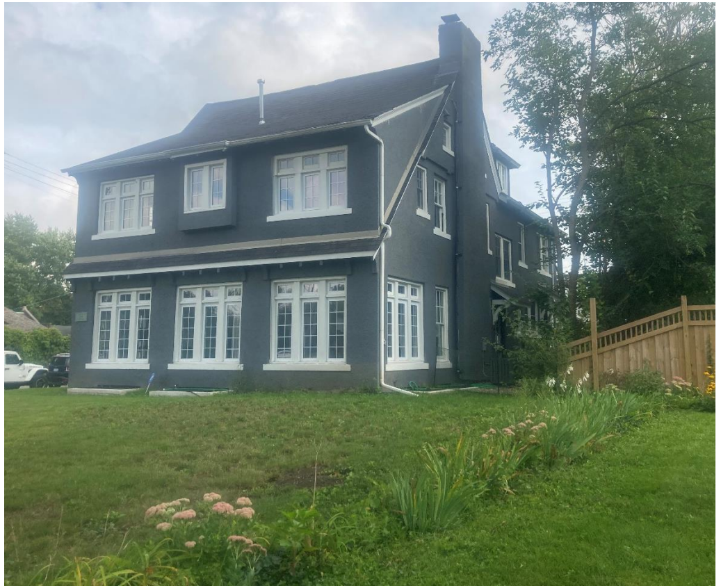
1405 Chicago Blvd., current appearance.