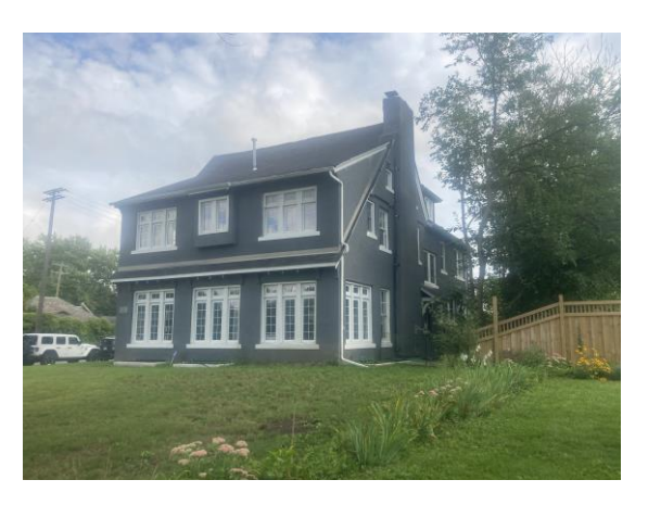
Current appearance, photo taken 8/31/2023