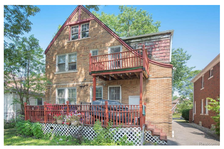
Site Photo 3 (unknown date) March 22, 2023: (South) rear elevation, showing original windows.