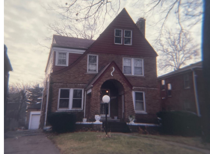
Designation Slide, 1999: (North) front/side elevation showing original windows.

This property has the following HDC approvals and violations for work done without approval on Detroit Property Information System (DPI):