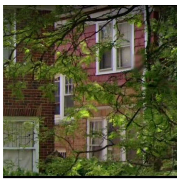
Site Photo 7, showing original curved top rail of the double hung window pair, located over the side entrance.