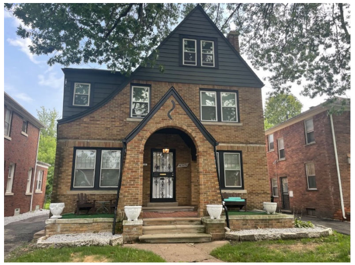
Site Photo 1, by Staff August 24, 2023: (North) front elevation showing replaced windows on 2<sup>nd</sup> & 3<sup>rd</sup> floors.

Erected in 1924, the two and half-story dwelling at 4325 Fullerton features a front, sweeping gable from the 3<sup>rd</sup> to 2<sup>nd</sup> floor that characterizes it as English or Tudor Revival. The roof is covered with asphalt shingles. The walls are clad with light brown brick with a running limestone band between the first and second floors. The third-floor gable and the second-floor side gable siding are clad in wood clapboard. The former wood, double hung windows were in a 6/1 or 8/1 true divided lite configuration, have since been replaced with 1/1 vinyl on the 2<sup>nd</sup> and 3<sup>rd</sup> floors on the front and side elevations. Each window opening has a limestone sill. Basement windows have been replaced with glass block on the side elevations. The elevated front porch shows no railing in the designation photo, and the brick porch with concrete decking remains without a railing. The arched entrance is roofed with a portico that meets the front edge of the porch and steps, flanked with brick walls that lead to a concrete arching walkway through the front yard.