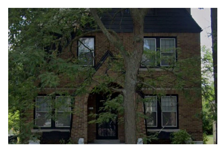
Site Photo2, Google Streetview June 2022: (North) front/side elevation showing windows before work.