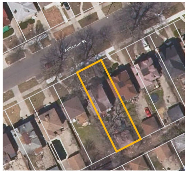
Aerial of Parcel # 14004828.