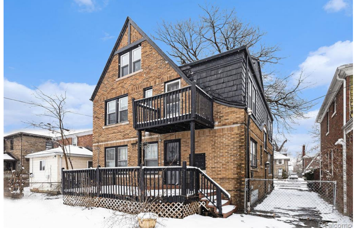
Site Photo 4: (South) rear elevation showing replaced windows (unapproved) and approved repaired siding, new railings, and trim/siding paint work. Notice windows on 2<sup>nd</sup> and 3<sup>rd</sup> floor have been replaced, while the original first-floor windows remain.