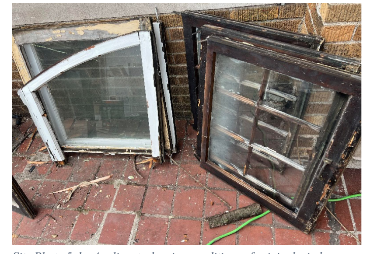
Site Photo 5, by Applicant, showing conditions of original windows removed. The archtop window shown here may be from the window pair discussed on the next page.