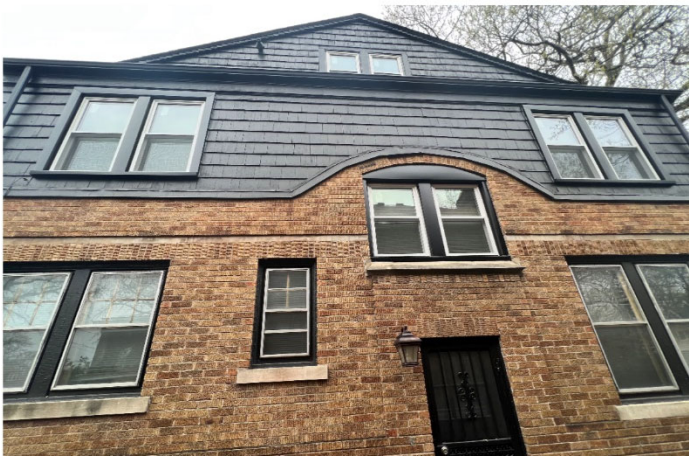
Site Photo 6, by Applicant, showing vinyl cover arch over vinyl window pair, located over the side entrance.