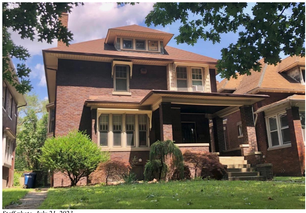
Staff photo, July 21, 2023.

The 2-1/2 story dwelling is located on the east side of Hubbard, roughly mid-block. The walls are faced with dark red brick and the wood windows and trim are painted a contrasting yellowish-beige color that almost matches the color of the stone windowsills. The grouped windows at the front wall protrude from the wall plane. The first floor's extension encompasses four narrow windows and is faced with matching dark red brick and covered by a shallow hip roof. The second-floor extension has two mulled windows and is faced with siding; the deep overhanging eave acts as a roof for this element. A hip roof dormer with three square windows is centered at the third floor and breaks through the front slope of the house's hip roof. The wide overhanging eaves at every level of the house, coupled with the deep covered porch, which is supported by unadorned square brick piers, offer Prairie-style elements to the dwelling.