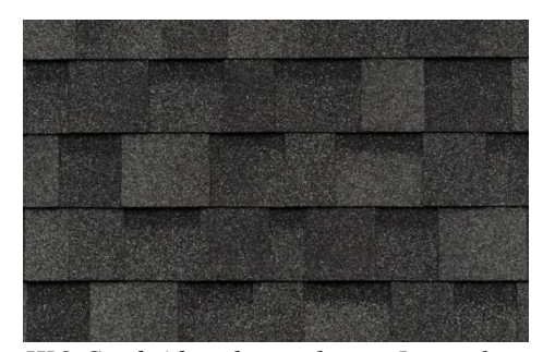
IKO Cambridge charcoal grey. Image from application.

The garage shingles are proposed to be IKO Cambridge architectural shingles in charcoal grey; the gutters and downspouts are proposed to be black.