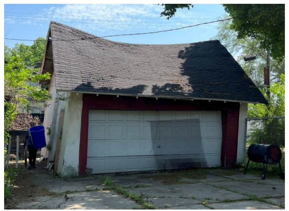
Photo by applicant indicating non-historic steel door and structural damage.