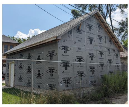
Example garages and carriage houses in the vicinity of the subject property. July 2023 photos by staff.

• Lap siding is not common for houses in Boston-Edison, but is it very common for garages. For example, the next-door property at 937 Chicago has a garage clad in lap siding.