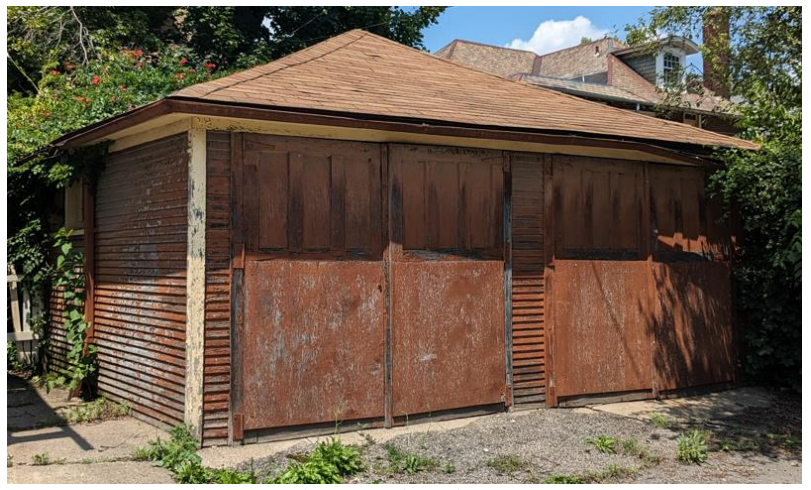
Garage at 937 Chicago. July 2023 photo by staff.

• Lap siding is not common for houses in Boston-Edison, but is it very common for garages. For example, the next-door property at 937 Chicago has a garage clad in lap siding.