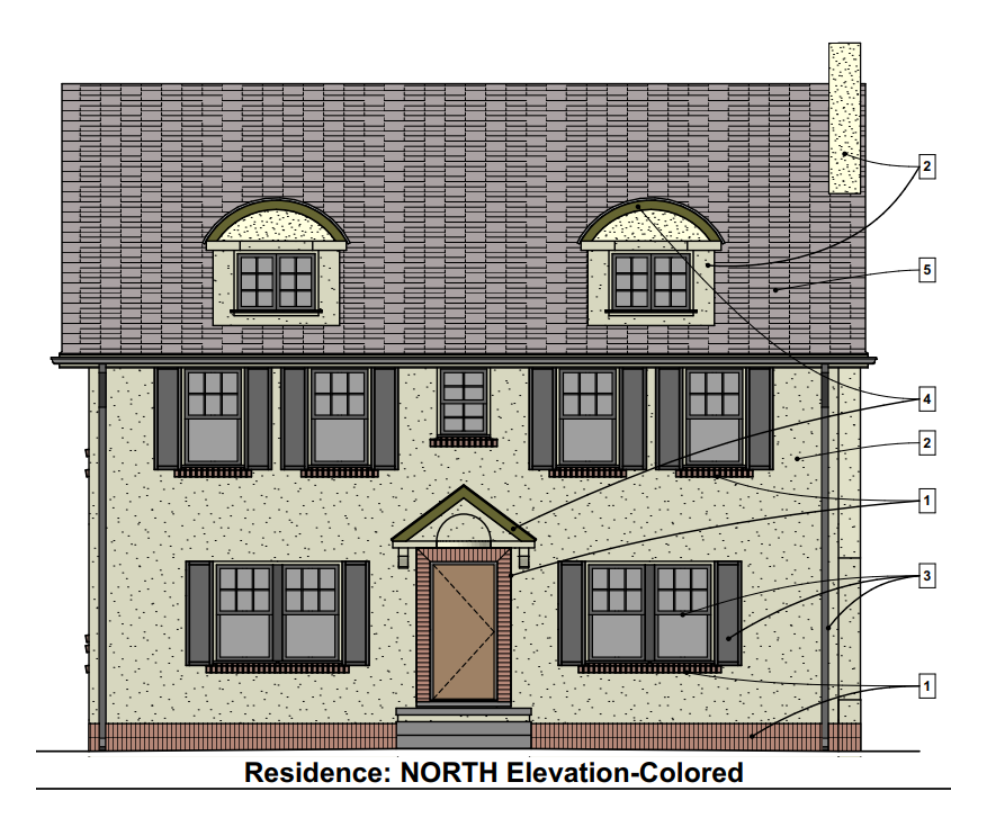
Proposed color scheme. Rendering from application documents.

Once the house is repaired, the proposal is to paint the entire building the same four colors as the new garage, mentioned above.