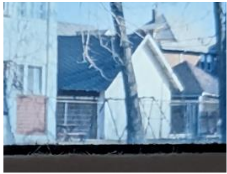
1988 Historic Designation Advisory Board photo.