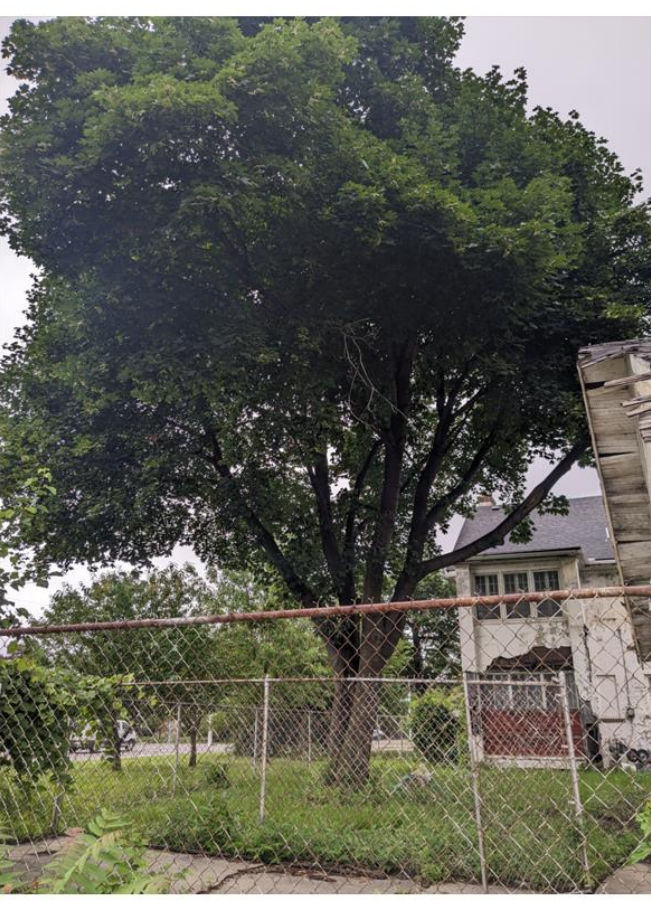
Maple tree viewed from Hamilton (left) and alley (right).