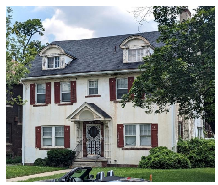
Left: House. Below: Garage, viewed from alley. July 2023 photos by staff.

Built in 1916, the property at 949 West Chicago Boulevard is a two-and-one-half story, stucco-clad house facing north onto the street. It is Colonial Revival in style; details include an entry portico with curved underside, semicircular dormers, a dentil cornice beneath the eave line, and solder brick courses highlighting the foundation, chimney, doorway surround, and window sills. It is located on a corner, double lot. The garage, also subject of this application, is a two-bay, side-gabled building with stucco cladding and visible rafter ends. The garage was built concurrently with the house, according to building permits.