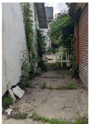
Areas of concrete proposed for replacement. August 2023 photos by staff.