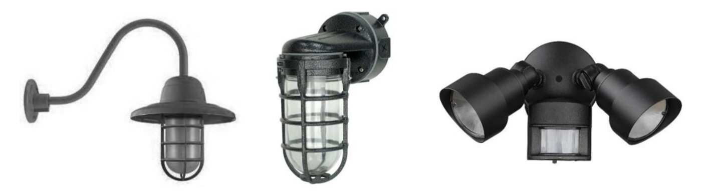
Proposed light fixtures as shown in application documents. Left to right: Barn Light Electric Industrial Guard LED gooseneck light, Southwire tamperproof alley light, Acclaim Lighting security floodlight.

Colors proposed for the garage are from Color System C: C:4 Yellowish White for lap and stucco siding, B:19 Black for windows and garage doors, B:11 Grayish Olive Green for pedestrian door.