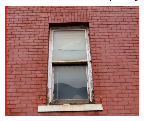
Site Photo 3, by Applicant 2019: (East) side elevation, showing original wood, double-hung window and depth of inset of the sash into the window opening.