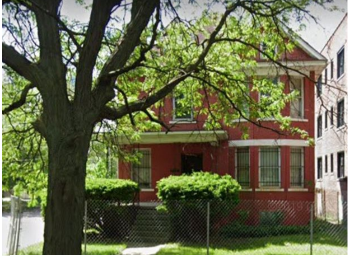
Site Photo 2 by Google Street, June 2019: (North) front elevation showing original windows.

This property has the following HDC approvals and violations for work done without approval on Detroit Property Information System (DPI):