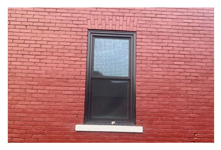
Site Photo 4, by Applicant 2023: (East) side elevation showing new installed window flush with wall opening.