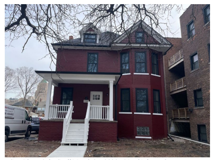
Site Photo 1, by Staff March 24, 2023: (North) front elevation.

The building located at 729 Seward Avenue is a 2½-story single-family residence constructed ca. 1907. The structure is clad in red brick which is also painted red in color and features limestone and wood details as well as cedar shake. The asymmetrical façade includes a two-story bay at the right side of the elevation and a raised covered porch at the left side of the elevation which includes the main entrance to the house. The wood double-hung windows were replaced without approval and are the subject of this application. The multi-gabled roof is covered in reddish-brown asphalt shingles and features three dormers (2 at the front elevation and one at the rear elevation). The property includes a parking lot directly adjacent to the house to the east which is accessed via a curb cut onto Seward Avenue. A large garage is located behind the house at the far southwest corner of the lot.