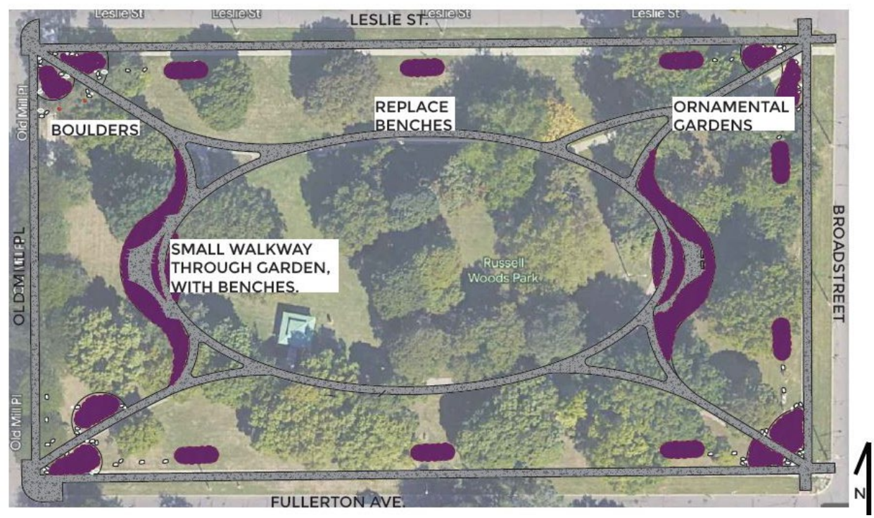
Figure 1, by Applicant: Proposed site plan showing pathway, new planting beds, benches and boulder locations.