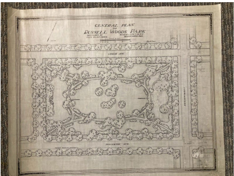
Figure 2, 1925 General Plan of Russel Woods Park, showing original pathways and plantings configuration.