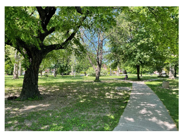
Site Photo 3 May 25, 2023: (facing east) ellipse path showing canopy and existing benches.