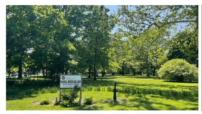
Site Photo 1, by Staff May 25, 2023: (facing west) showing park signage.

Bounded by Old Mill Place to the west, Leslie Avenue to the north, Broadstreet to the east and Fullerton Avenue to the south, this 3 acre park dates back to the early 1920s. Each corner of the park serves as an entrance to this neighborhood park with a concrete pathway under a shaded canopy of trees that then opens to a central clearing of open lawn. The path then becomes a large ellipse that takes the visitor around the outer edge of the central lawn. Larger shade trees of London plane tree, oak and maple are joined by smaller, crabapple ornamental trees and various shrubs. At some locations, overgrowth has taken over the planted material and its removal is part of this proposal. Other than some of the larger trees, there are no historic-aged structures on site. A recent addition of a picnic shelter stands toward the southwest area of the park. The surrounding adjacent neighborhood consists of residential single homes facing the park.