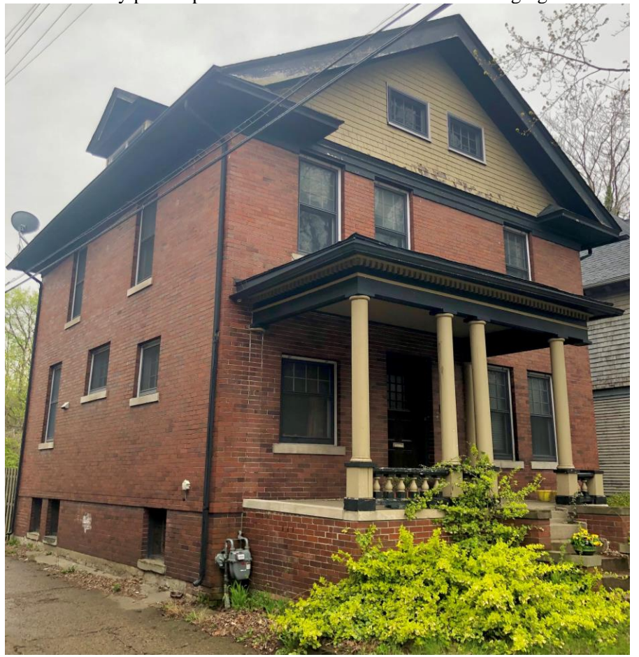
April 26, 2023.

The 2-1/2 story house at 7938 E. Lafayette was erected between 1897 and 1910. The property is sited to the northsouth and faces onto two alleys; the north-south alley immediately east of the house connects E. Lafayette with Van Dyke Place, and the east-west alley behind the home is where the garages are located. The front and side facades of this masonry house are clad with smooth faced brick set with narrow grout lines, creating an almost monolithic appearance to the house's walls. The rear elevation is faced with common brick that appears to have darkened over the decades. The gable-faced front and rear elevations are almost identical to each other, the gable walls feature wood shake siding and two centrally placed small awning windows. The side elevations are also similarly detailed to each other with centrally placed pedimented dormers and wide overhanging boxed eaves.