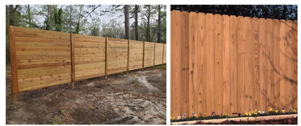
Left: Option One. Right: Option Two. Images from application.

Two optional configurations are proposed for the fence. Option One is a horizontal board fence. Option Two is vertical dog ear board fence. The proposed stain color is red mahogany,