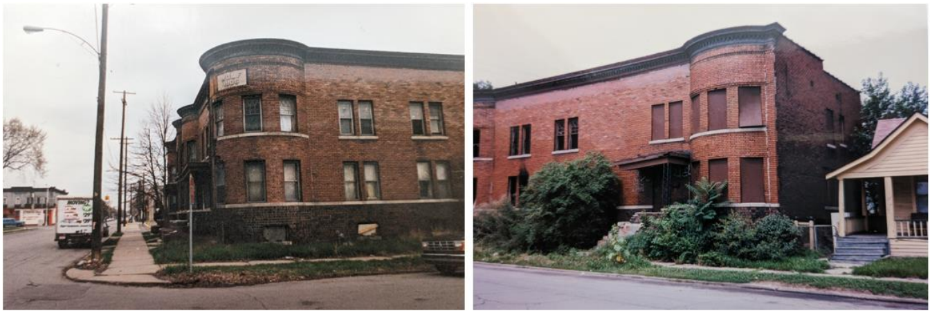
Undated Historic District Commission photographs.

• Historic District Commission records contain no information regarding the former house and garage oriented towards Bagley other than several undated photographs showing the Wolf and house.