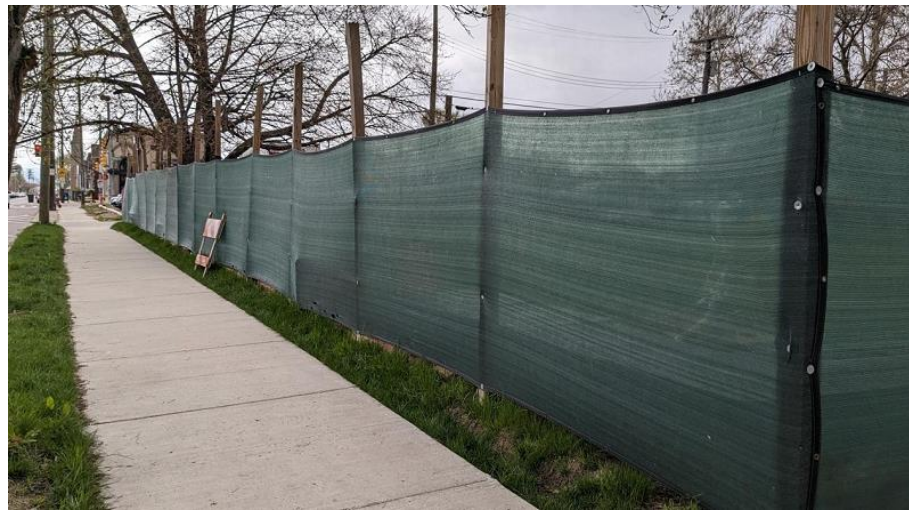
Temporary fabric fence, April 2023 photo by staff.

4132 Bagley is a vacant corner lot currently enclosed by a green fabric windscreen on 4" treated wood posts. Formerly known as 1702–1716 Scotten, the lot once contained a four-unit, two-story townhouse building, a two-story house, and a garage.