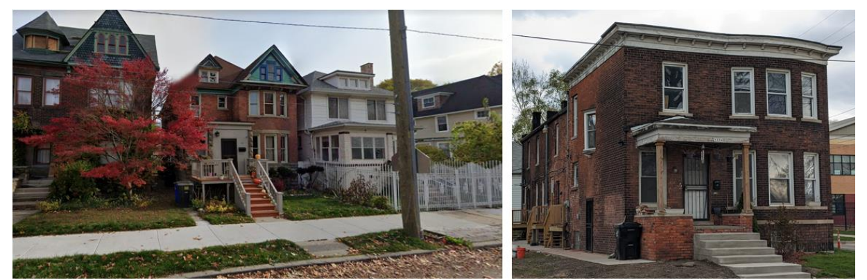
Example buildings on Scotten with shallow setbacks facing Clark Park.

• Staff suggests that any development surrounding Clark Park is appropriate to the extent that it maintains or recreates the aforementioned wall of continuity and employs materials, colors, and design that are not