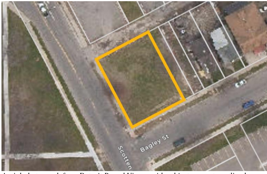
Aerial photograph from Detroit Parcel Viewer with subject property outlined.