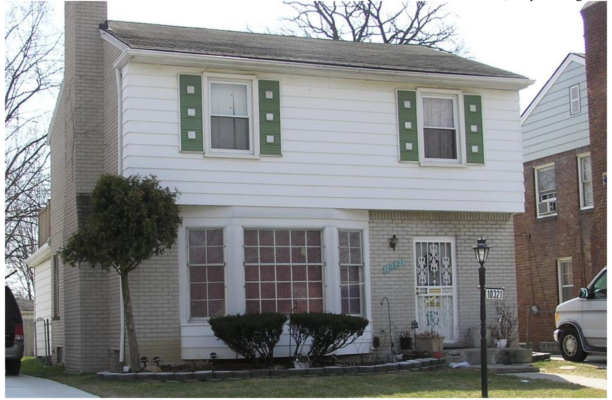
Designation photo, 2006.