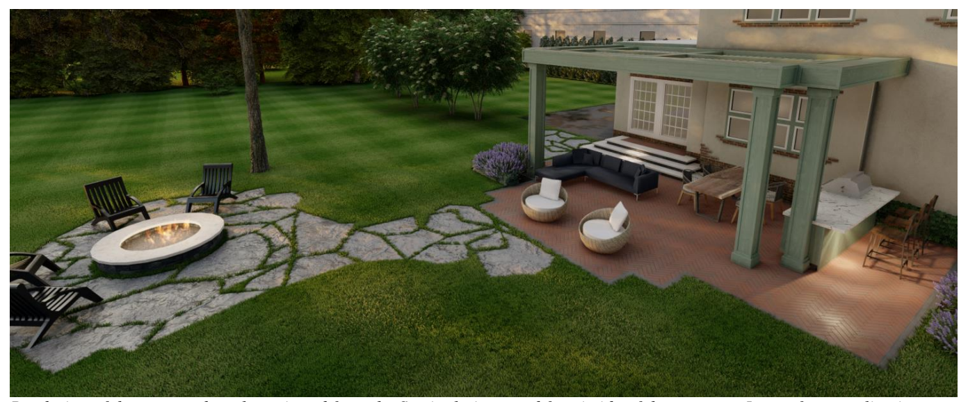
Rendering of the proposed work as viewed from the Seminole (east and front) side of the property. Image from application documents.

As shown in the submitted construction drawings, the applicant proposes to install a pergola, patio, and outdoor kitchen extending from the side (south elevation) of the house and continuing to the south into the area of the adjacent side lot.