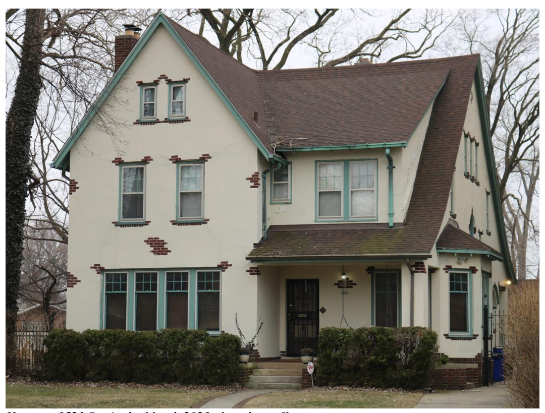
House at 3521 Seminole. March 2023 photo by staff.

The subject property consists of a house at 3521 Seminole and an open side lot at 3509 Seminole. The house appears to date from the 1910s (an exact construction date is not known) and is a two-and-one-half story, gabled-ell house with Picturesque, Arts and Crafts influence. The property incorporates a side lot that appears to have never been developed. Together, the lots are bounded by Seminole on the east, Maxwell on the west, an adjacent building on the north, and another undeveloped lot on under different ownership on the south. The side lot at 3509 Seminole is concealed behind a hedge and fence on the Seminole side and an opaque fence on the Maxwell side.