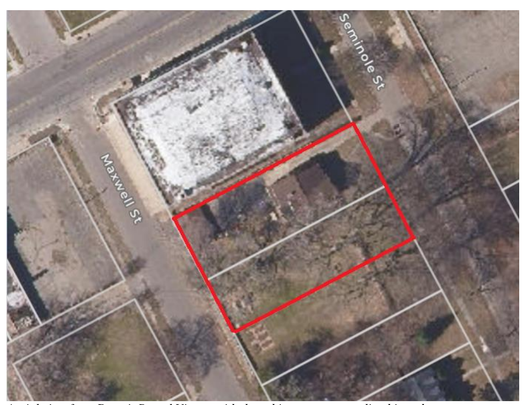
Aerial view from Detroit Parcel Viewer with the subject property outlined in red.