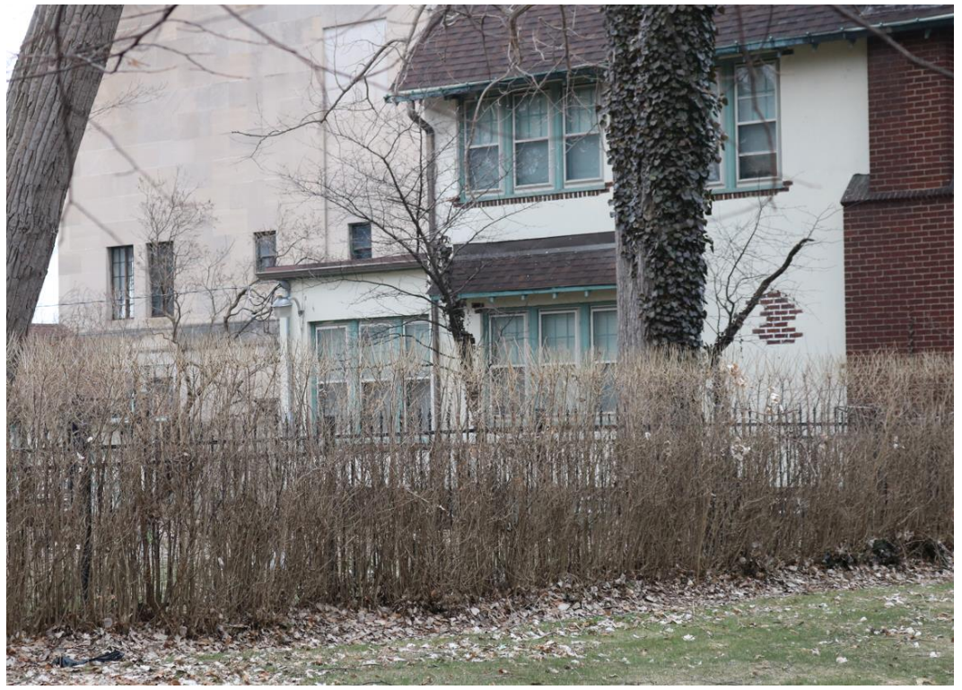
Side lot located at 3509 Seminole. March 2023.