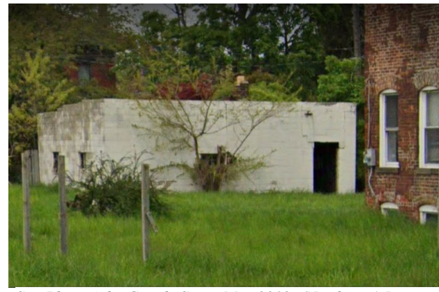
Site Photo 4, by Google Street May, 2019: (Northwest) Rear elevation, showing rear garage prior to demolition.

Sanborn, and based on the limited information available, the garage was non-contributing.