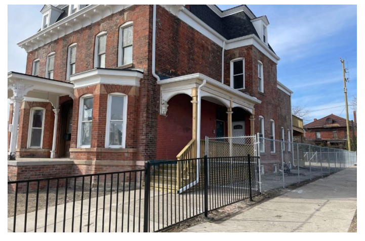
Site Photo 2 February 20, 2023: (East) side elevation, showing front and rear fence installations, east porch installation (work completed without approval).