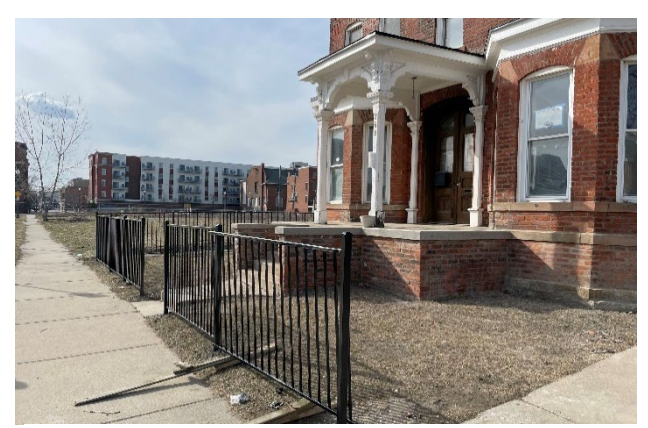
Site Photo5, by Staff February 20, 2023: (South) front elevation, showing front fence installation.

brick east porch entrance, rather than at the corner of the wood post of the east porch, so that the height of the fence does not obstruct the detailing of the building's architecture. (See Site photo 2) Also, staff offers the opinion that the fence be painted black to create some continuity with the front yard fence.