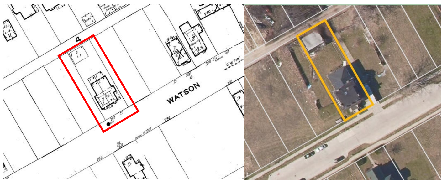
Sanborn V3, P030 1971, showing the demolished garage location.