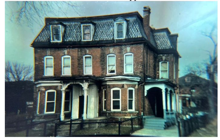
Designation Image, 1975: (Southeast) front elevation.

This property has the following former HDC approvals and violation on Detroit Property Information System (DPI):