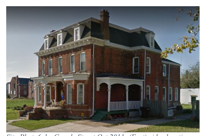
Site Photo6, by Google Street Oct 2011: (East) side elevation, showing east original porch with brick pier supports and original railing and post design. Also note the garage in the rear.