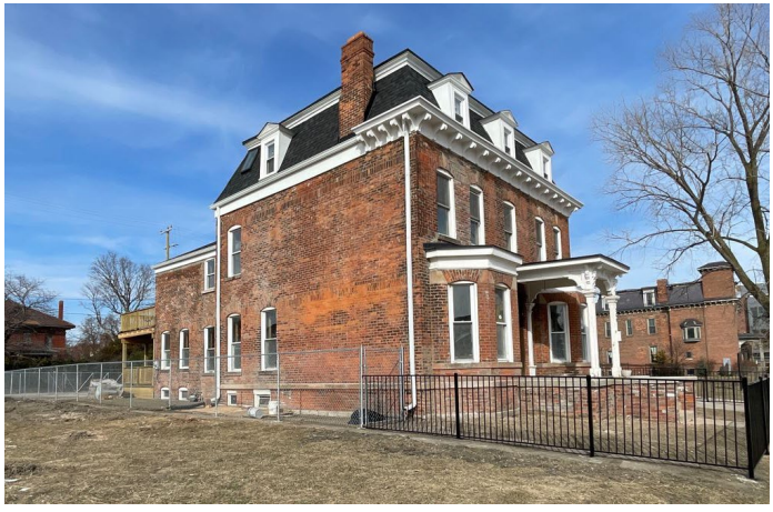
Site Photo 3, February 20, 2023: (West) side elevation, showing front and rear fence installations, and former site of rear garage (work completed without approval).