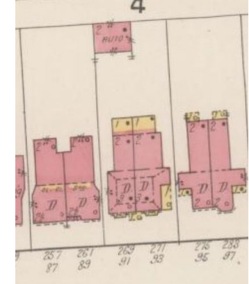
Sanborn V3, P117, 1921, showing the original garage location and materiality.