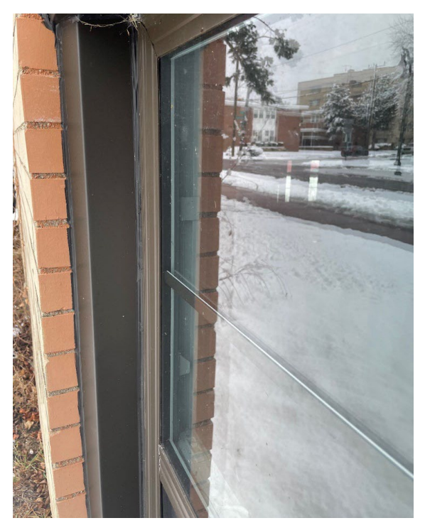
Detail photo 1, by applicant: Third street (west) front elevation, showing where original brick mould was replaced with aluminum brick mould and horizontal muntip between the glass