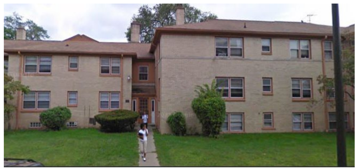
Site photo 4, September 2009: Whitmore (North) elevation, showing 2/2 horizontal muntin, double hung wood windows.