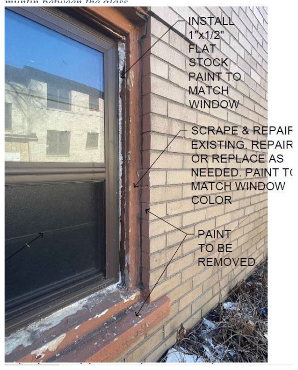
Detail photo 2: Showing exposed brick mould after brake metal was removed. Application proposes to repair wood, scrape and repaint wood, and caulk where needed.