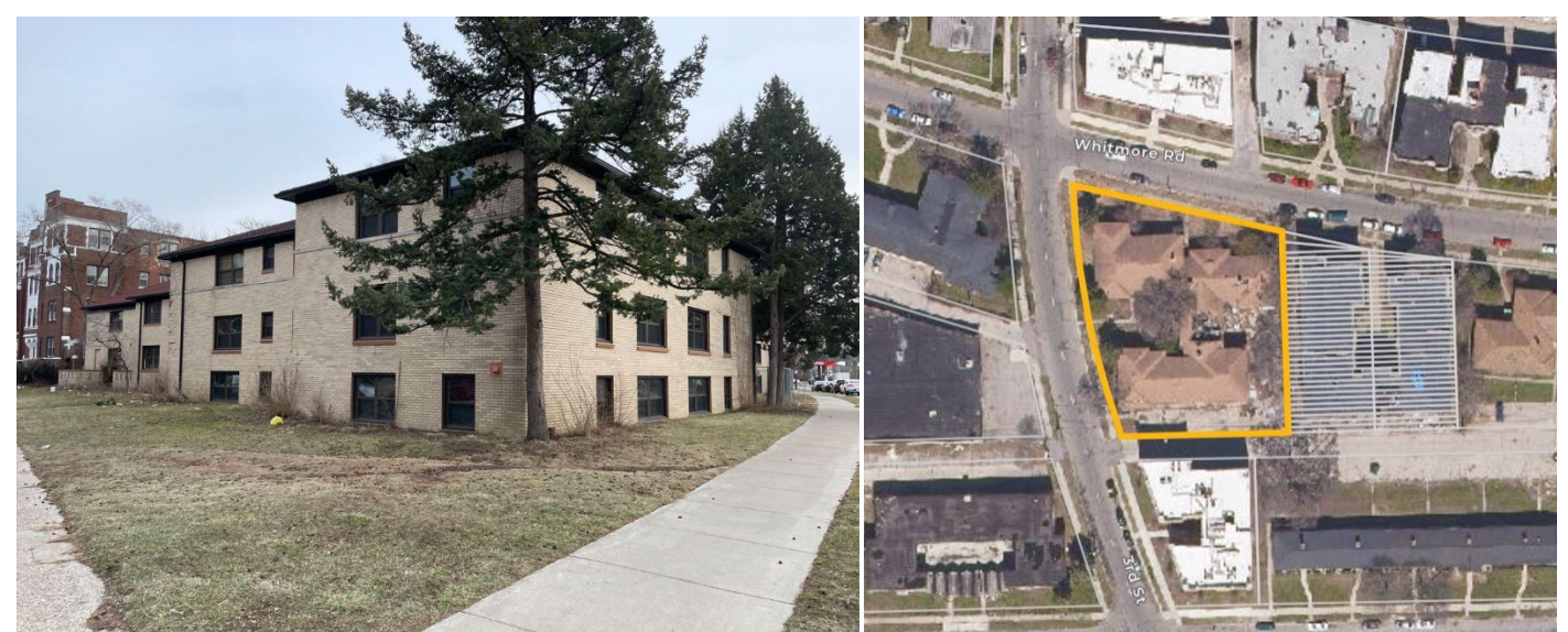
Site Photo 3 February 20, 2023: (North) side elevation on Whitmore, showing vinyl window installation.