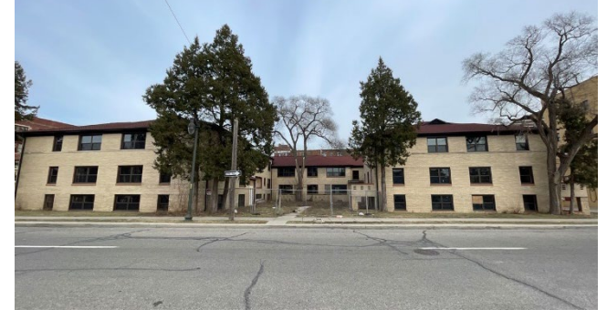
Site Photo 1, by Staff February 20, 2023: (West) Front elevation and courtyard on 3<sup>rd</sup> Street, showing vinyl window installation.