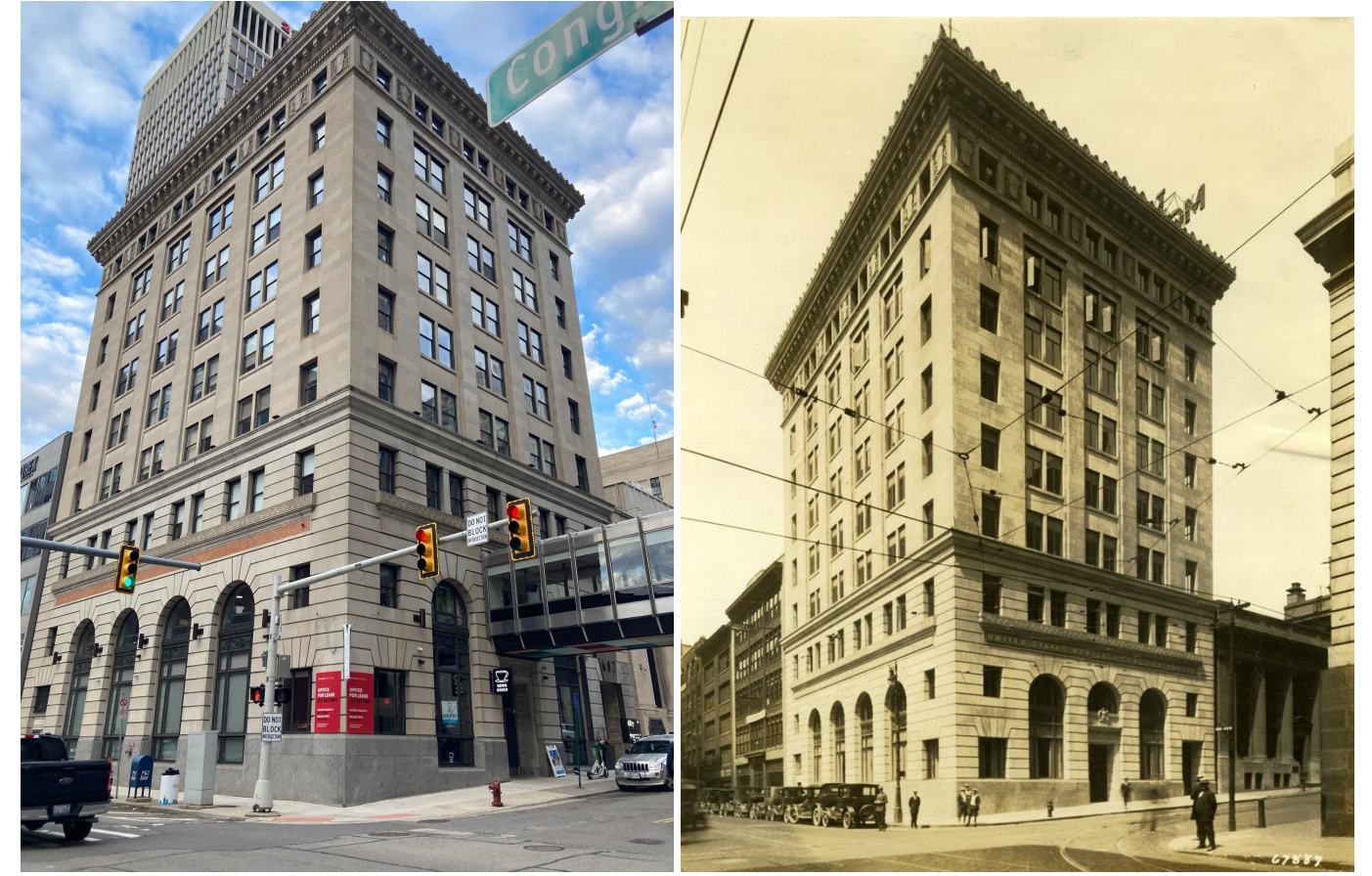
Figure 1. View of 607 Shelby St. looking northwest.

607 Shelby Street, also known as the US Mortgage Bond Building, is located at the northwest corner of Congress and Shelby in the Detroit Financial Historic District. The nine-story office building was completed in 1925 and features a steel frame clad with limestone. The building has a typical three-part Chicago School form, featuring a base with streamlined Renaissance Revival details, a smooth limestone central shaft, and neoclassical frieze and cornice. A pedestrian bridge was constructed in 1962 connecting 607 Shelby and the State Savings Bank Building across Shelby Street.