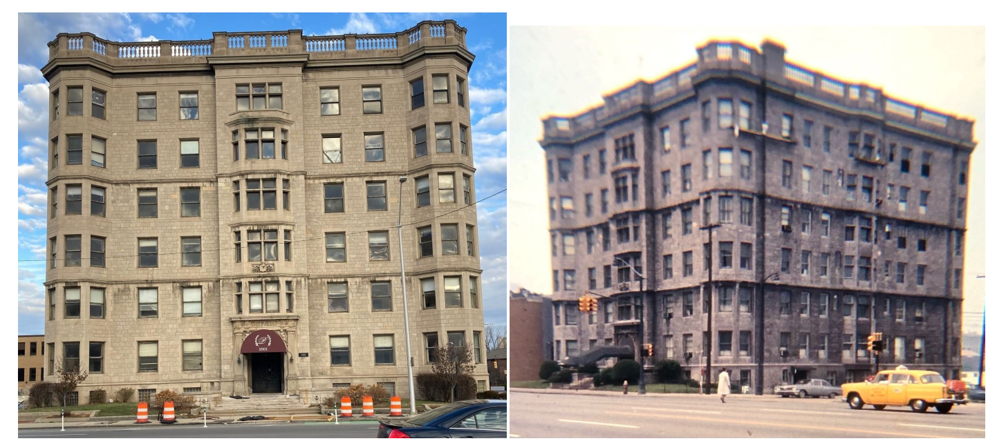
Figure 1. Current view of the Palms Apartments.

The Palms Apartments Building is located at 1001 E. Jefferson Ave, at the northeast corner of E. Jefferson and Rivard Street. Designed by Mason and Kahn and constructed in 1901, the building was one of the first in the world to utilize reinforced concrete construction. The U-shaped building's masonry frame is faced with limestone on the façade and side elevations, and brick at the interior courtyard. The building features a neoclassical carved limestone entry, a prominent balustraded parapet, and stained-glass windows at the basement level and to the central stairway in the courtyard. The building has seen relatively few exterior alterations since its construction. The alterations include the installation of glass block windows at the basement level, new entries at the basement level office space, and asphalt shingle siding on the rear bays.