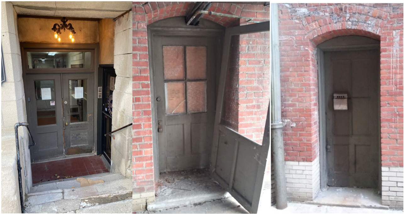
Figure 5. L-R: Storefront door, typical fire escape door, courtyard door.

• The storefront entry door, courtyard doors, and north elevation service door that are proposed for replacement with metal doors appear to be early or original units. The applicant noted the current pair of doors at the Rivard Street entrance do not meet modern egress code.