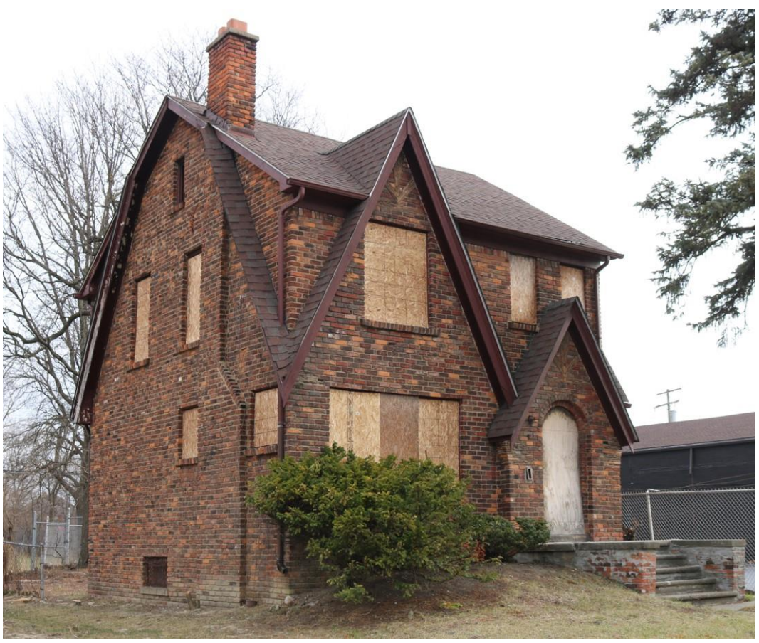
December 2022

12142 Broadstreet is a two-and-a-half story, brick, Tudor Revival house built in 1927. It faces west onto Broadstreet Avenue. Defining features include prominent, sharp gables on the front façade and projecting entrance bay, a gambrel roof, decorative brickwork on the entrance bay, and a raised, landscaped berm on the front (west) side of the house. The windows, previously important features, are now missing; it is unclear if the doors remain.