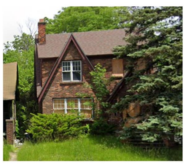
Left: The subject property in 2014. Right: The same property in 2019. All windows are currently missing.